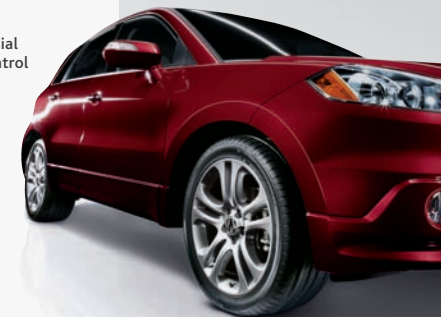
SHOWN WITH ACCESSORY FRONT UNDER-BODY SPOILER, REAR DIFFUSER AND 19-INCH ALUMINUM-ALLOY WHEELS. 13