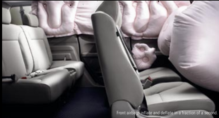
Front airbags inflate and deflate in a fraction of a second.

The Element's full array of airbags includes dual-stage, dual-threshold front airbags, front side airbags with passenger-side Occupant Position Detection System (OPDS) and side curtain airbags with a rollover sensor.† In addition, front seat belts feature an automatic tensioning system that tightens the belts in the event of a moderate to severe impact.