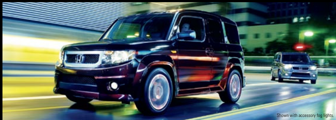
Shown with accessory fog lights.