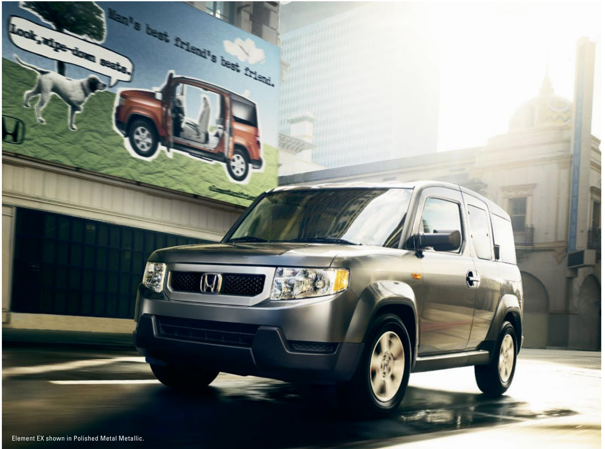
Element EX shown in Polished Metal Metallic.