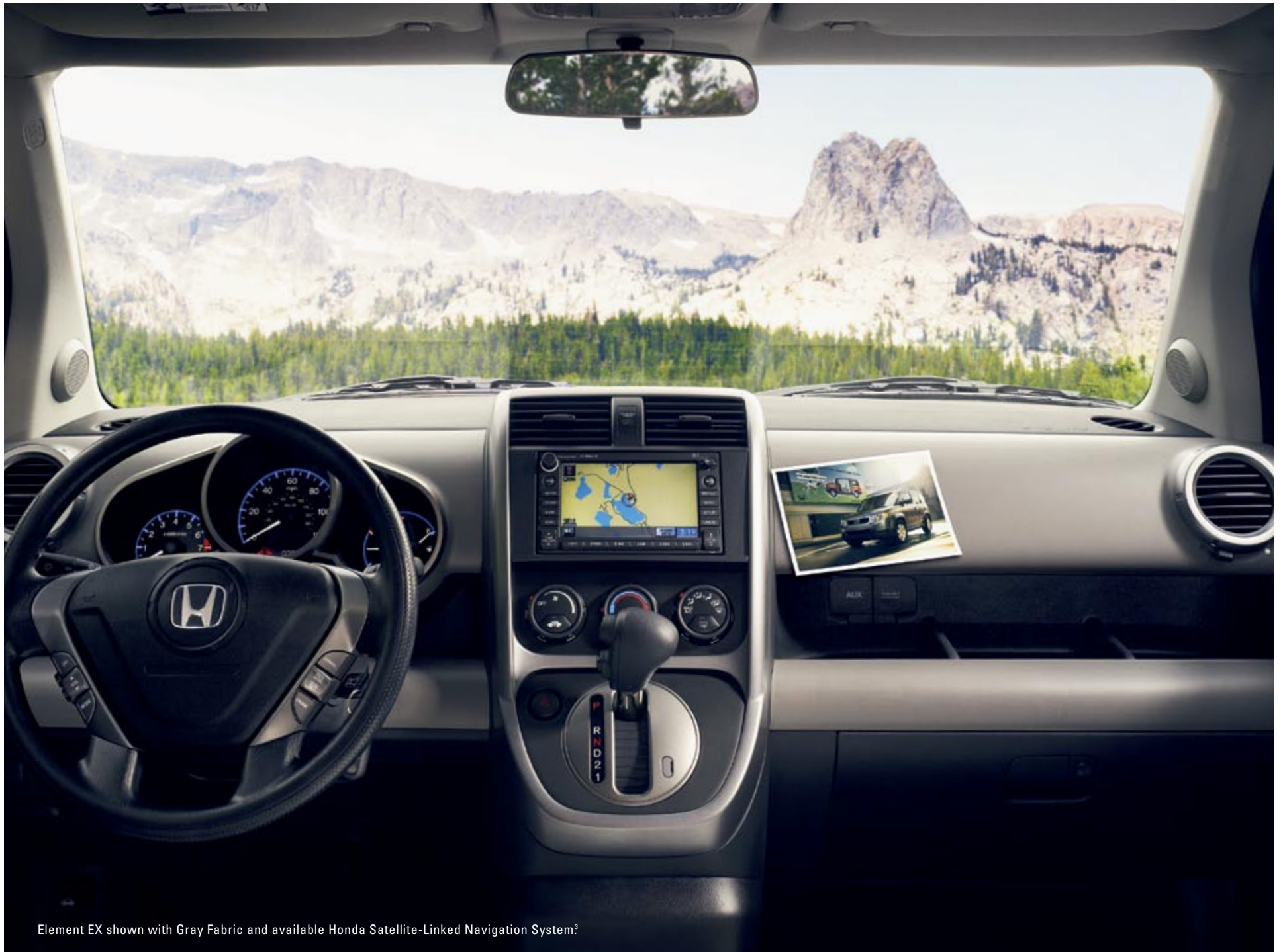
Element EX shown with Gray Fabric and available Honda Satellite-Linked Navigation System 2