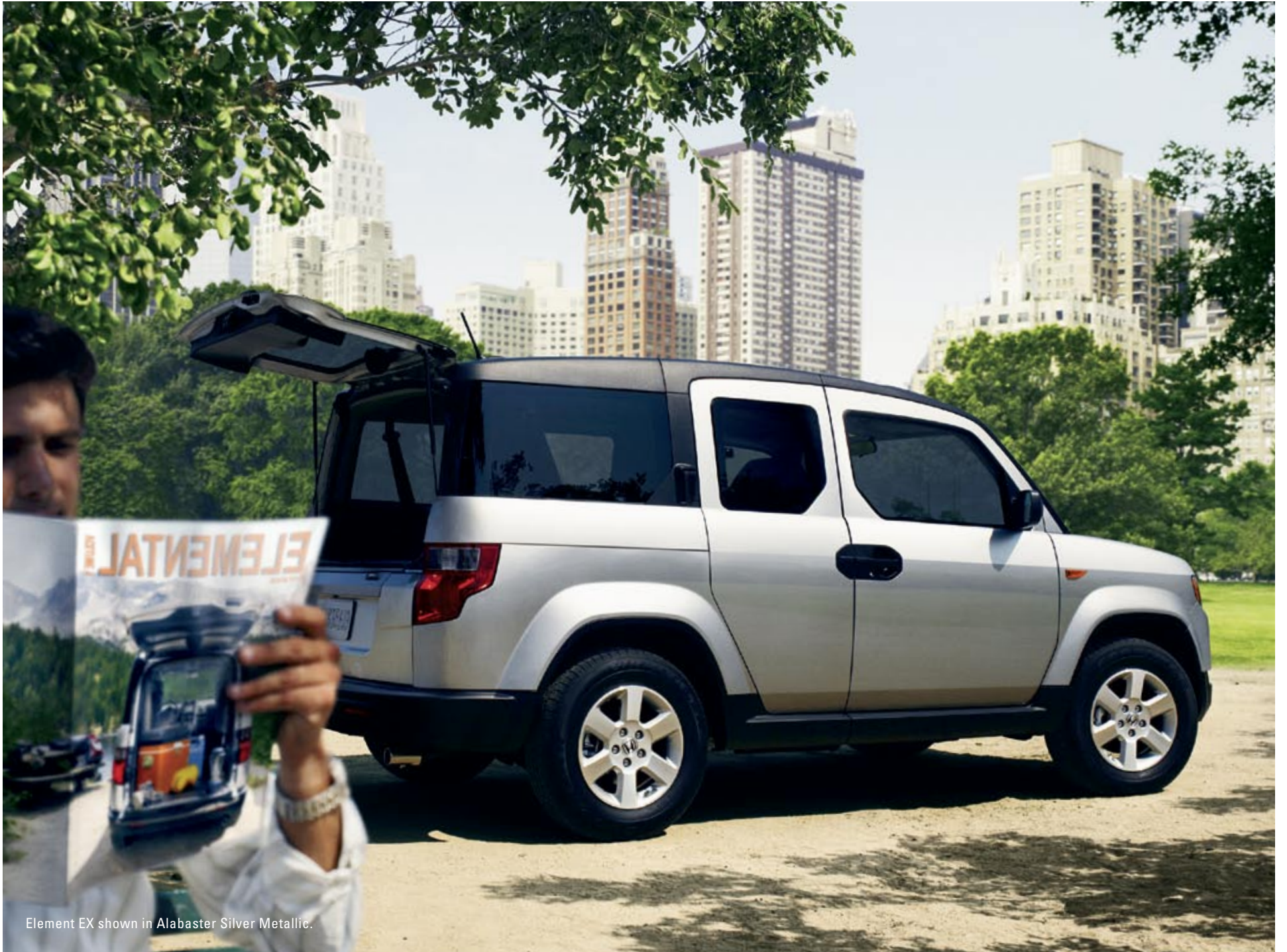
Element EX shown in Alabaster Silver Metallic.