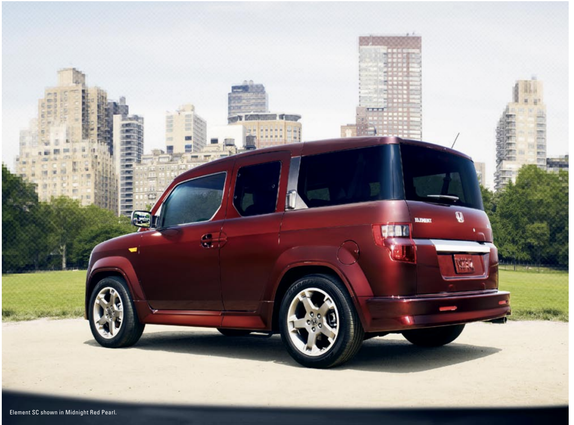
Element SC shown in Midnight Red Pearl.