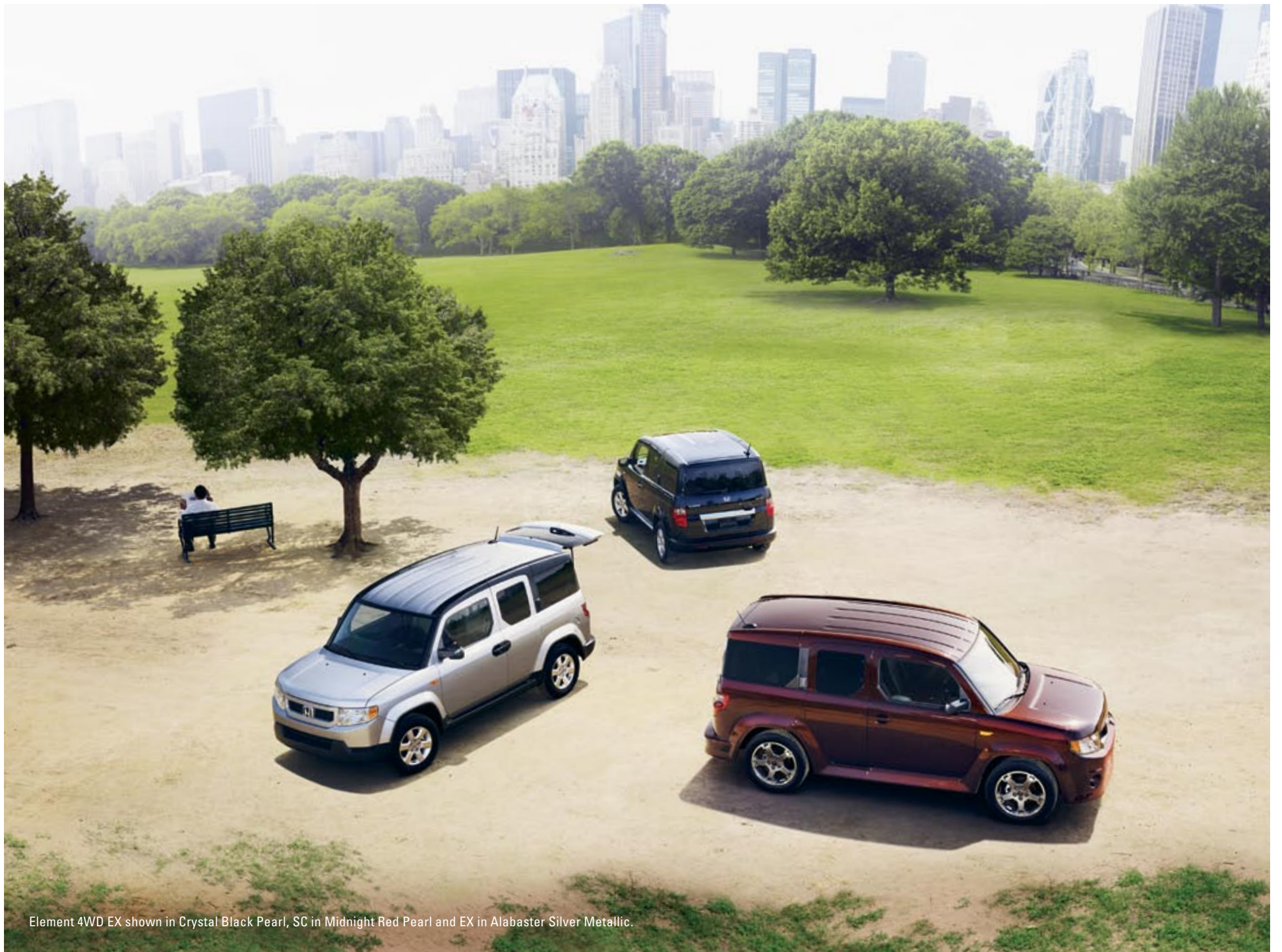
Element 4WD EX shown in Crystal Black Pearl, SC in Midnight Red Pearl and EX in Alabaster Silver Metallic.