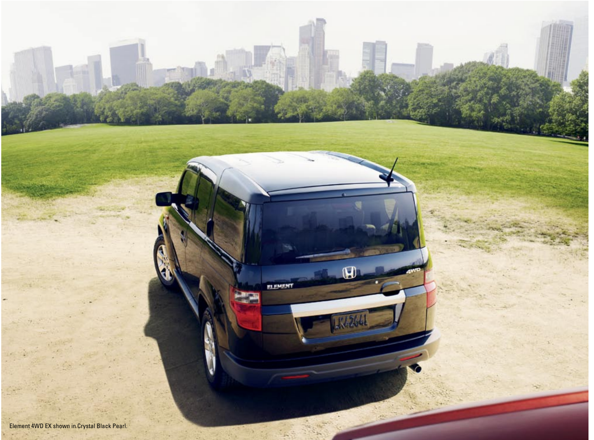
Element 4WD EX shown in Crystal Black Pearl.