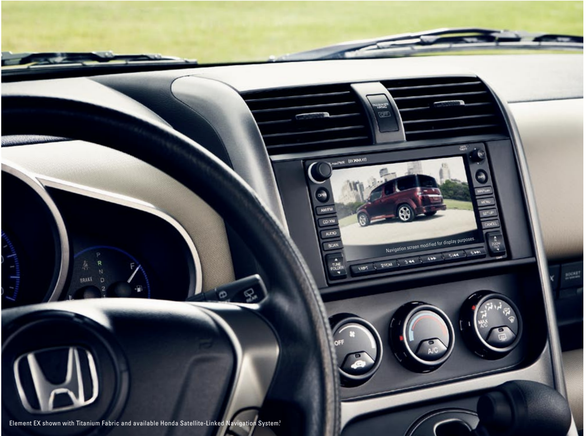
Element EX shown with Titanium Fabric and available Honda Satellite-Linked Navigation System 3