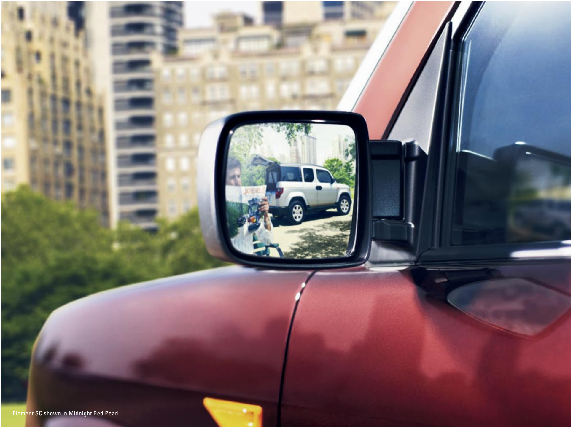
Element SC shown in Midnight Red Pearl.