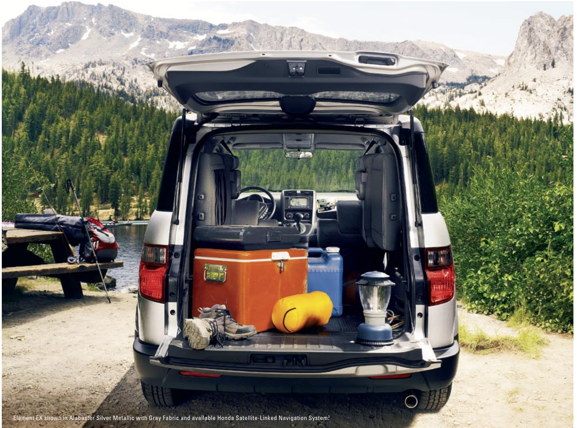
Element EX shown in Alabaster Silver Metallic with Gray Fabric and available Honda Satellite-Linked Navigation System 2