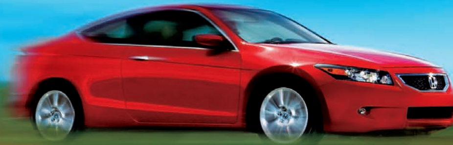
Accord EX-L V-6 Coupe shown in San Marino Red.