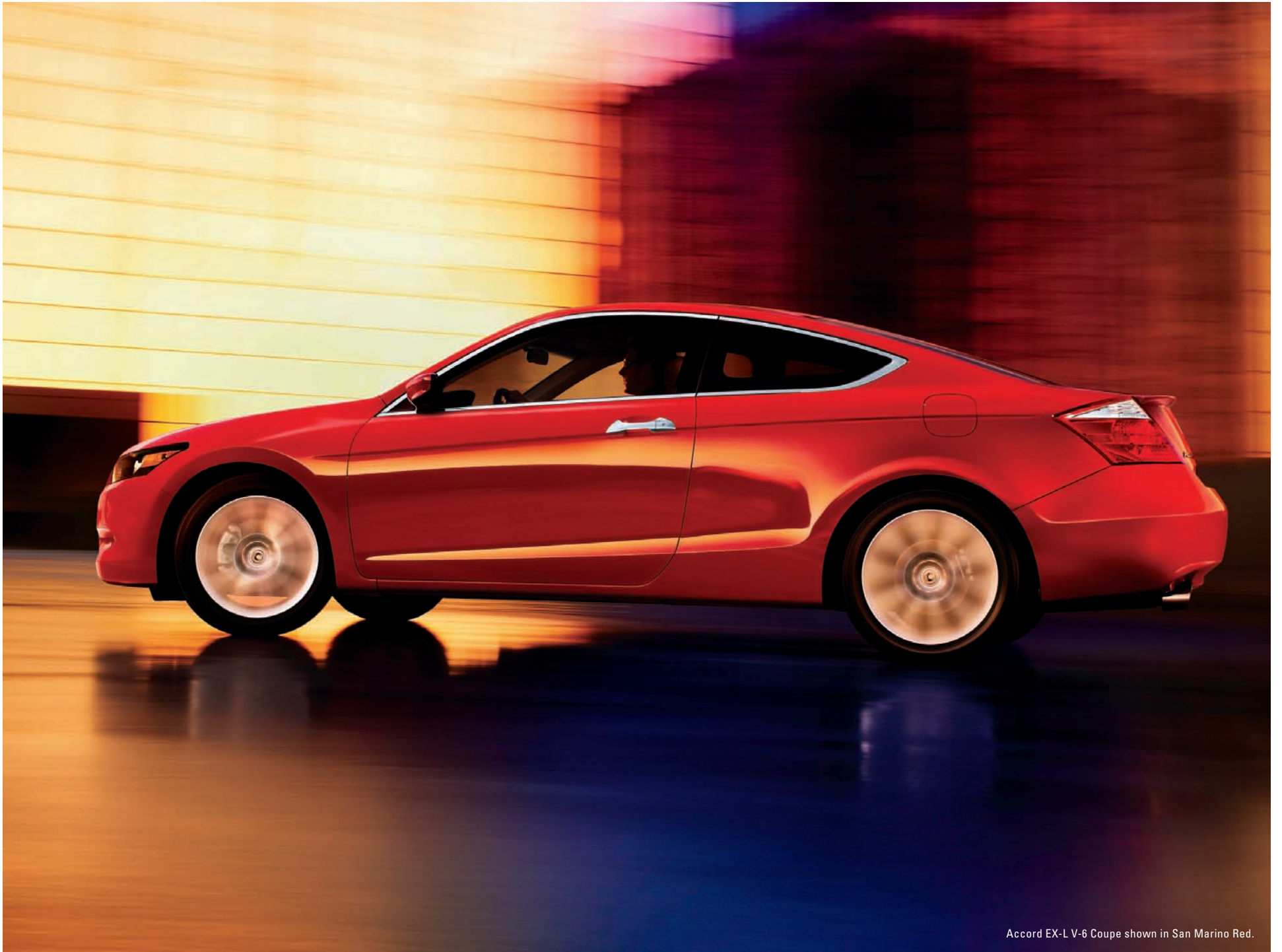
Accord EX-L V-6 Coupe shown in San Marino Red.