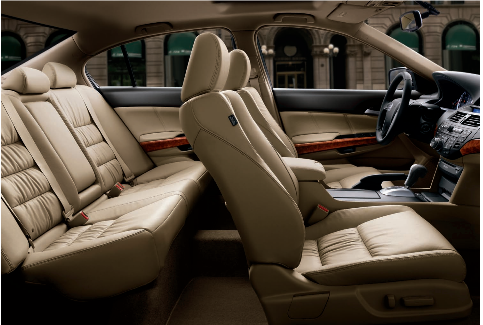
Accord EX-L V-6 Sedan shown with Ivory Leather and available Honda Satellite-Linked Navigation System. TM3