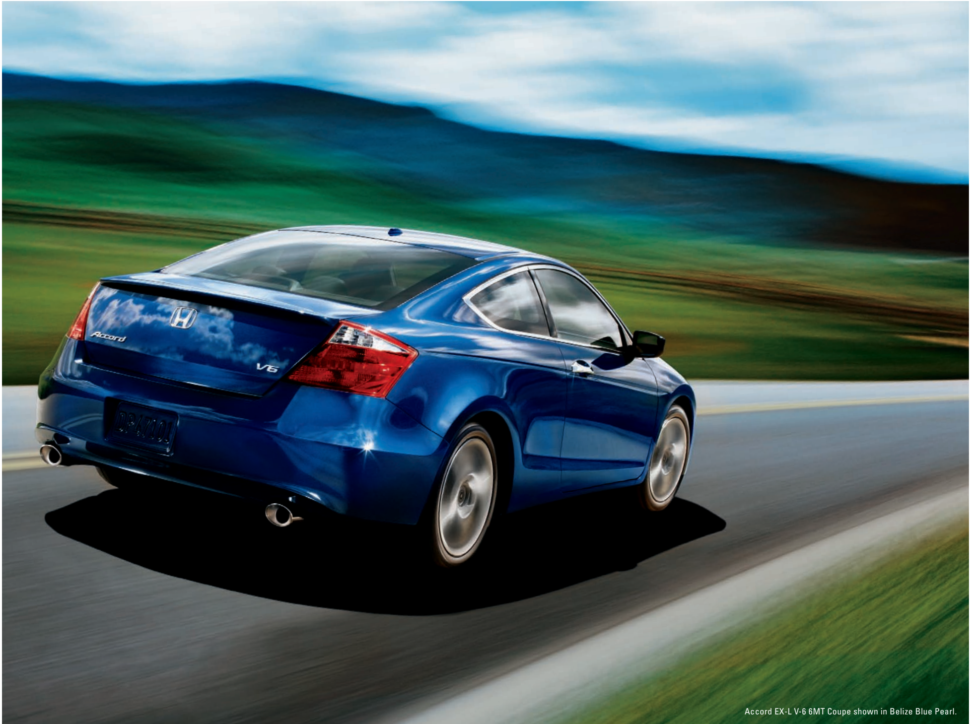
Accord EX-L V-6 6MT Coupe shown in Belize Blue Pearl.