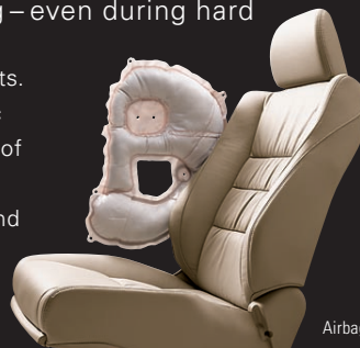
Airbags inflated for display purposes.

All five passengers benefit from 3-point seat belts. The front belts are equipped with an automatic tensioning system that tightens in the event of a moderate-to-severe frontal impact. Outboard rear seats have the LATCH (Lower Anchors and Tethers for Children) child-restraint system.