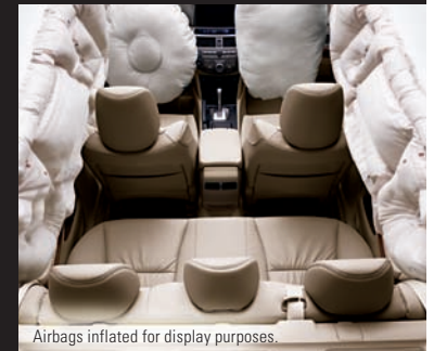
Airbags inflated for display purposes.

To help reduce the likelihood of whiplash injuries in a rear-end impact, the front seats have active head restraints. They move up and forward in a rear collision to help keep head movement to a minimum.