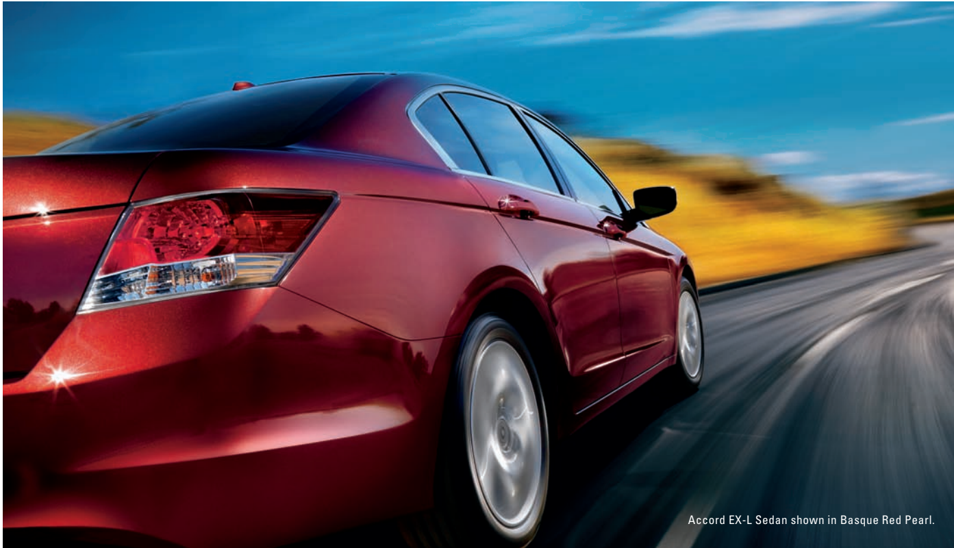
Accord EX-L Sedan shown in Basque Red Pearl.