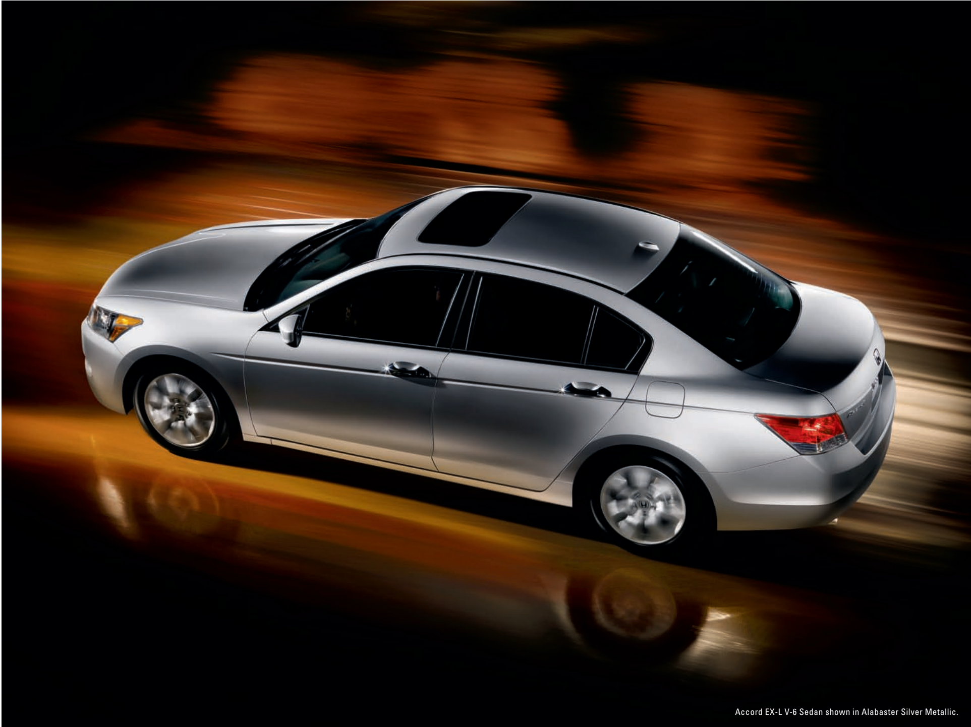
Accord EX-L V-6 Sedan shown in Alabaster Silver Metallic.