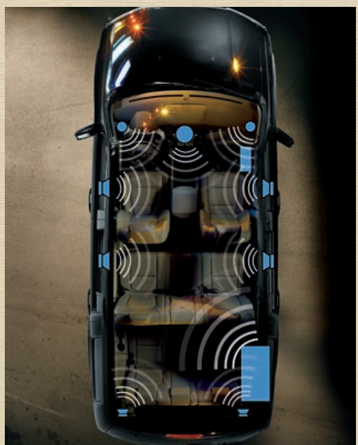
Premium audio system on EX-L with the available RES or Navigation and Touring features 10 speakers, including center channel and subwoofer, surround sound and a 512-watt amplifier. Radio Data System (RDS) on all models can display information on the song currently playing. XM® Radio<sup>7</sup> is standard on EX and above.