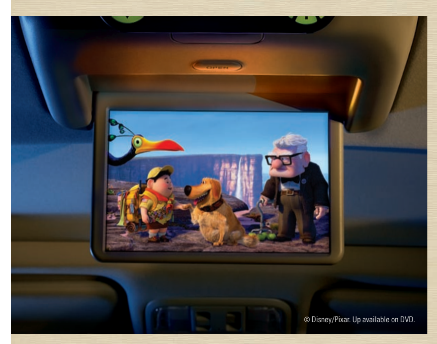
Honda DVD Rear Entertainment System (RES), available on EX-L³ and standard on Touring, lets rear passengers choose their own distinct audio or video source, or plug in a game console.

†Drive responsibly. Some state laws prohibit the operation of handheld electronic devices while operating a vehicle. For safety reasons, always launch your audio application or perform any other operation on your phone or audio device only when the vehicle is safely parked.