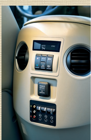
Second row features climate controls and a 12-volt power outlet. RES-equipped models include RCA inputs for a game console or