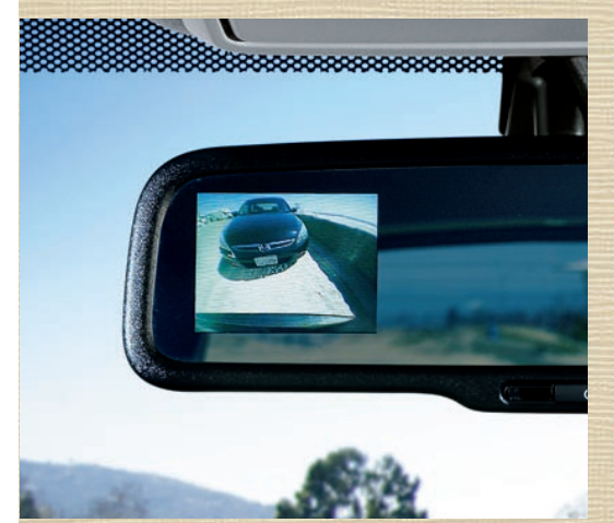
Rearview camera on EX-L models without Navigation utilizes a portion of the rearview mirror as a full-color camera display when you engage reverse. On models with Navigation, the image is displayed on the vehicle's navigation screen.