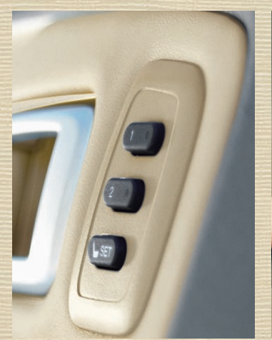
Two-position memory on Touring adjusts driver's seat and outside mirrors.