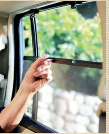
Integrated second-row sunshades are standard on the Touring model.