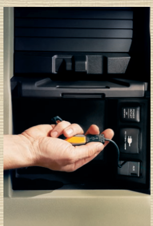
Ports and outlets include a 115-volt outlet and USB Audio Interface<sup>2</sup> on select models.