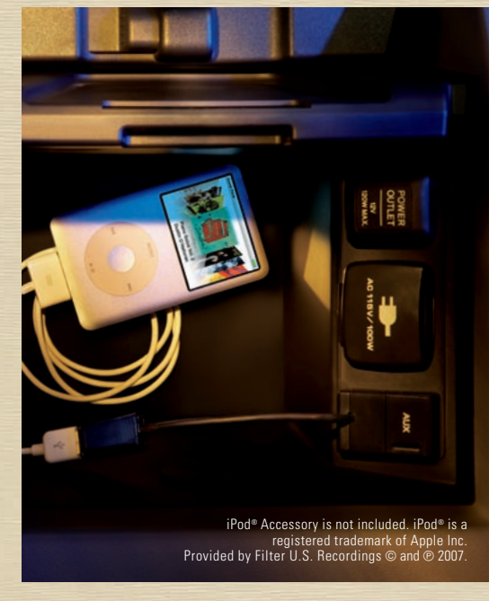
Digital music files can be accessed through the USB Audio Interface<sup>2</sup> on EX-L with available Navigation<sup>4</sup> and Touring or through an MP3/auxiliary input jack on all models.†