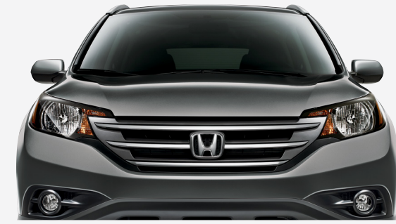
POLISHED METAL METALLIC