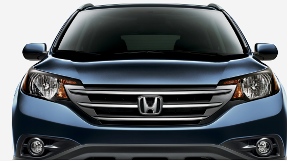
TWILIGHT BLUE METALLIC