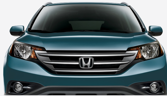
MOUNTAIN AIR METALLIC