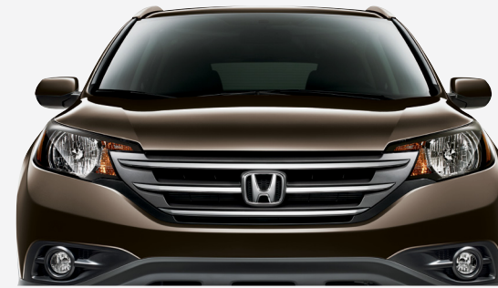
KONA COFFEE METALLIC