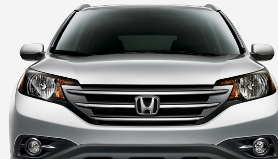
ALABASTER SILVER METALLIC