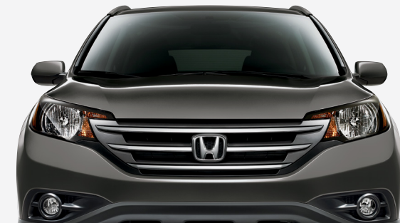
URBAN TITANIUM METALLIC