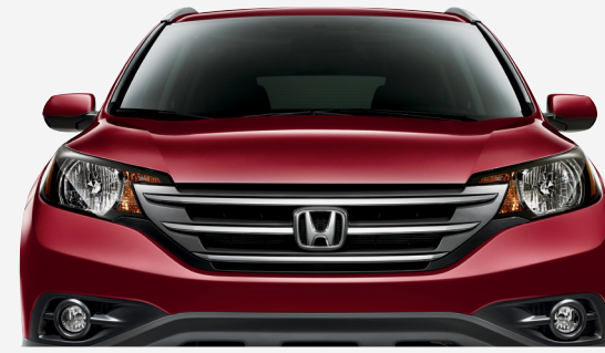
BASQUE RED PEARL II