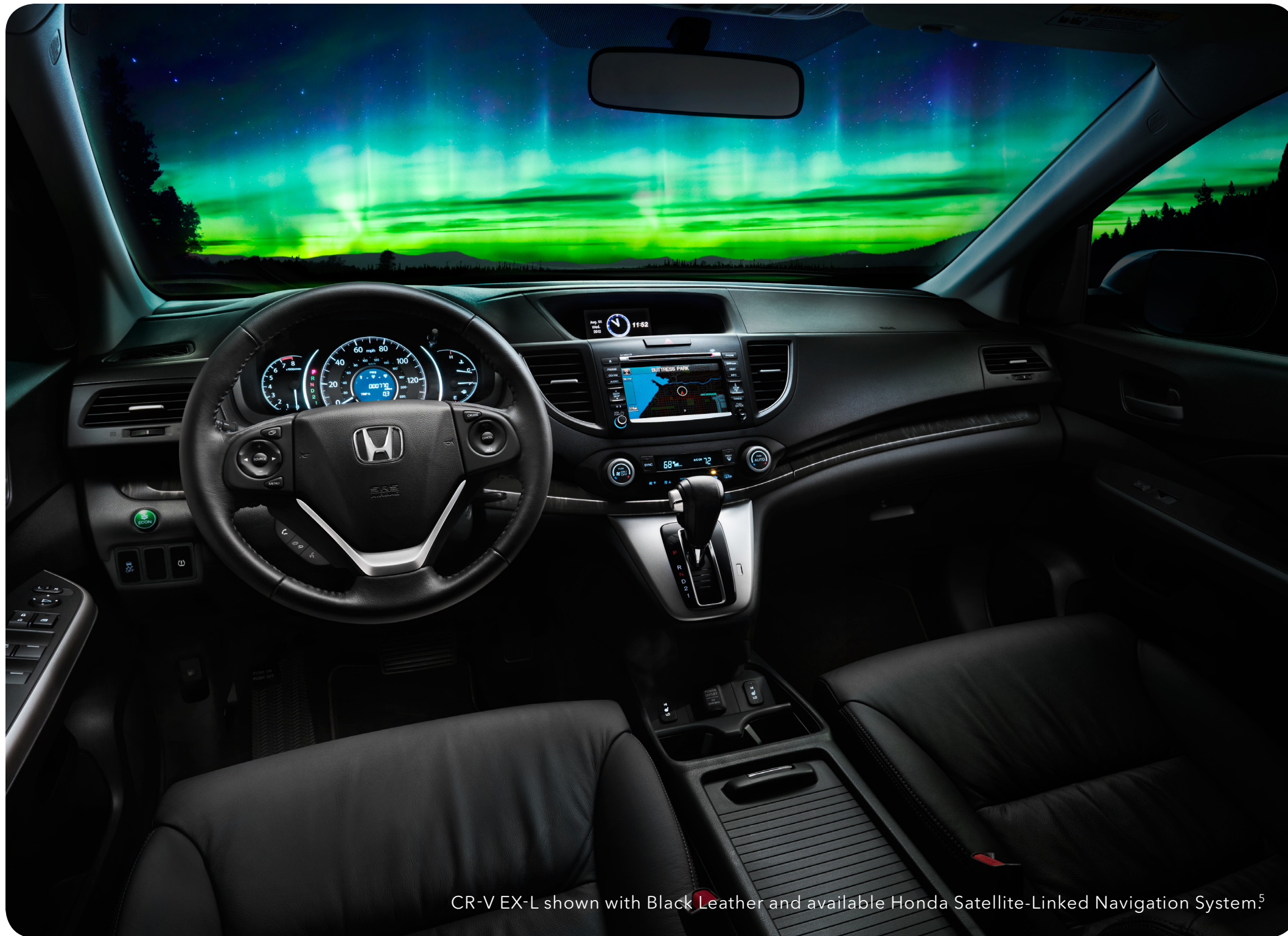
CR-V EX-L shown with Black Leather and available Honda Satellite-Linked Navigation System. 5

The intelligent Multi-Information Display (i-MID) sits right up front and communicates with virtually all of your CR-V's onboard systems. The versatile i-MID can provide turn-by-turn directions (EX-L with navigation 5 ),* display tunes from your iPhone ®† and Pandora ®6 and reads your text messages. 7 It can also customize your CR-V's settings and obtain all kinds of drive-related information, too, like trip range and average MPG.