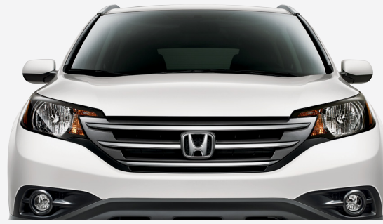
WHITE DIAMOND PEARL