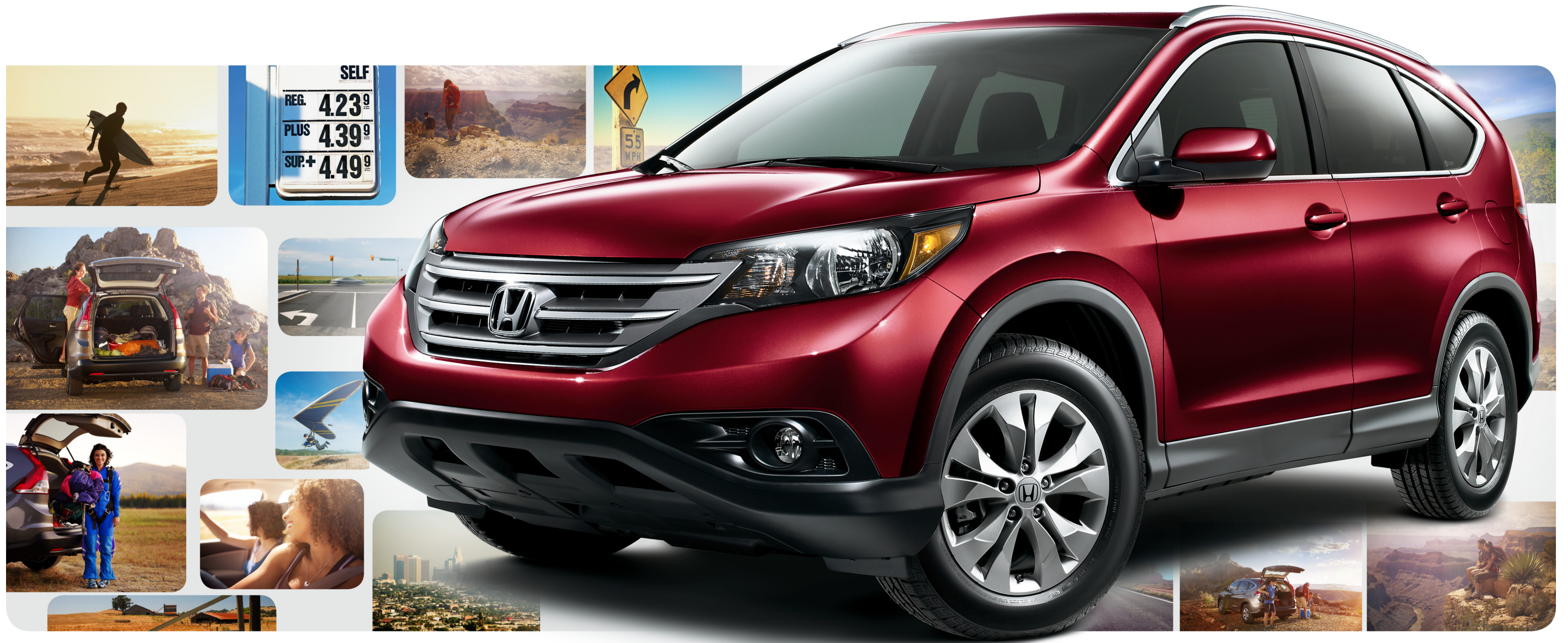
CR-V AWD EX-L shown in Basque Red Pearl II.

From bumper to bumper, the CR-V is loaded with just about everything you need to do all the things you want to do. It's your ultra-versatile adventure partner, built to take you just about anywhere you're willing to go. So buckle up and let's do this. We've got a lot of ground to cover.