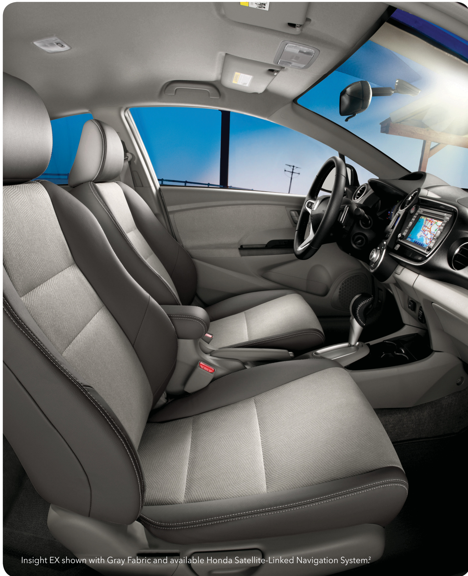
Insight EX shown with Gray Fabric and available Honda Satellite-Linked Navigation System 2