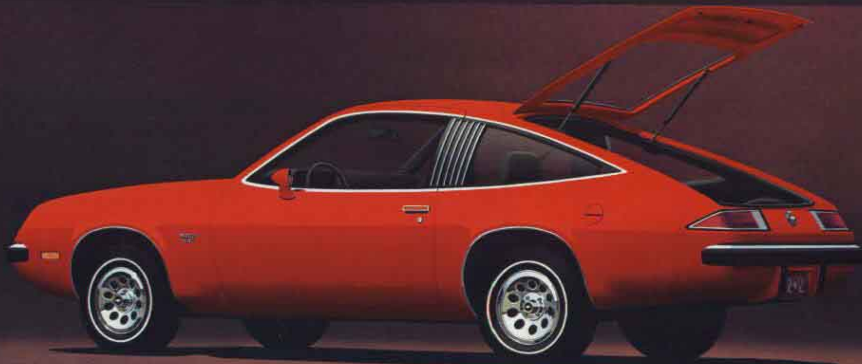
2-2 Hatchback. Shown above with available sport mirrors, aluminum wheels, white stripe tires and wheel opening moldings. Also shown on cover.