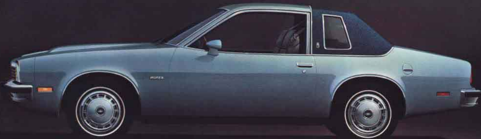
Monza Towne Coupe. Shown with available Cabriolet Equipment, sport mirrors, bumper guards, deluxe bumpers, white stripe tires and wheel opening moldings.