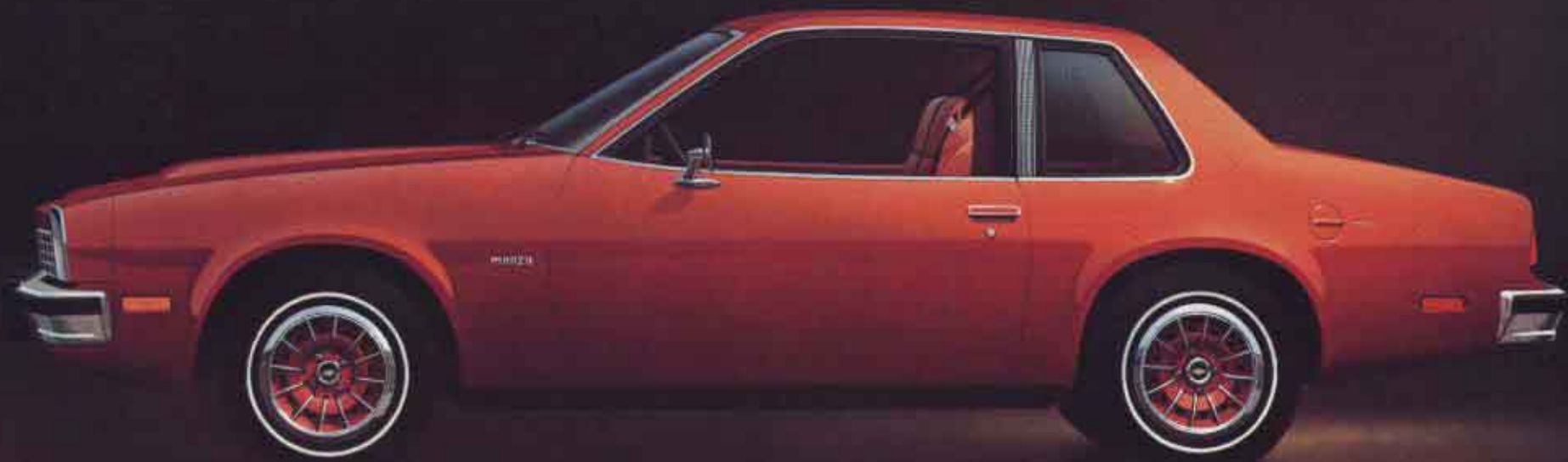
Monza Towne Coupe. (Side, front and rear.) Shown with available Sport Equipment, bumper guards, deluxe bumpers and white stripe tires.