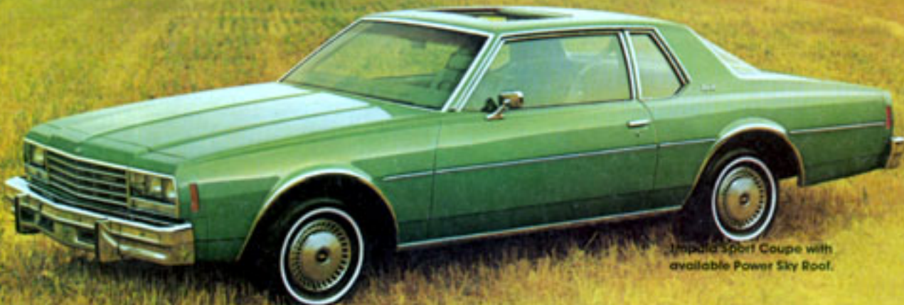
Impala Sport Coupe with available Power Sky Roof.

A WORD ABOUT THE COMPONENTS AND OPTIONAL EQUIPMENT IN THESE CHEVROLETS—The Chevrolets described in this brochure incorporate thousands of different components produced by various divisions of General Motors and by various suppliers to Chevrolet. From time to time during the manufacturing process it may be necessary in order to meet public demand for particular vehicles or equipment, or to meet federally mandated emissions, safety and fuel economy requirements, or for other reasons, to produce Chevrolet products with different components or differently sourced components than initially scheduled. All such components have been approved for use in Chevrolet products by Chevrolet Motor Division and will provide the quality performance associated with the Chevrolet name. With respect to extra cost optional equipment, make certain you specify the type of equipment you desire on your vehicle when ordering it from your dealer. Before taking delivery of the vehicle, we suggest you verify that it includes the optional equipment that you ordered or if there are changes, they are acceptable to you.