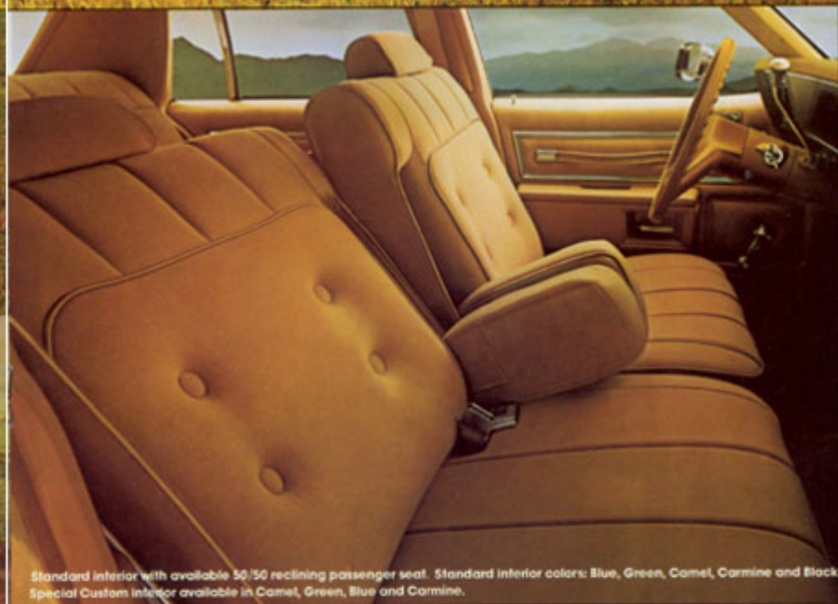
Standard interior with available 50/50 reclining passenger seat. Standard interior colors: Blue, Green, Camel, Carmine and Black. Special Custom interior available in Camel, Green, Blue and Carmine.