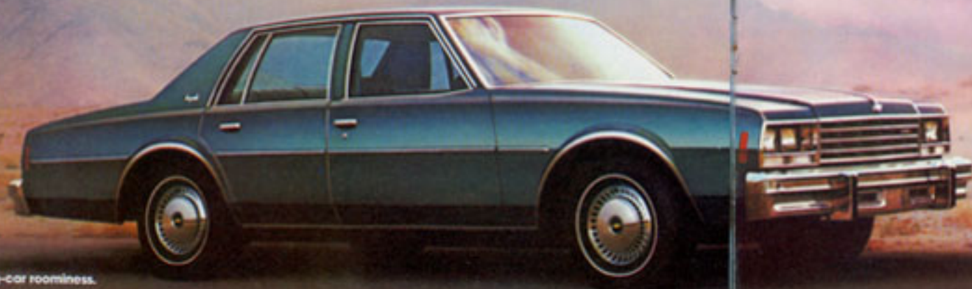
The Sedan. With big-car roominess.

Impala is available as a Sedan, Coupe, 2-seat or 3-seat Wagon (see wagon catalog for details). Also, a Landau Coupe with elk-grain vinyl cover on forward portion of roof, wire wheel covers, dual sport mirrors, accent striping and distinctive Landau nameplates.