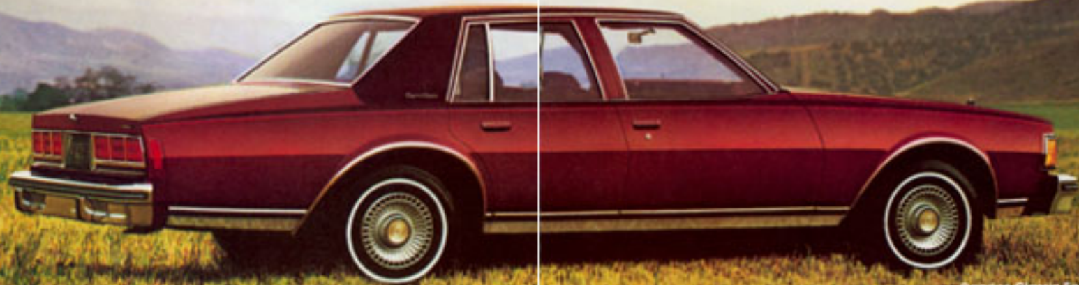
Caprice Classic Sedan.

Select available Special Custom interior or Caprice Classic's standard interior tailored in smooth-finish knit cloth or available all-vinyl.