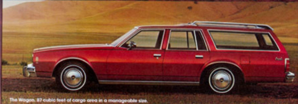
The Wagon. 87 cubic feet of cargo area in a manageable size.