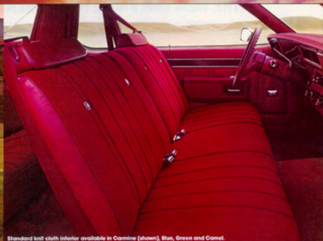
Standard knit cloth interior available in Carmine (shown), Blue, Green and Camel.