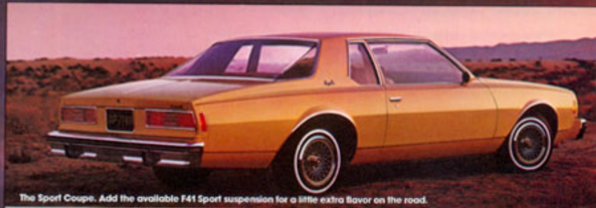
The Sport Coupe. Add the available F41 Sport suspension for a little extra flavor on the road.