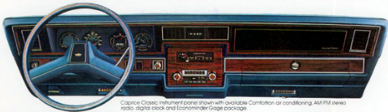
Caprice Classic instrument panel shown with available Comforton air conditioning, AM-FM stereo radio, digital clock and Econominder Gage package.

moon or outside air (reduces front seat head room slightly).