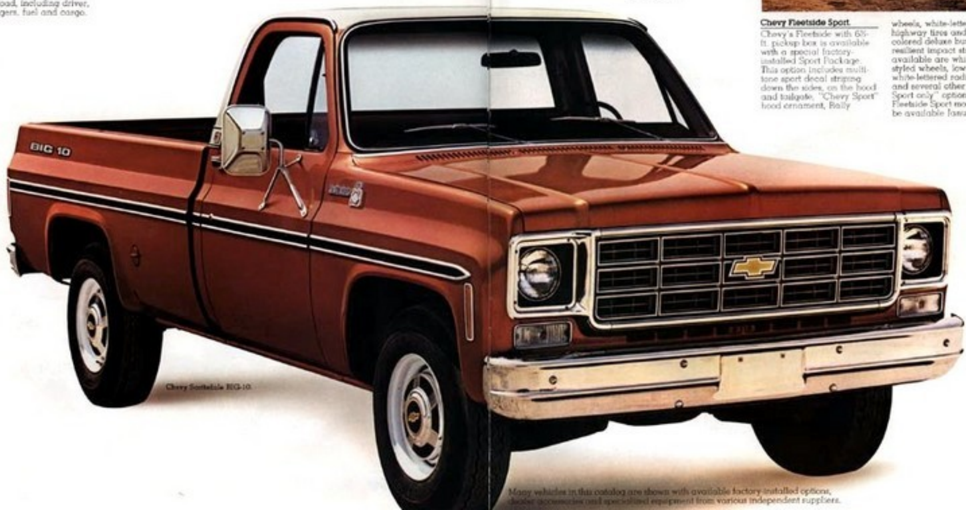
Chevy Fleetside BIG-10.

wheels, white-lettered on-off highway tires and body-colored deluxe bumpers with resilient impact strips. Also available are white-spoked styled wheels, low-profile, white-lettered radial tires and several other "Chevy Sport only" options. The Fleetside Sport model should be available January, 1978.