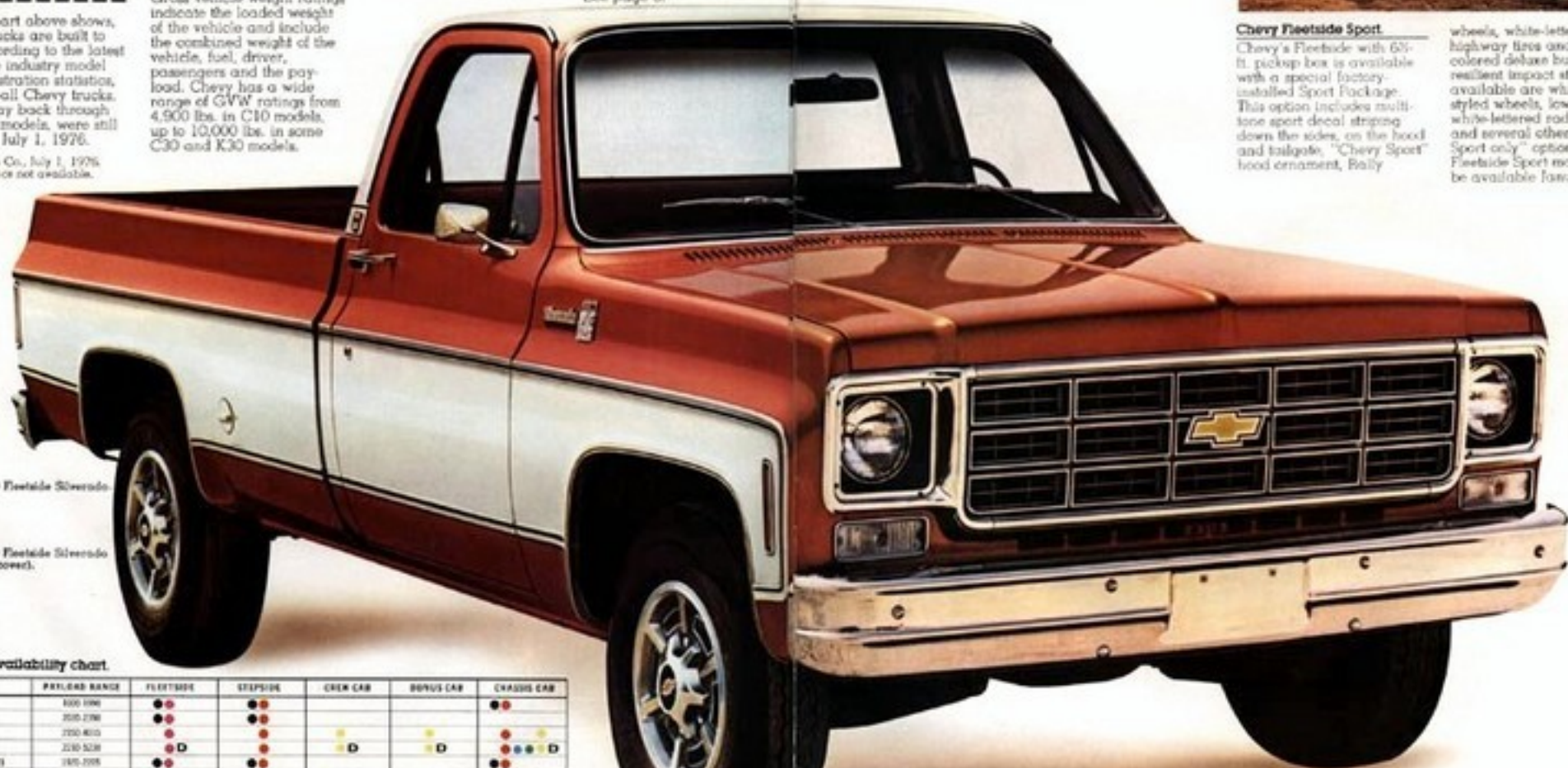
Chevy C20 Fleetside Silverado

wheels, white-lettered on-off highway tires and body-colored deluxe bumpers with resilient impact strips. Also available are white-spoked styled wheels, low-profile, white-lettered radial tires and several other "Chevy Sport only" options. The Fleetside Sport model should be available January, 1978.