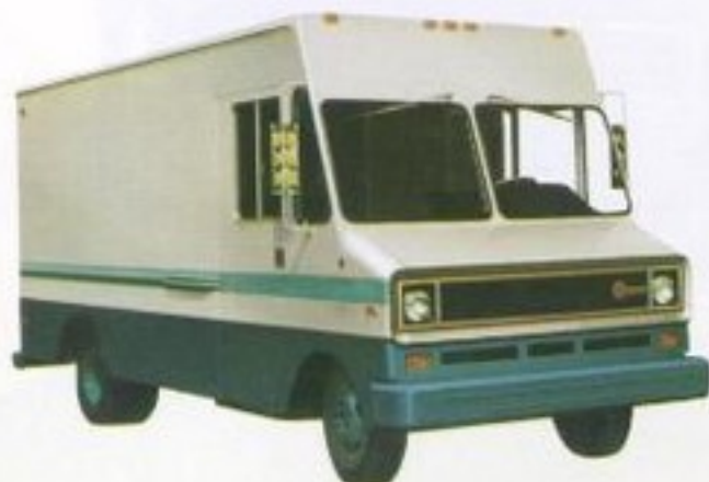
Avan by Airstream