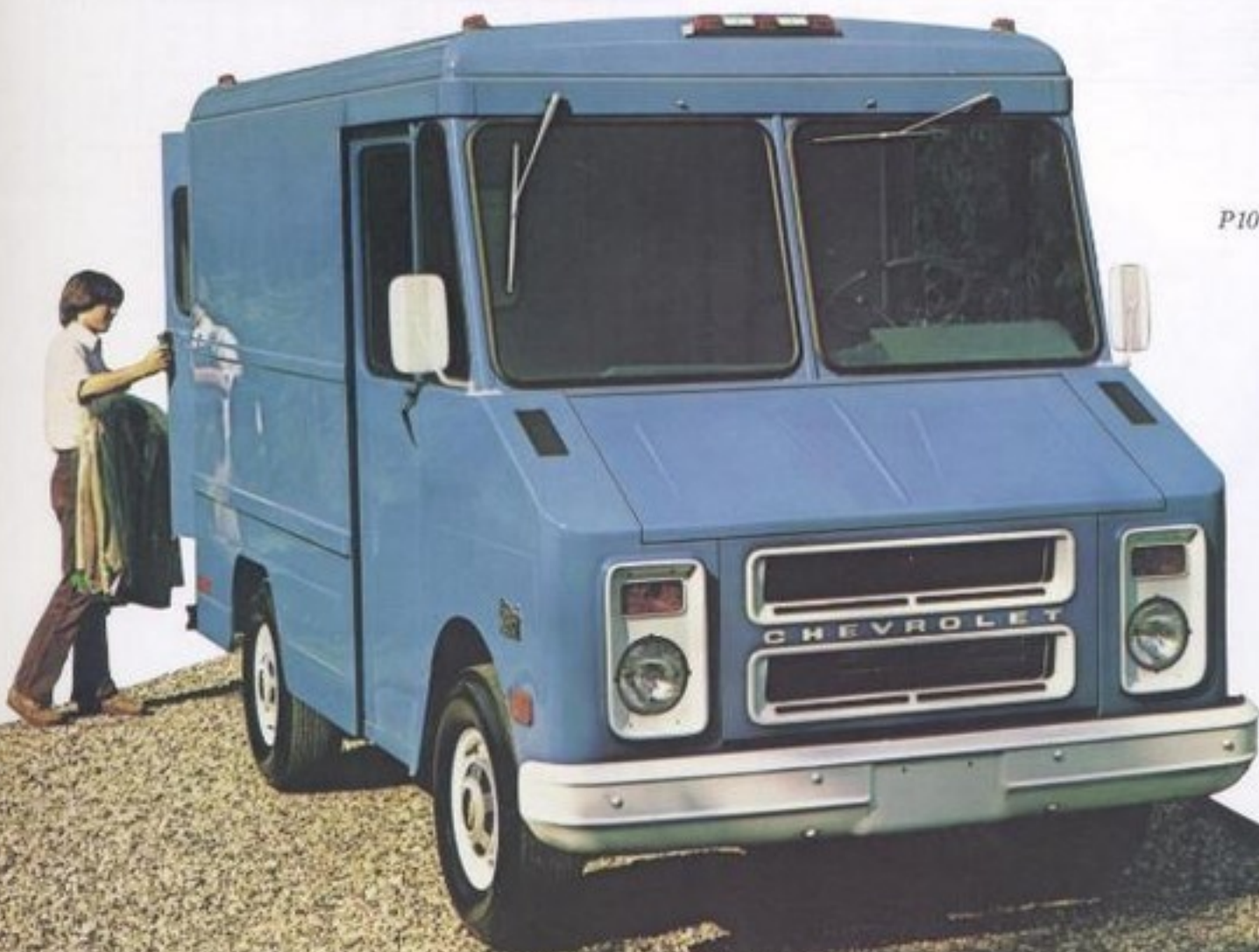
P10 Step-Van 8' Steel

Wraparound double doors. Wide doors fold back flush with side panels for easy access. Width keyed to body size. Available on all P20 and P30 models.