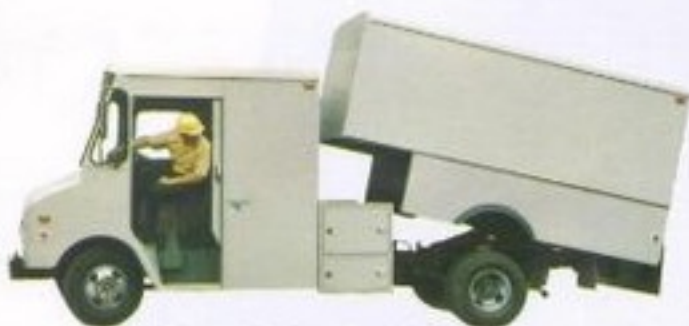
J. B. E. Olson Body Co.

Many vehicles in this catalog are shown with available factory-installed options, dealer accessories and specialized equipment from various independent suppliers.