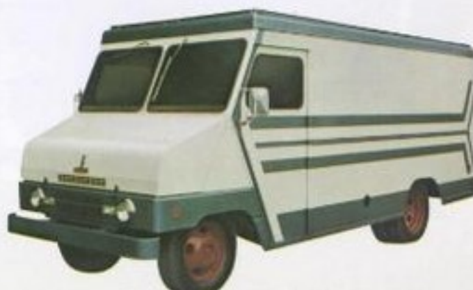
Boyertown Auto Body Works