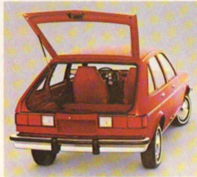
Roomy cargo space.

*Except Chevette Scooter Hatchback Coupe.