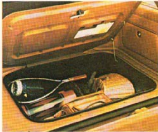
Lockable storage space.