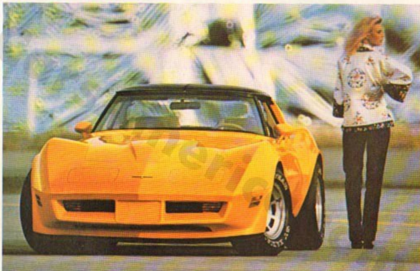
Corvette Coupe shown in Corvette yellow.

For 1980, Corvette remains a trim machine—with comfort and convenience features to add pleasure to the sport of driving.