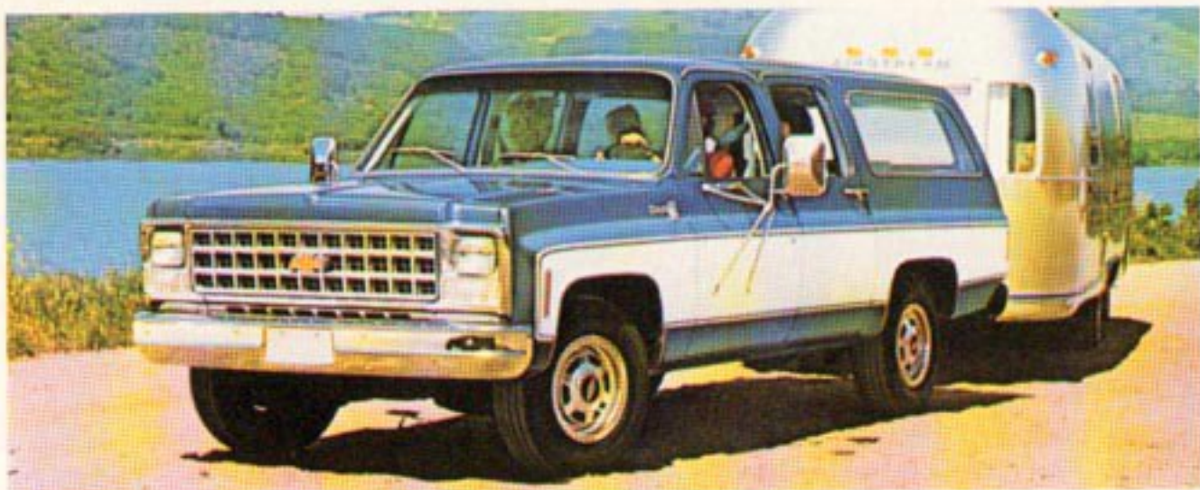
Chevy C20 Suburban shown in available Special Two-Tone Nordic blue and white.

Suburban does what few other wagons can do. Properly equipped, it can seat up to nine adults with room to spare. Or it can take on up to 144 cubic feet of cargo. And properly equipped, the C20 can move up to 15,000 lbs., including Suburban, passengers, gear and trailer (7000-lb.-capacity, weight-distributing hitch platform is available through Chevrolet. Larger capacity platforms are available from outside sources). No ordinary wagon even comes close—in towing capacity, room or solid truck build. Chevy Suburban is built tough, on a tough truck chassis. A wide selection of engines, plus conventional 4-wheel drive with manual locking front hubs is available.