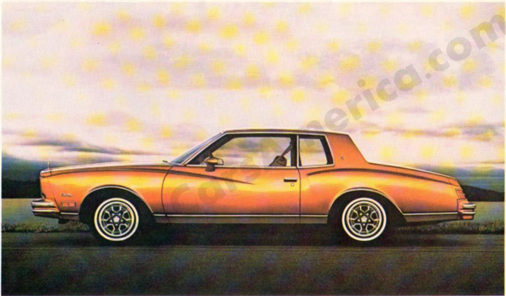
Monte Carlo Coupe shown in light camel.