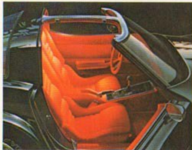
Corvette interior shown in red.

Corvette for 1980. As you can see, Corvette engineers have been successful once again in refining our legendary classic. The new, more aerodynamic front bumper cover now features an integral air dam and deeply recessed grille and parking lights. There's a new hood with a lower profile. New rear bumper cover with an integral rear spoiler. New taillights. And cornering lights, new to Corvette as well as being standard, are fully automatic.