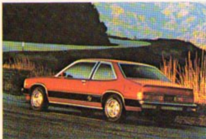
Citation X11 shown in claret.

You'll find Citation a good car to be in when you're in heavy city traffic. There's rack-and-pinion steering to help you maneuver in and out, a Full Coil suspension system to help soak up bumps. You're also going to like Citation's 2.5 Liter 4-cylinder engine and 4-speed overdrive transmission (not available in California at time of printing) to help you get away from it all.