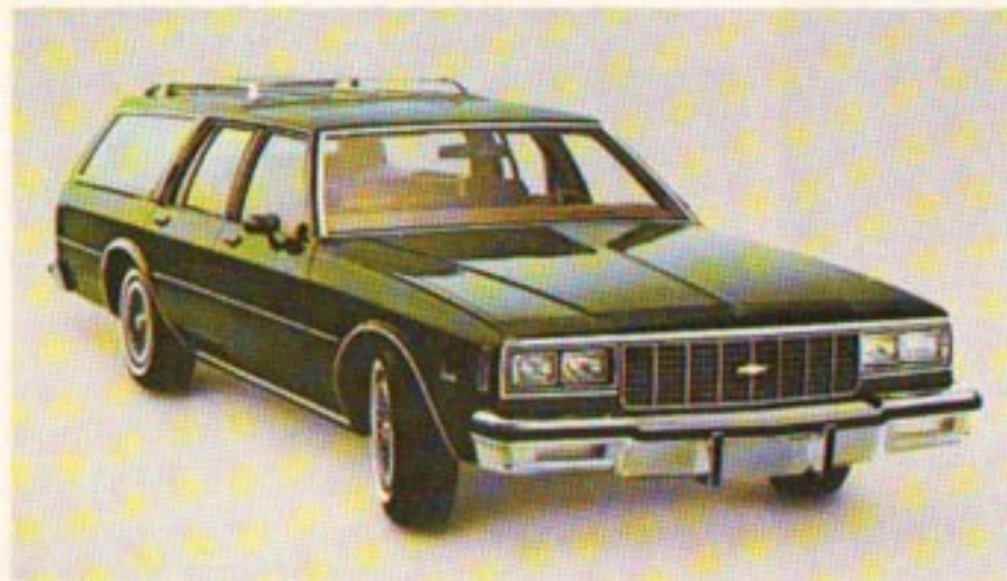
Impala Wagon shown in dark green.

Impala. Versatility and value have been traditionally the hallmarks of an Impala Wagon. 1980 is no exception. On the outside, distinctive style accents and new grille styling. Like the Caprice, Impala offers an available third seat option that lets you take more passengers along in full-size Chevrolet style and comfort. Standard features include a convenient, column-mounted headlight dimmer and turn signal control; a lockable glove compartment with light; one-piece cut-pile carpeting under your feet in the passenger compartment; a formed, soft one-piece headliner over your head, and more.