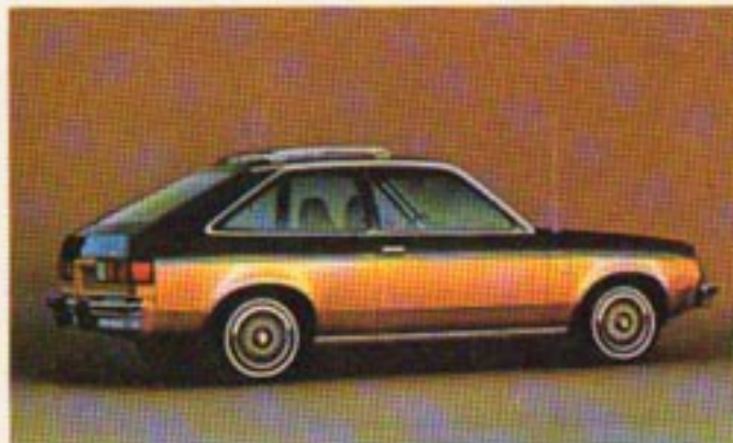
Chevette 2-Door Hatchback Coupe shown in available Custom Two-Tone black and light camel.

bumper guards are now standard on all models. Brake system refinements contribute to smooth stopping.