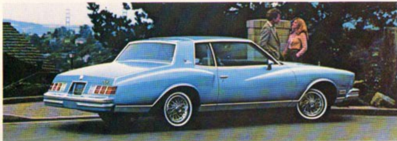
Monte Carlo Landau Coupe shown in light blue.

Monte Carlo is for people who enjoy a trim, modern, manageable mid-size car. And you can reflect your own good taste by personalizing Monte Carlo to your own liking. With Custom Two-Tone styling, the added beauty of the formal Landau roof, and more.