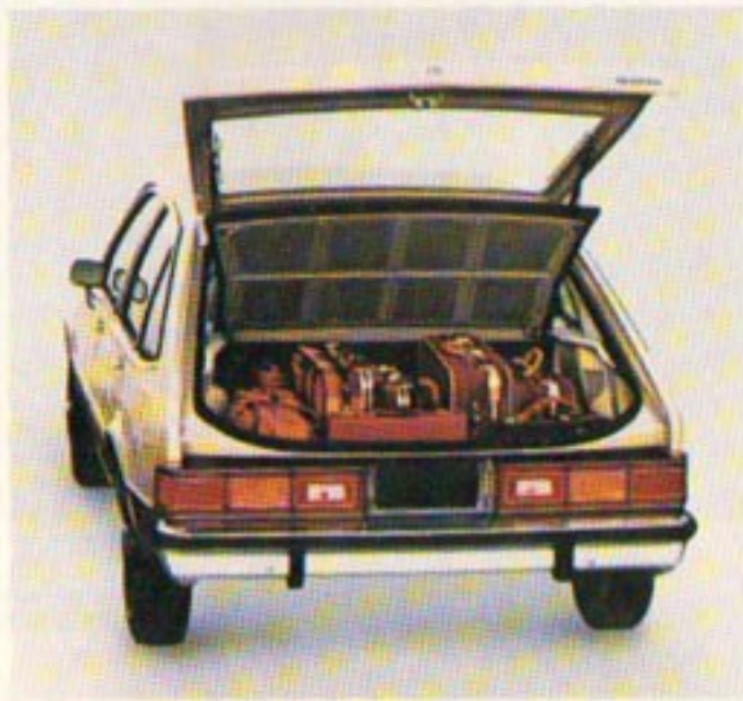
Mid-size roominess. Station wagon convenience.

All of which doesn't sound like a conventional compact car. And Citation isn't. It's a whole new kind of compact car. Available in a full line of models: 2-Door and 4-Door Hatchback, Club Coupe and Coupe. Or the fun-to-drive sporty X11-equipped coupes with sport-type suspension, white-lettered steel-belted radial ply tires, rear spoiler, body side striping, black grille and body accents, sport steering wheel, and more.