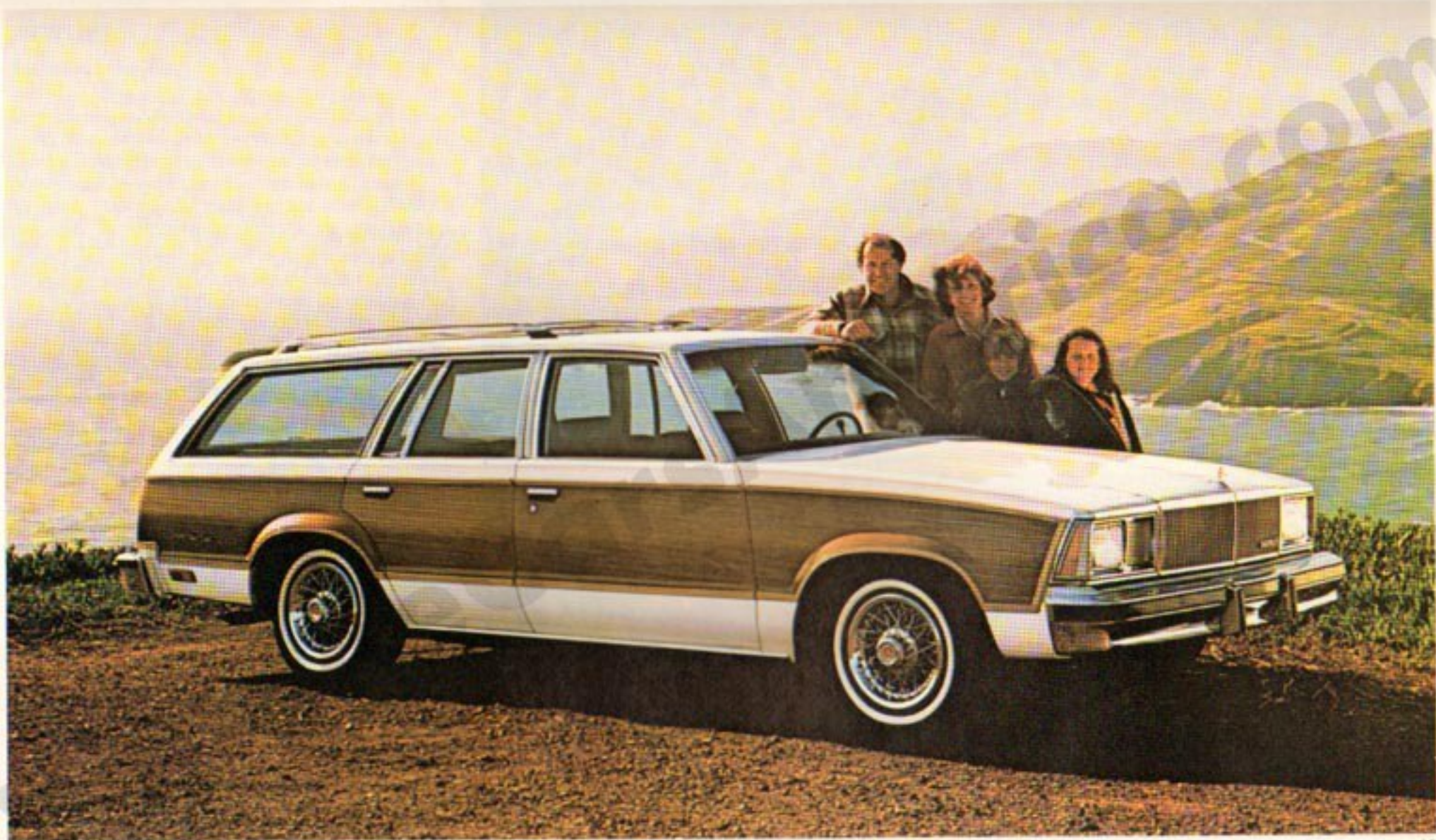
Malibu Classic Wagon shown in white.