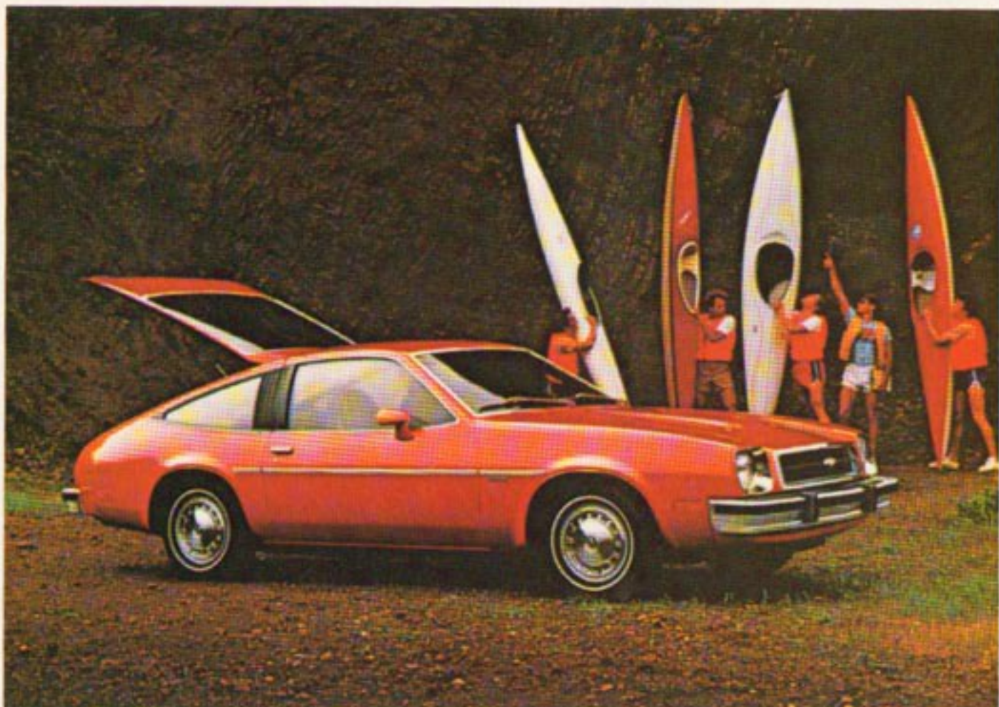
Monza 2+2 Hatchback Coupe shown in red.

tion with dual-unit rectangular headlights. The lower priced 2+2 Hatchback Coupe with a new blacked-out rectangular grille and single-unit headlights in squared bright frames.