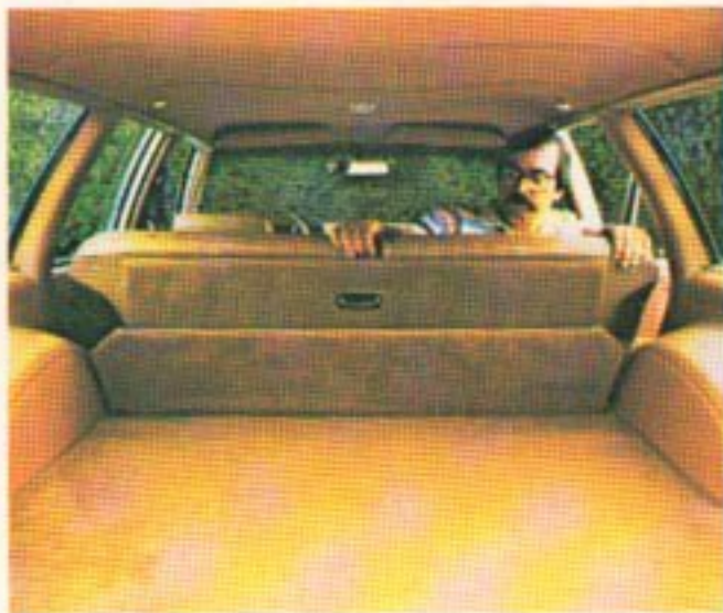
Roomy cargo area.