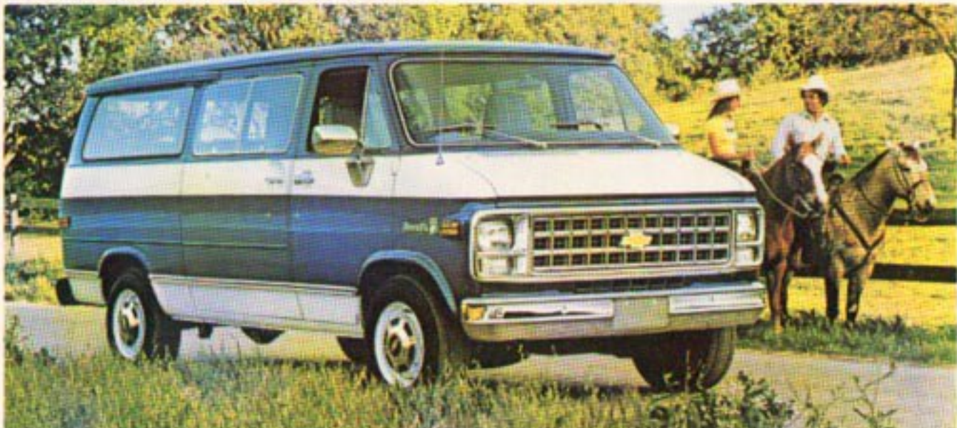
Chevy Sportvan shown in available Deluxe Two-Tone Nordic blue and white.

Chevy Sportvan is available in a broad range of sizes and capacities to fit most family and business applications. There's seating available for up to 12 depending on available equipment and model selected. Spacious vans are also available. Chevy Sportvan and Chevy Van are available in 110" or 125" wheelbase models with GVW ratings from 4900 up to 8600 lbs.