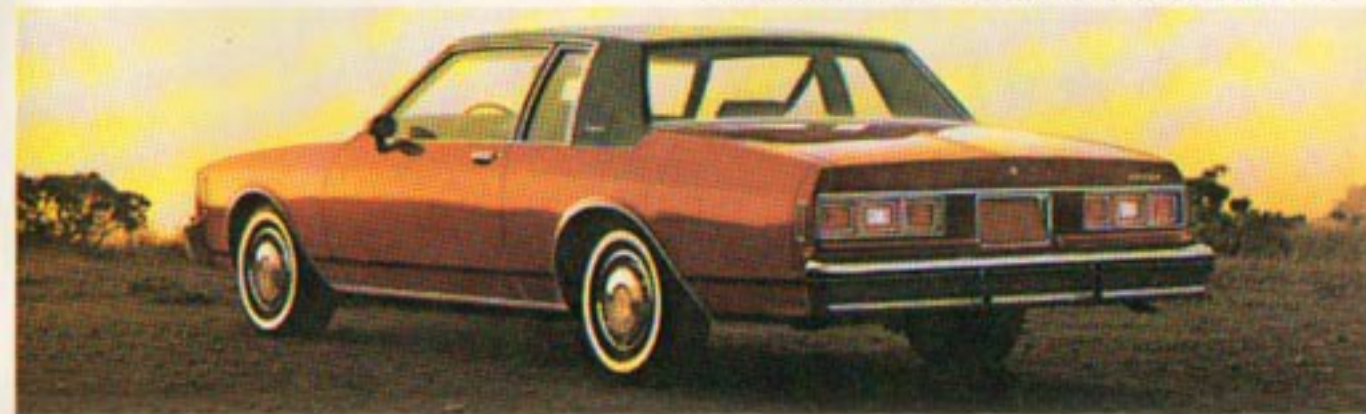
Impala Sport Coupe shown in cinnabar with available vinyl roof in black.

A WORD ABOUT THIS CATALOG. We have tried to make this catalog as comprehensive and factual as possible. And we hope you find it helpful. However, since the time of printing, some of the information you'll find here may have been updated. Also, some of the equipment illustrated or described throughout this catalog is available at extra cost. Your dealer has details and, before ordering, you should ask him to bring you up to date.