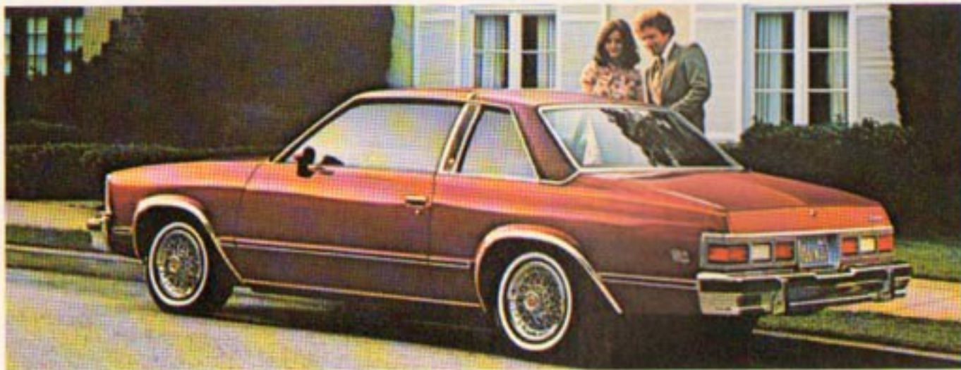
Malibu Classic Landau Coupe shown in dark claret.

least, due in part to Full Coil suspension with front stabilizer bar.