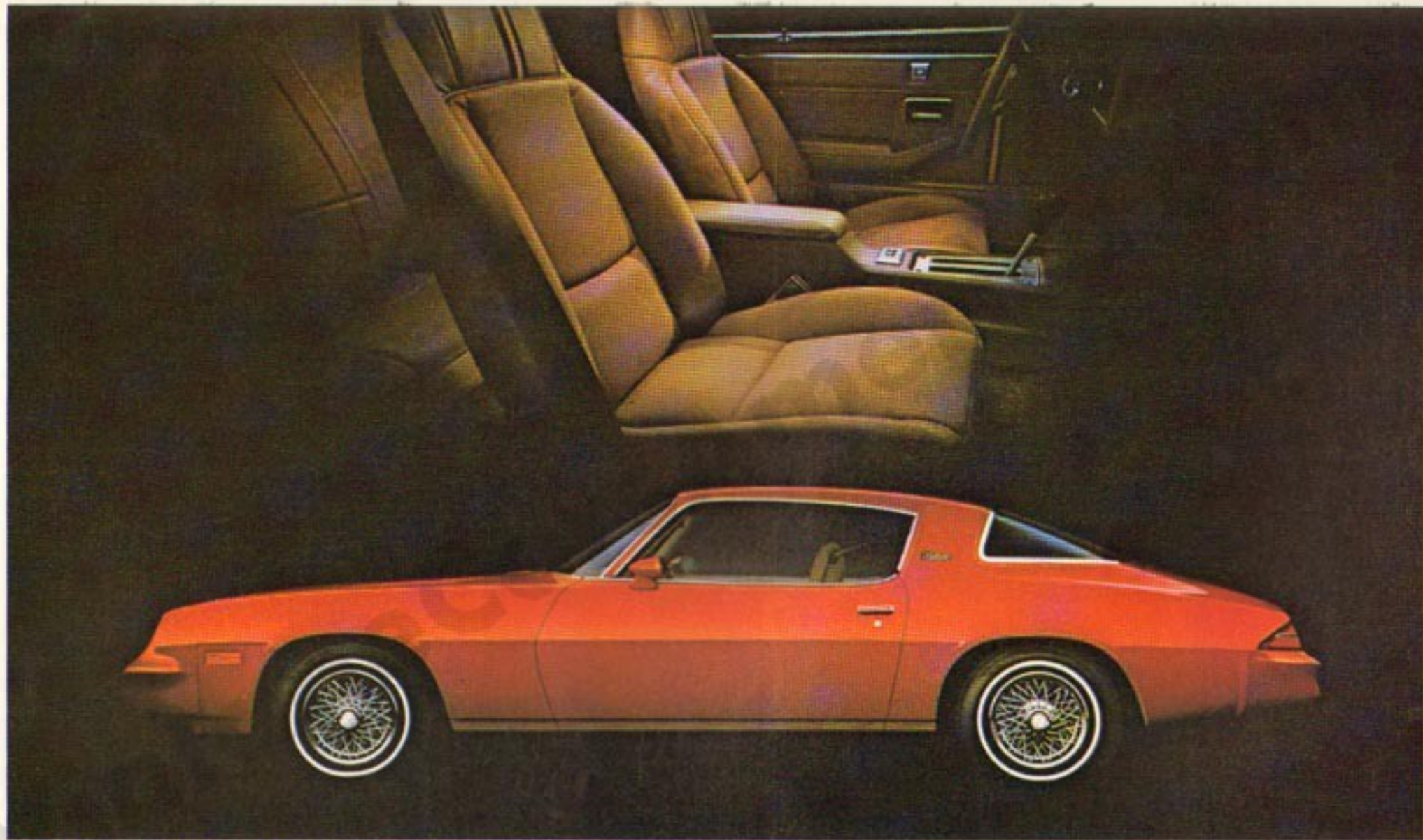
Camaro Berlinetta Coupe shown in red. Available Custom cloth interior shown in camel.