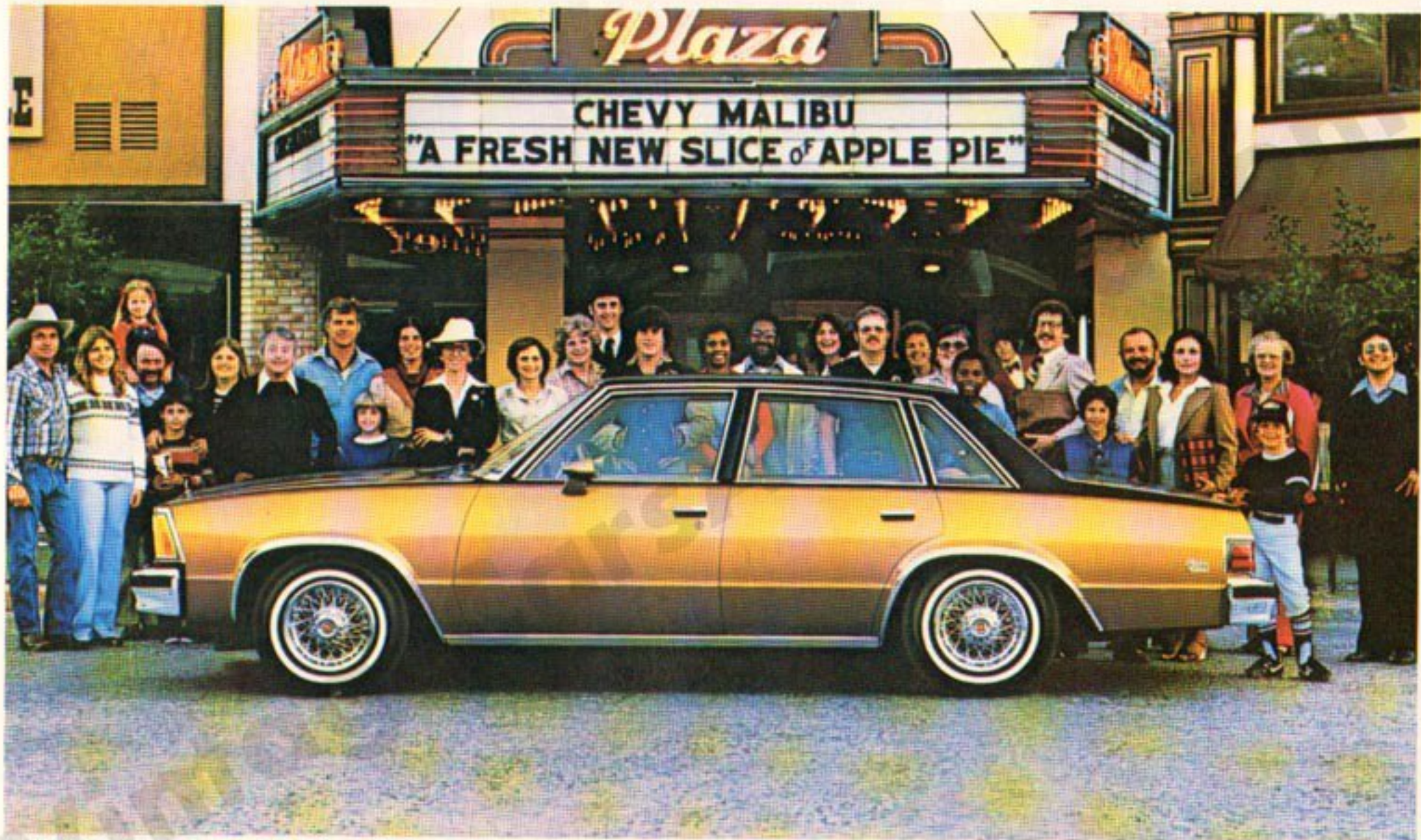
Malibu Classic Sedan shown in available Custom Two-Tone black and light camel.