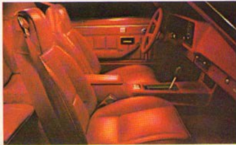
Available Camaro Custom interior shown in carmine.