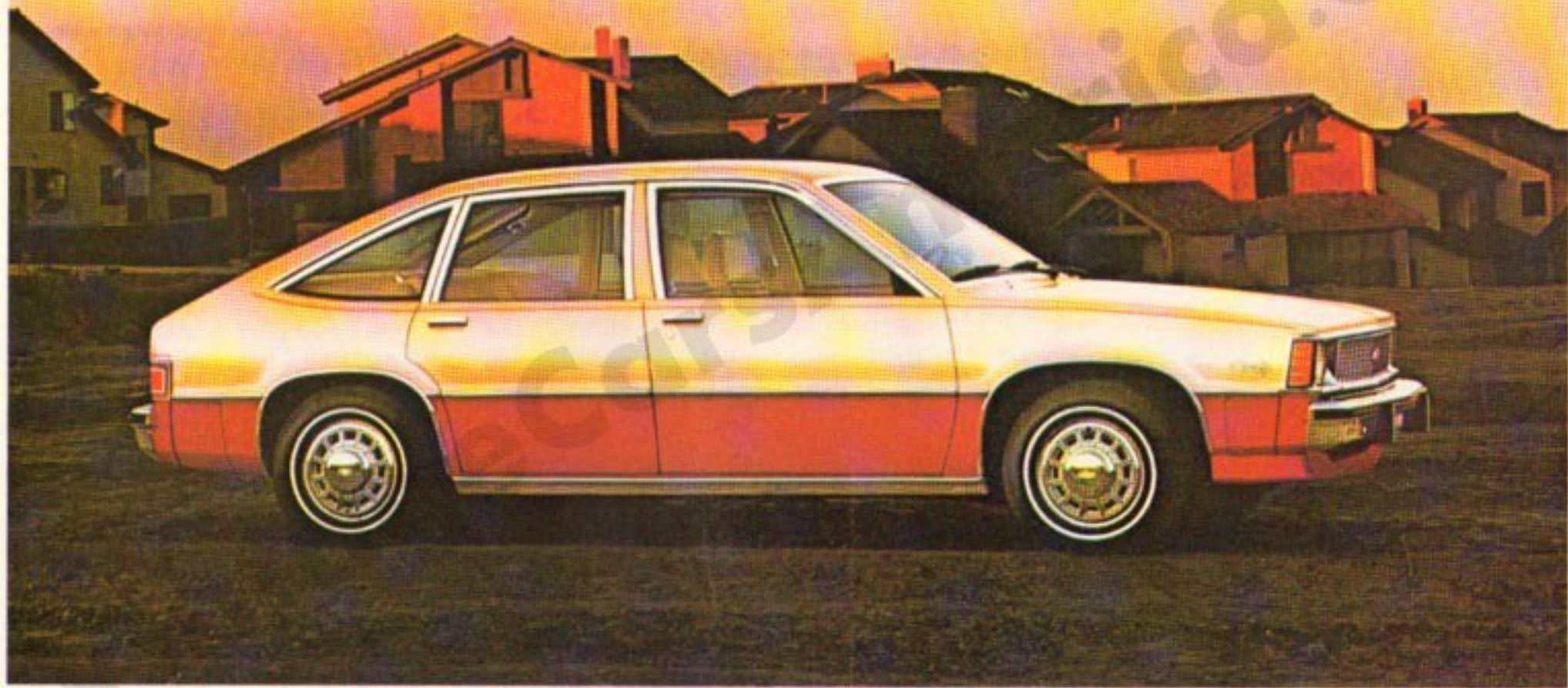
4-Door Hatchback Sedan shown in available Custom Two-Tone beige and cinnabar.