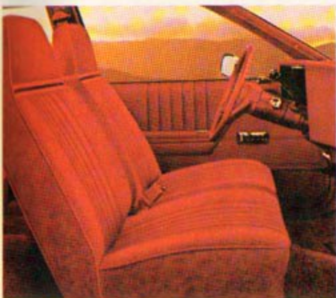
Available Custom cloth interior shown in carmine.

We put in the comfort of computer-selected coil springs and stabilizer bars front and rear for a firm yet satisfying feel of the road. And, thanks to efficient aerodynamics and a multitude of rubber-cushioned mountings on the powertrain cradle, you enjoy an isolation from wind and road noise.