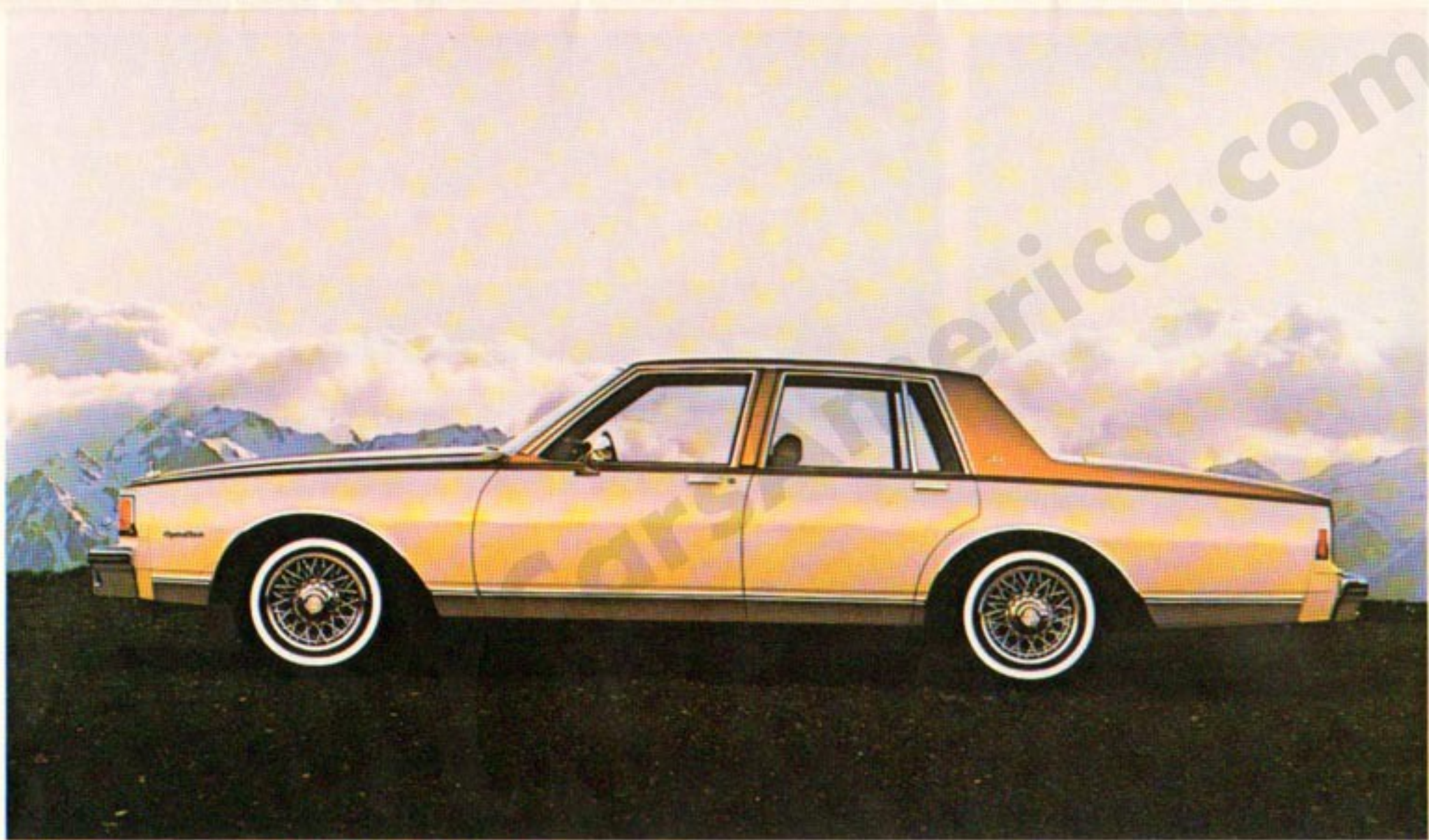
Caprice Classic Sedan shown in available Custom Two-Tone light camel and beige.