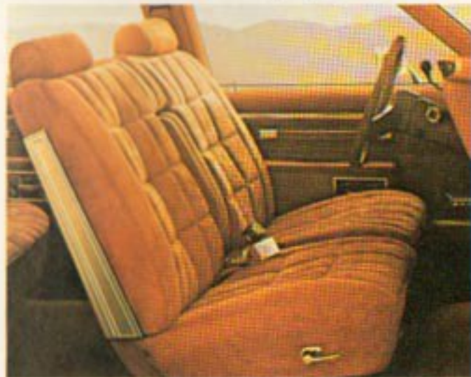
Caprice Classic Sedan available Special Custom interior shown in camel.

The Chevrolets in this catalog are shown with available equipment.