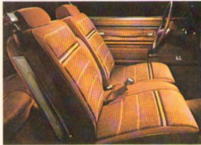
Available Special Custom interior shown in camel.