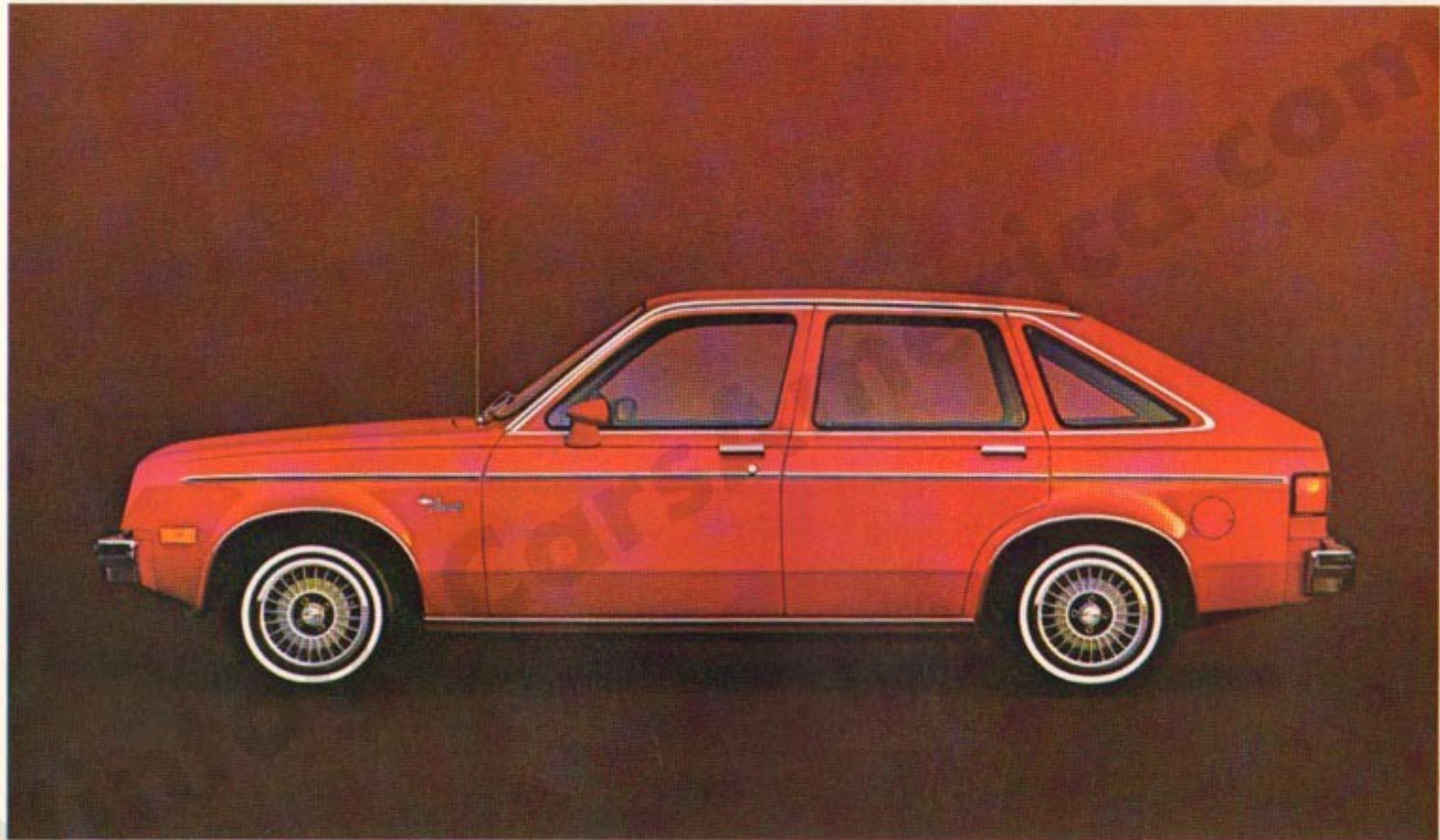
Chevette 4-Door Hatchback Sedan shown in red.