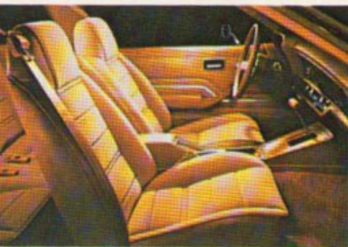
Available Monza Custom interior shown in camel.

That's because Monza is loaded with the kind of standard features that put an extra bit of enjoyment into your driving. Like a road-loving suspension to help smooth out bumps and take sway out of curves. Interior comfort with high-back front bucket seats, sport steering wheel, AM radio (may be deleted for credit), 4-speed manual transmission and center shift console (except Monza Coupe). And inside hatchback models, wagon-like convenience when you fold down the rear seat. Also standard: tinted glass, body side moldings, white-stripe tires, sporty wheel covers,