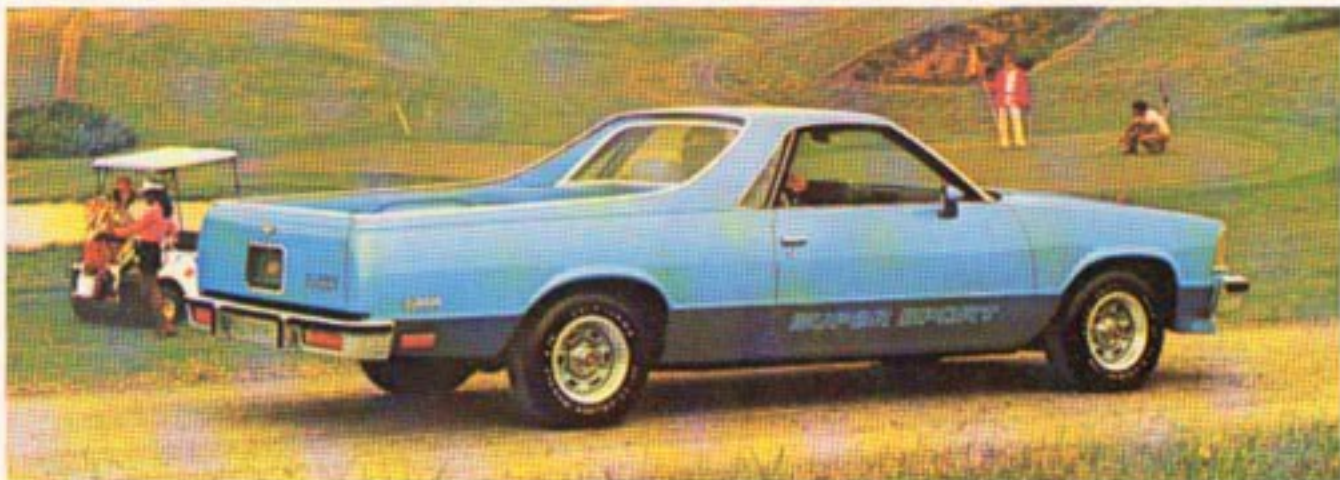
El Camino Super Sport shown in light blue and dark blue.

This beautifully appointed Chevy truck provides 35.5 cu. ft. of ribbed-steel cargo space, with gross payloads up to 1250 lbs. including cargo and passengers. A new 3.8 Liter (229 Cu. In.) V6 engine is standard. A 231-Cu.-In. V6 is standard in California. And V8 power is available. 3-speed, 4-speed and automatic transmissions are available depending upon the engine specified. Manual transmissions are not available in California. Air-adjustable rear shocks are standard.