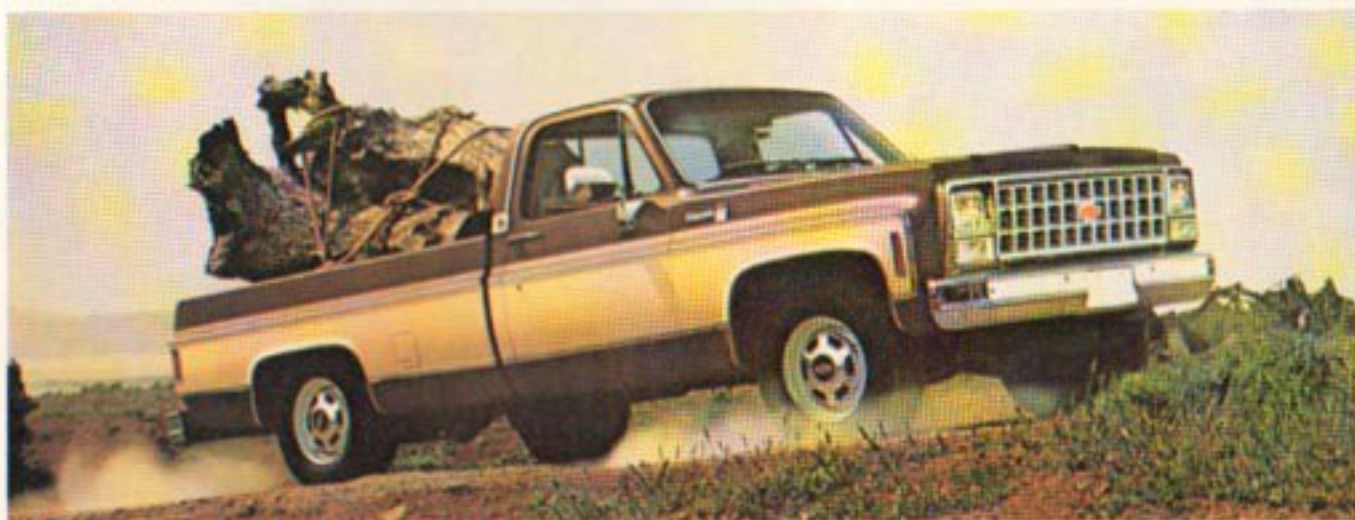
Chevy C20 Fleetside Pickup shown in available Special Two-Tone dark camel and Santa Fe tan.