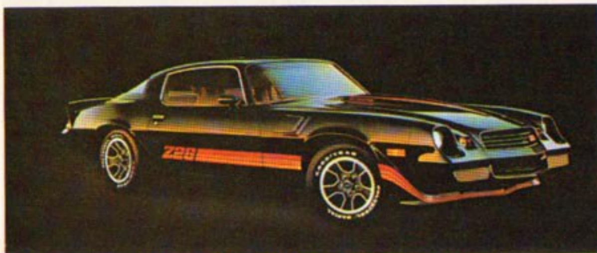
Camaro Z28 shown in black. Available white-lettered tires supplied by various manufacturers.

Sport Coupe. For those who love the pure pleasure of driving. Everything is there. From standards like the plush interior with full foam bucket seats and cut-pile carpeting to the new 3.8 Liter (229 Cu. In.) V6* and road-balanced suspension with front stabilizer bar, power steering and steel-belted radial ply tires.