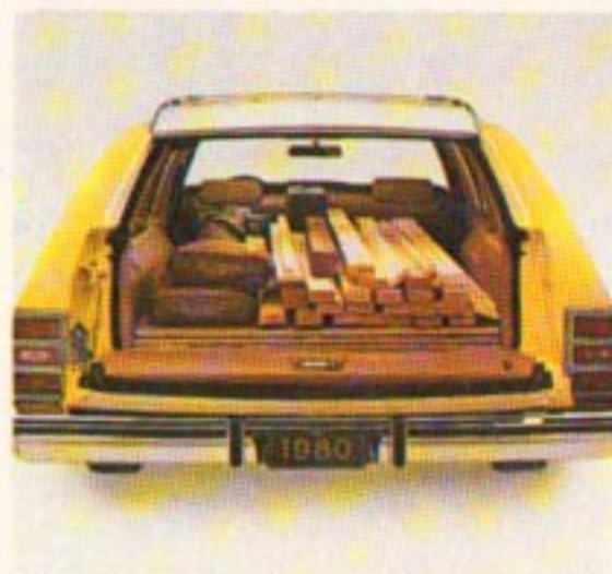
87-cu.-ft. capacity with rear seat down.