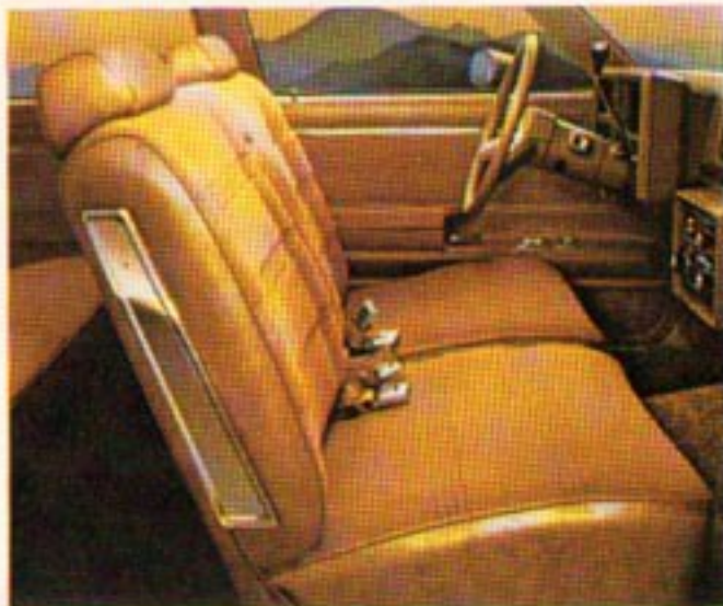
Available Malibu Classic interior shown in camel.

And there's the ride. Impressive, to say the