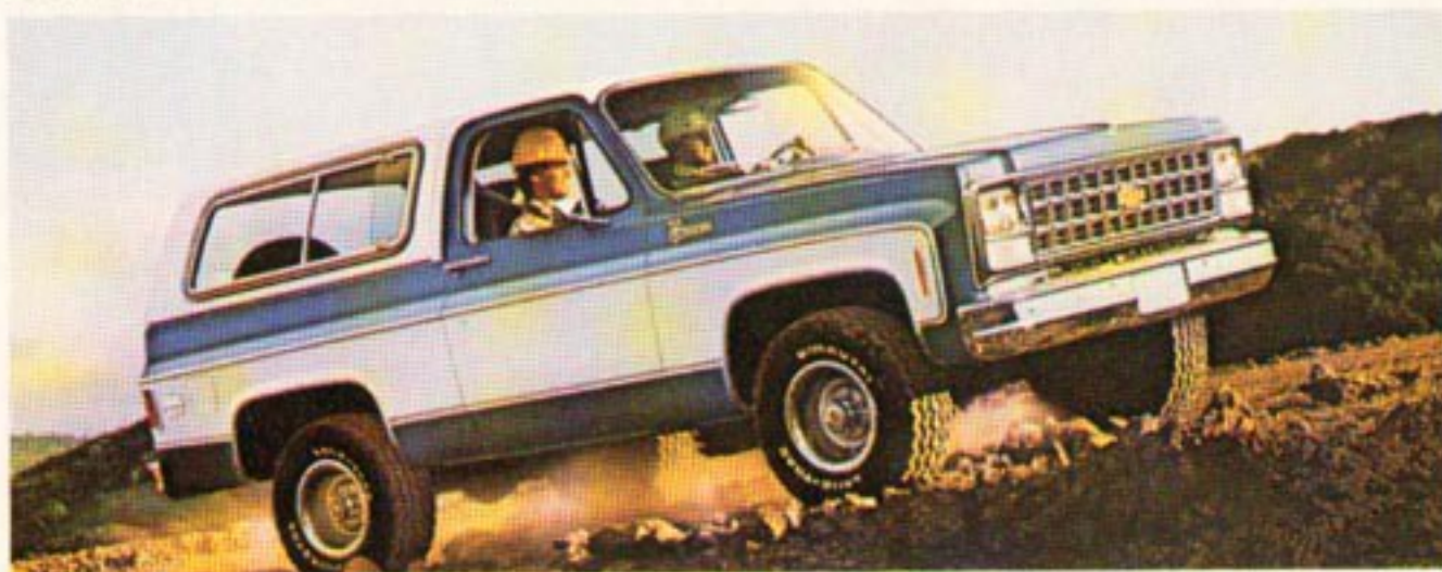
4-wheel-drive Blazer shown in available Special Two-Tone Nordic blue and white. Available white-lettered tires supplied by various manufacturers.

When the terrain gets rugged or hilly, Blazer with available 4-wheel drive delivers the added traction you need to get through. The conventional 4-wheel-drive system with manual locking front hubs is available with either 3-speed manual (not available in California), 4-speed manual or automatic transmissions. With this system, front freewheeling hubs allow you to switch from freewheeling to front lock position when moving off-road. All Blazers have a steel front half top and full doors. The rear seating or cargo area is enclosed by a removable fiberglass-reinforced plastic top. A Blazer Convertible model is available and Blazer can be ordered as a 2-wheel-drive model if preferred.