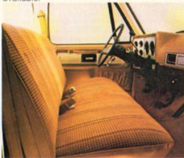
Available Silverado interior shown in camel tan.