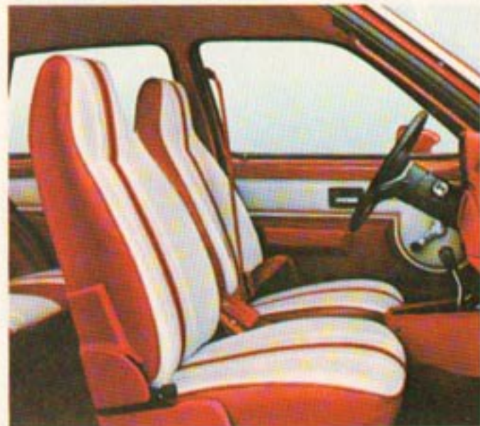
Available Chevette Custom Cloth interior shown in red/oyster.

There are new styling refinements for 1980. Wraparound taillights and distinctively sloped hatchback. We've also made Chevette's long list of standard features even longer. Front and rear