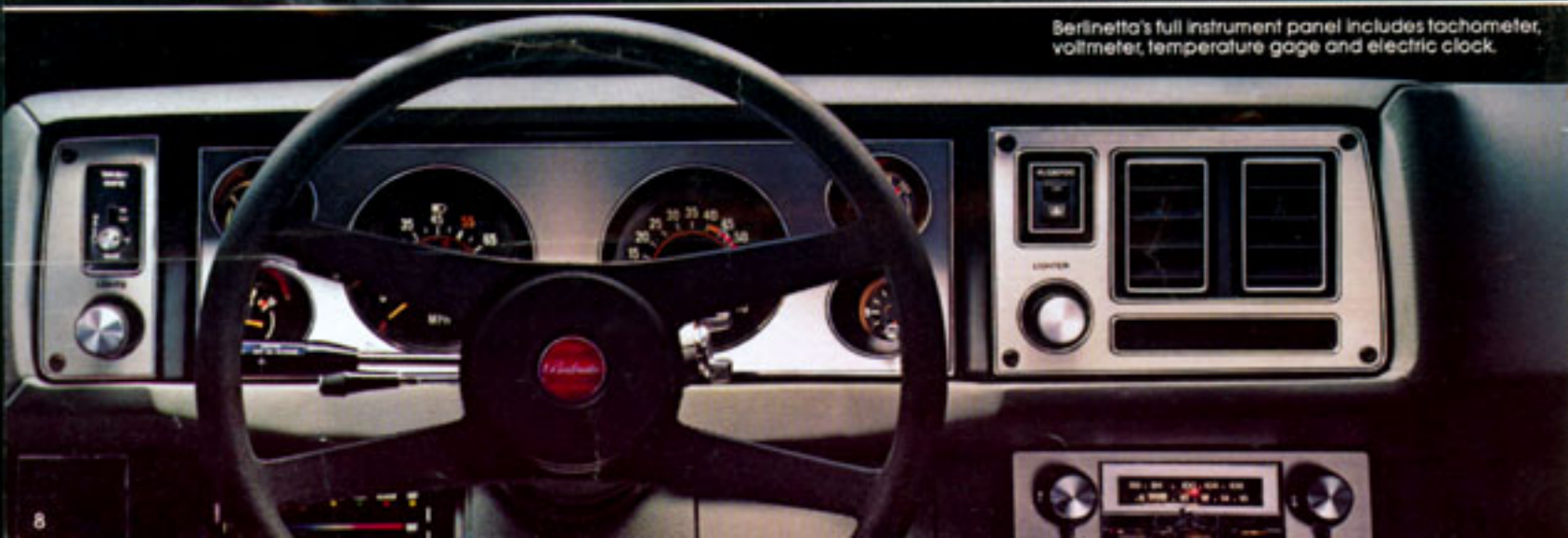
Berlinetta's full instrument panel includes tachometer, voltmeter, temperature gage and electric clock.