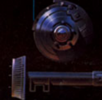
REAR FRONT DRUM BRAKES (VENTED)