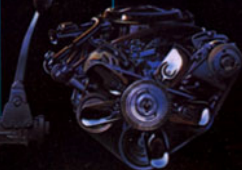
OPTIONAL 5.7 LITER 4-VALVE V8 ENGINE (WITH ALCO BOMBS ONLY)