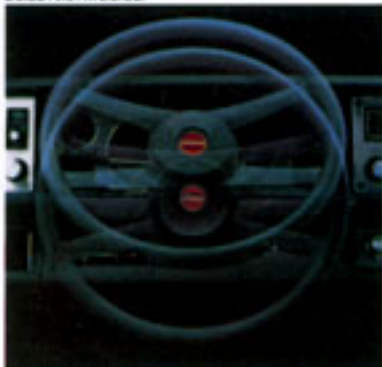
Tilt steering wheel.