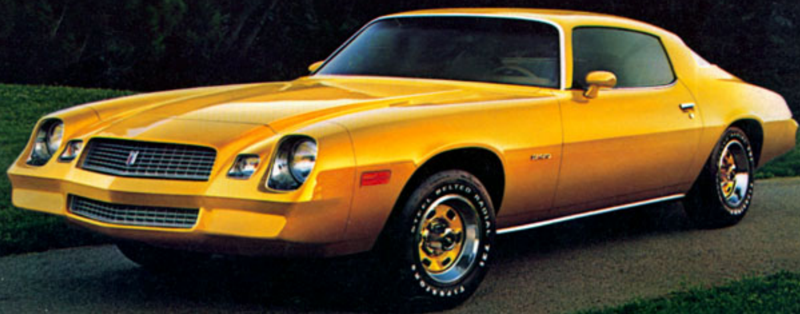
Camaro Sport Coupe.