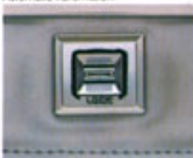
Power door locks.