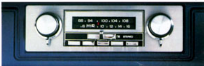
Delco AM/FM stereo.

3.42:1 first gear four-speed transmission (with 5.0 Liter V8 only; std. Z28) • Wheel cover locking package (Berlinetta with wire wheel covers) • Halogen headlamps (high and low-beam) • Automatic transmission with fuel-efficient torque converter clutch.