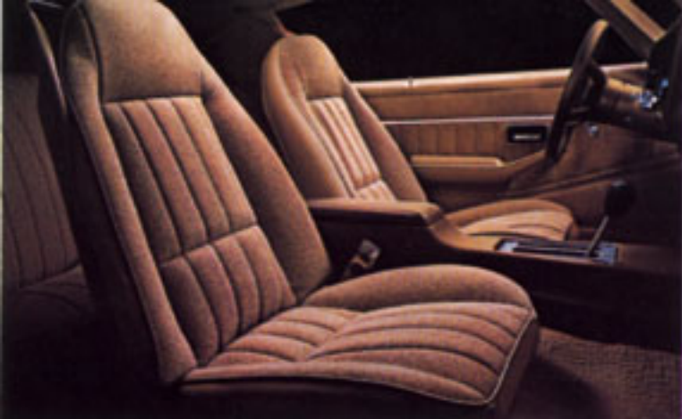
Standard Sport Coupe interior with optional cloth.