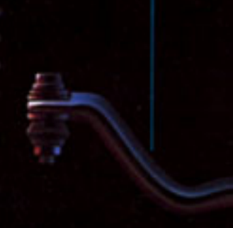
LARGER FRONT AND REAR STABILIZER BARS