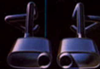
DUAL REVOLVING/ TAIL PIPES