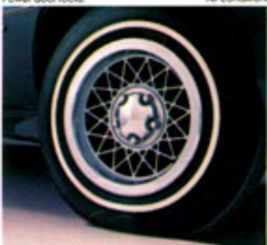
Custom styled wheel (Sport Coupe only).