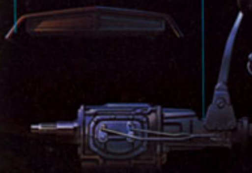
FOUR-SPEED MANUAL TRANSMISSION