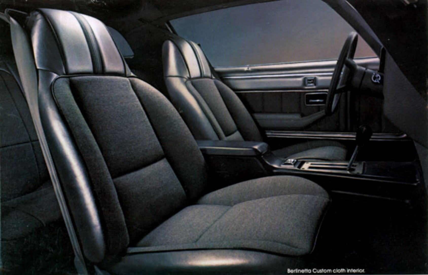
Berlinetta Custom cloth interior.