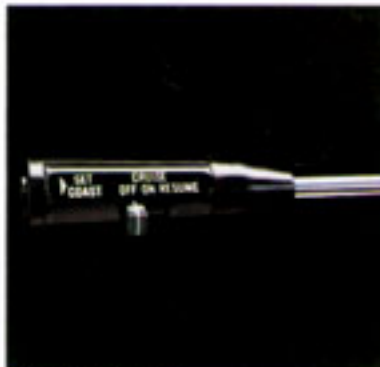
Automatic speed control.