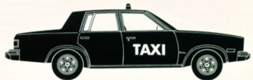
4-DOOR SEDAN 1GW69

Malibu is the mid-size with the spacious interior room and trunk capacity that prove very popular for urban police work and taxi use. Ease of maneuvering in city traffic, and into tight places is due to its smart size, power steering, and power brakes. For 1983, Malibu standard features include automatic