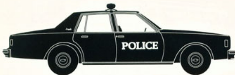
4-DOOR SEDAN 1BL69