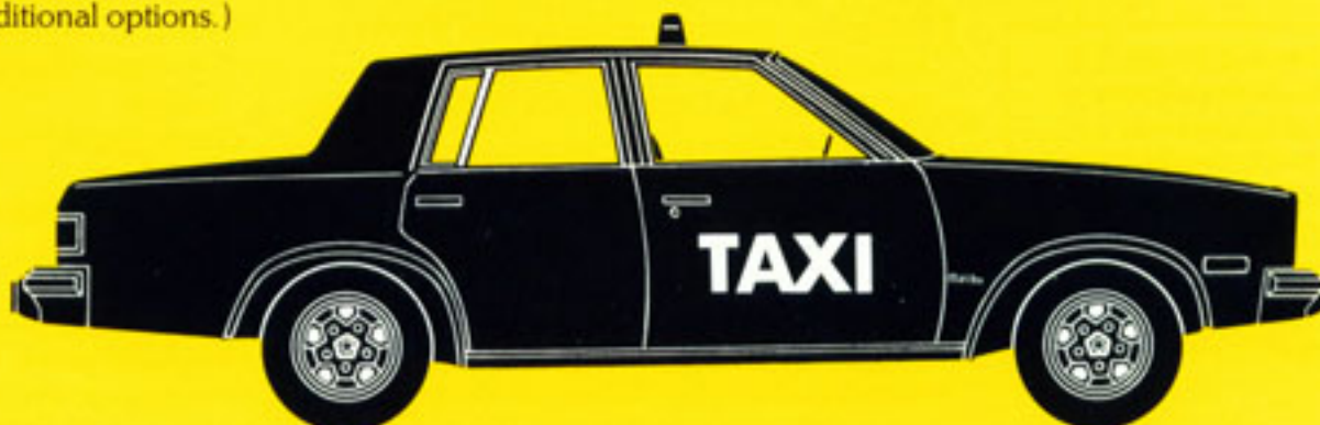
4-DOOR SEDAN 1GW69

This catalog should not be used for ordering purposes. Rather it is intended as a source of advance information for planning future vehicle fleet needs. For further details, contact your local Chevrolet dealer or the Chevrolet Zone Office covering your area.