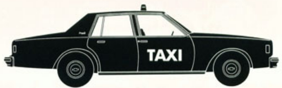
4-DOOR SEDAN 1BL69

Impala continues to be the full-size value for which it's been famous these past 24 years. Impala is equipped with Computer Command Control, an on-board computer that monitors engine functions and fine-tunes the engine's performance under all normal operating conditions—continuously—as you