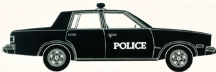
4-DOOR SEDAN 1GW69