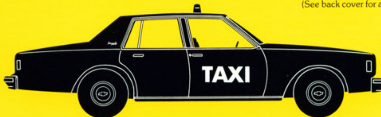
4-DOOR SEDAN 1BL69