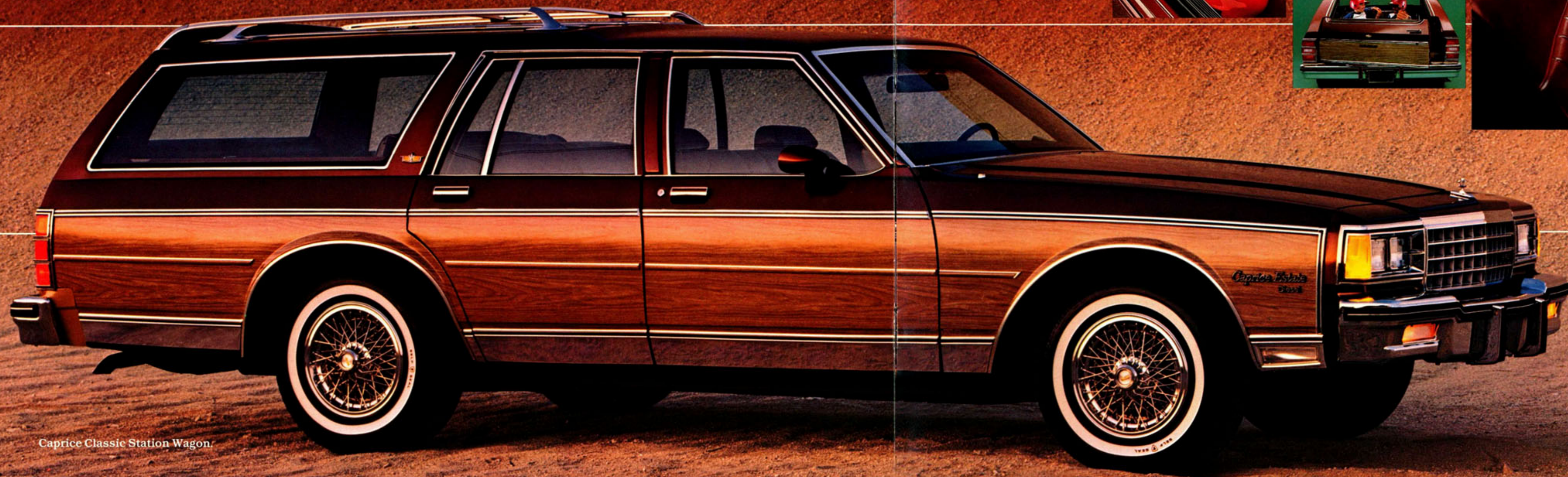
Caprice Classic Station Wagon