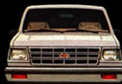
S-10 Blazer (100.5" W.B.) 4-Passenger Seating Available