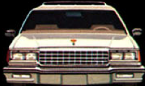
Caprice Classic Station Wagon (116.0" W.B.) 8-Passenger