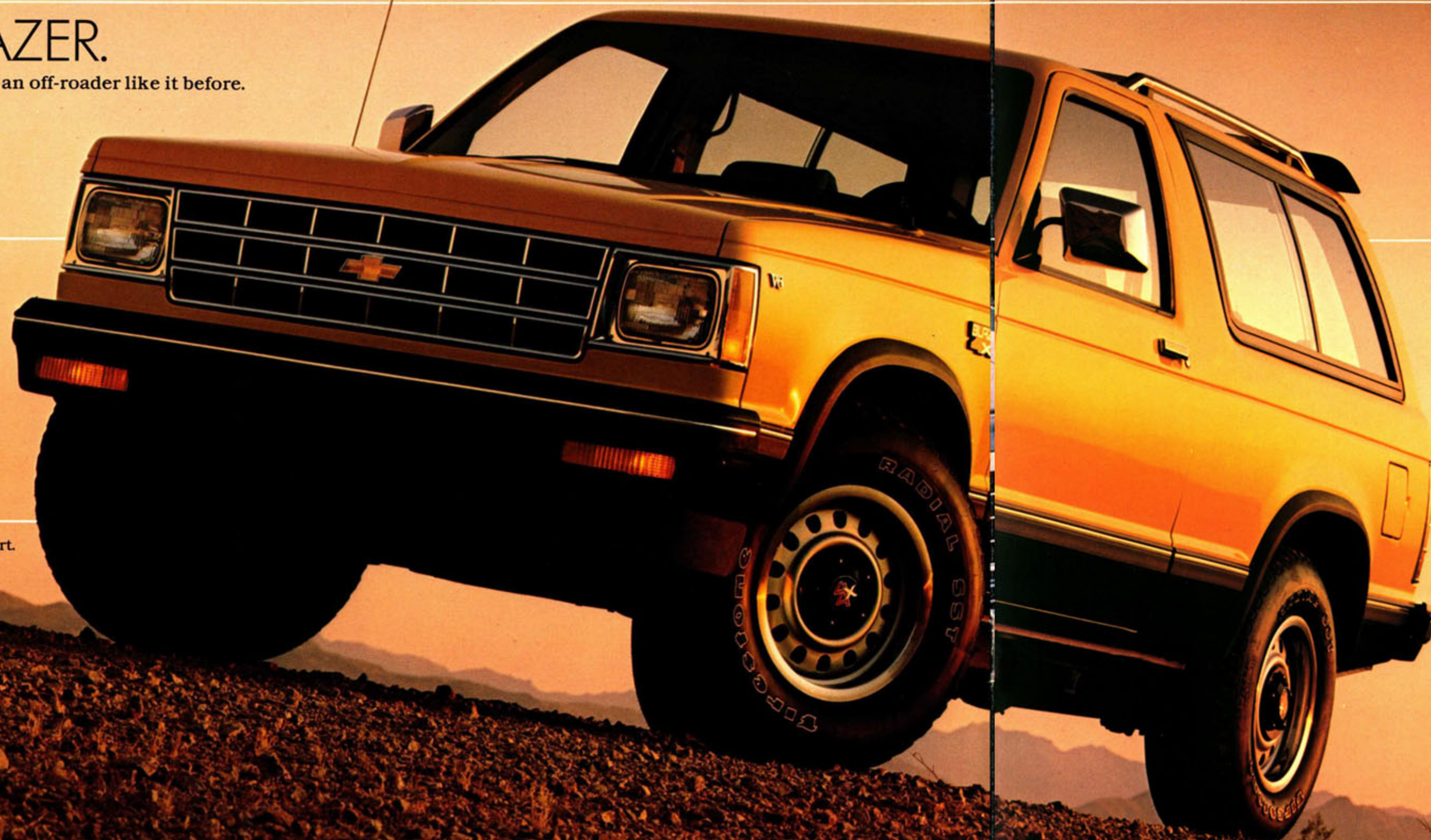
4x4 Chevy S-10 Blazer Sport.

There's never been an off-roader like it before.