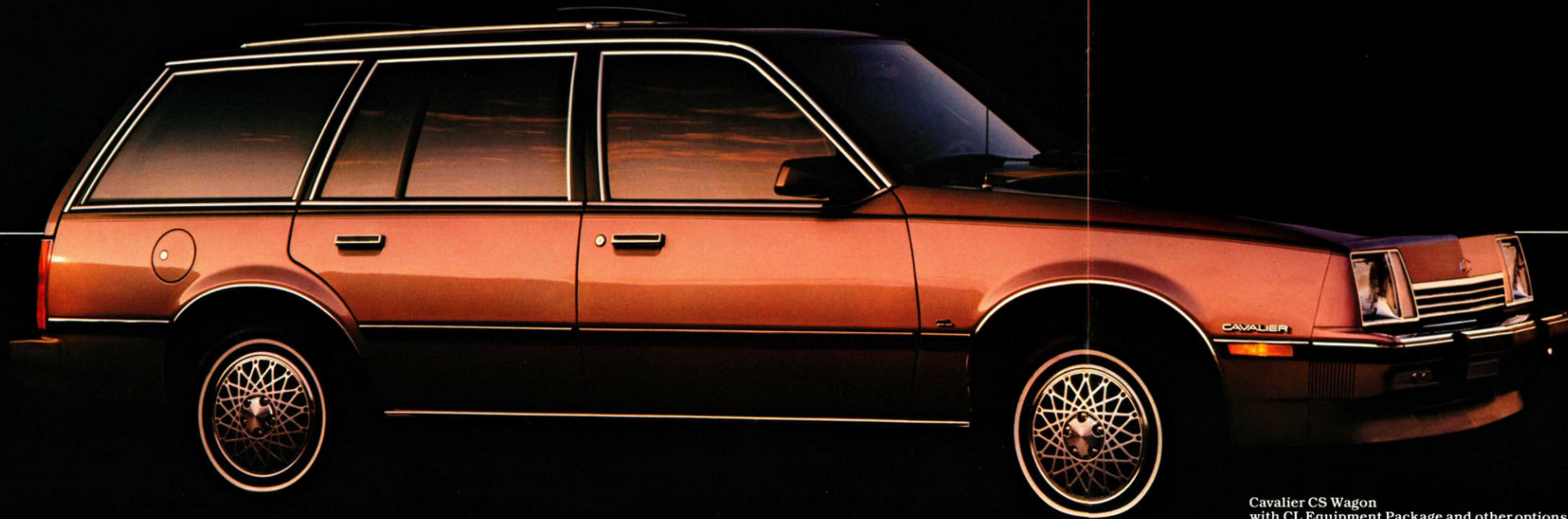
Cavalier CS Wagon with CL Equipment Package and other options.