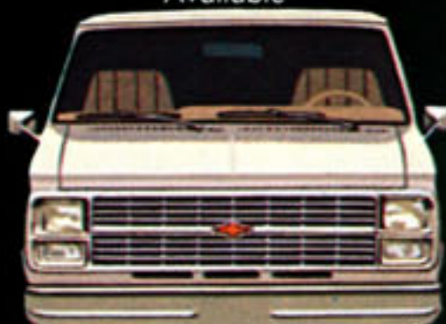
G30 Sportvan (125.0" W.B.) 12-Passenger Seating Available