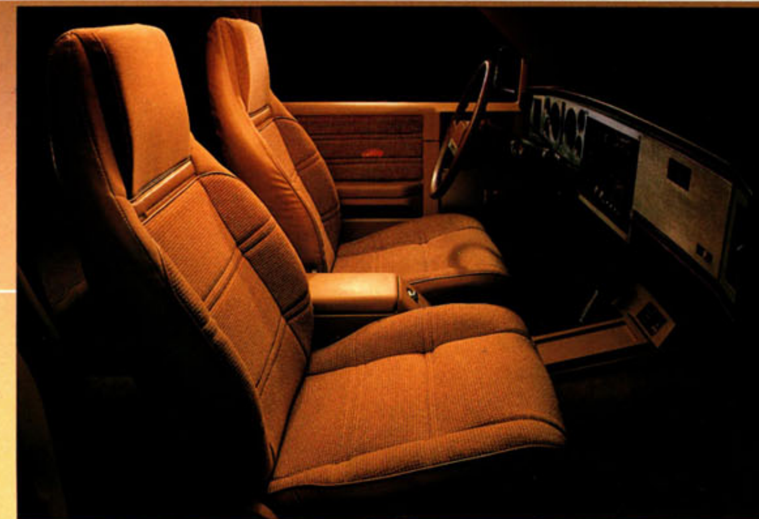
Optional Chevy S-10 Blazer Tahoe interior.