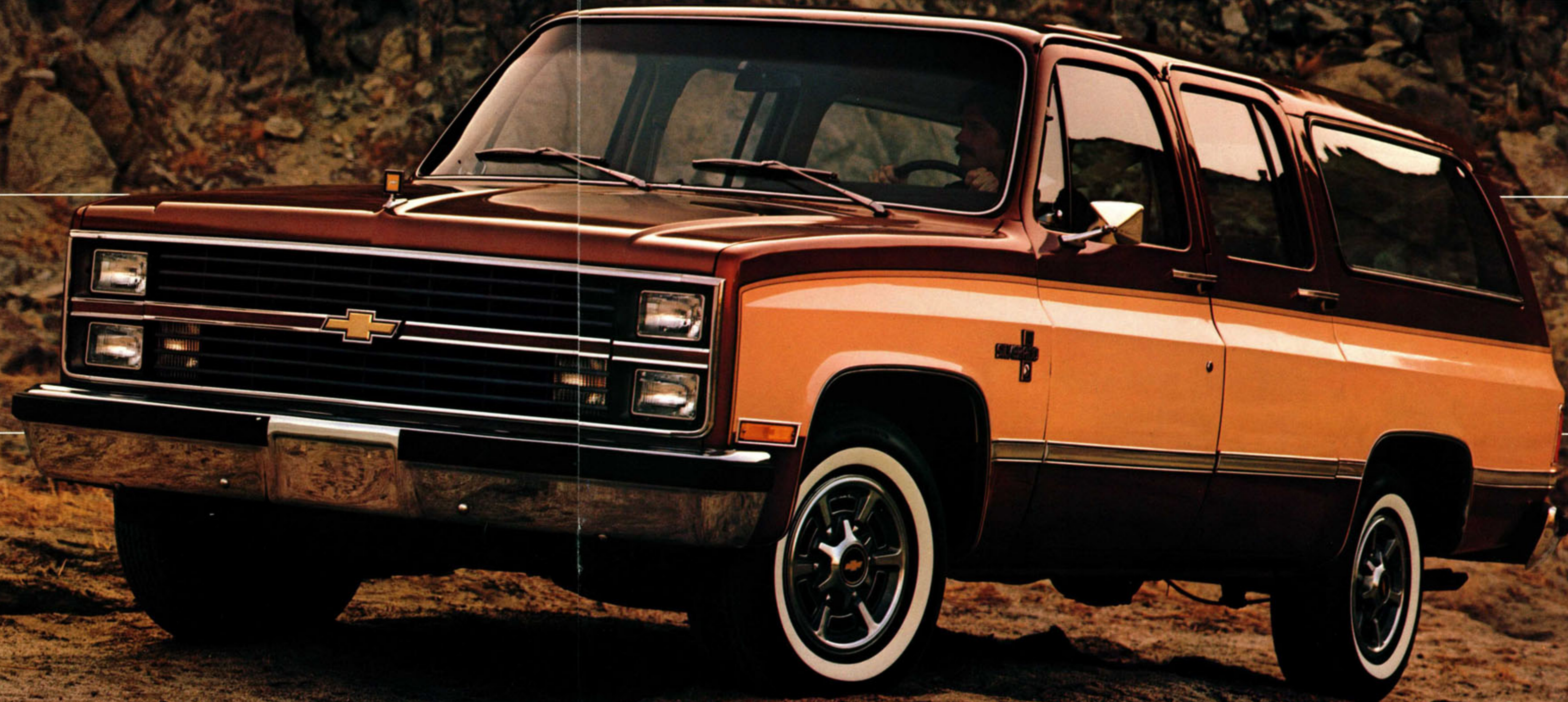
C20 Suburban Silverado.