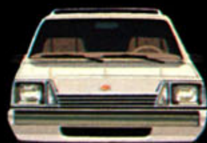
Cavalier Station Wagon (101.2" W.B.) 5-Passenger