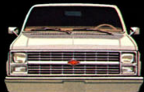
C10 Suburban Panel Doors (129.5" W.B.) 9-Passenger Seating Available