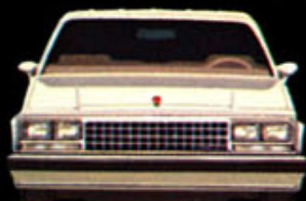
Malibu Station Wagon (108.1" W.B.) 6-Passenger