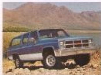
4-WD High Sierra Suburban shown with available equipment

Ready to go...road or no road. If you want a tough hauler for rough country, consider one of our Suburban 4-wheel-drive models. These ground-gripping GMCs have the muscle to carry big loads of passengers and cargo to out-of-the-way workites or vacation hide-aways. Plus, they feature one of the most advanced 4-WD systems on the road — or off.