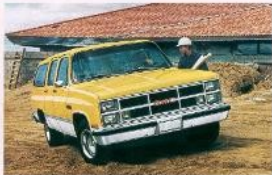
24WD Sierra Classic Suburban with available equipment

selections. Matching second and third rear bench seats are available. High Sierra trim includes a full-length insulated headliner, front and rear dome lamps, color-keyed rubber floor mats and carpet-type spare tire cover.