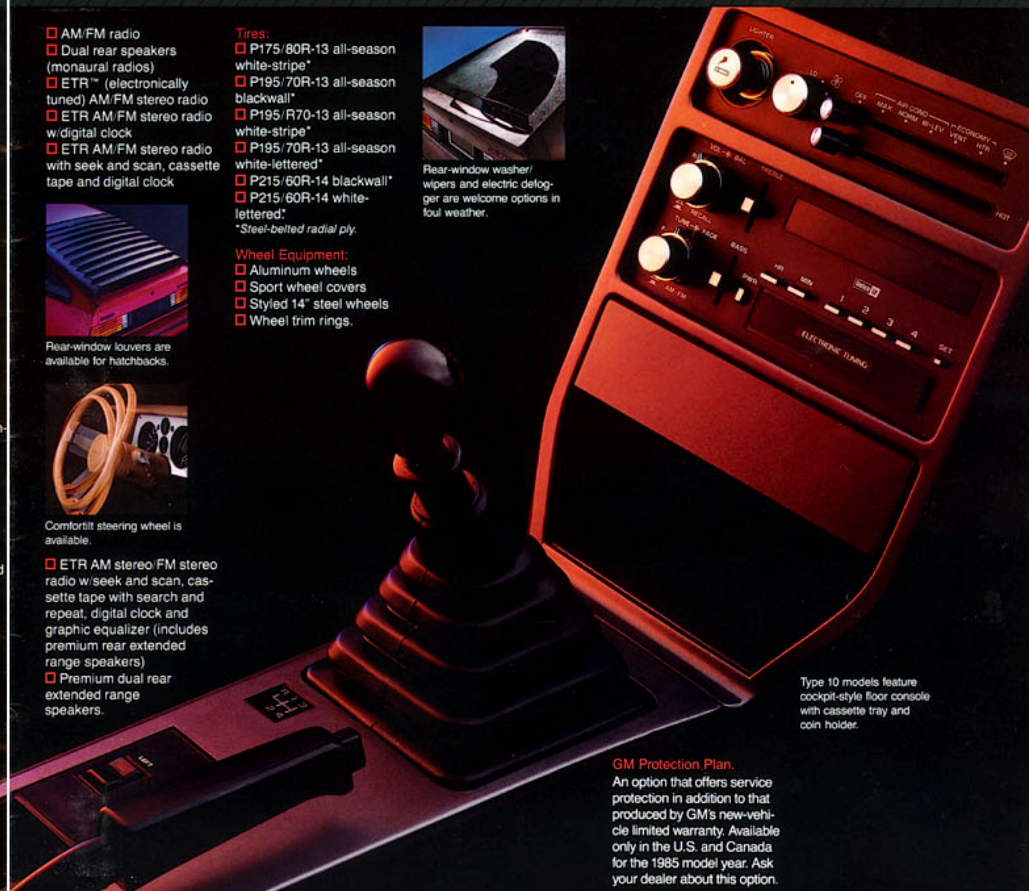
Type 10 models feature cockpit-style floor console with cassette tray and coin holder.