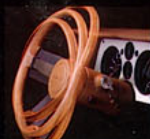
Comfortilt steering wheel is available.

ETR AM stereo/FM stereo radio w/seek and scan, cassette tape with search and repeat, digital clock and graphic equalizer (includes premium rear extended range speakers) Premium dual rear extended range speakers.