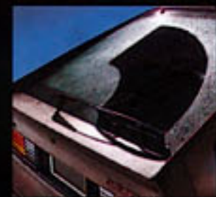
Rear-window washer/wipers and electric defogger are welcome options in foul weather.

Wheel Equipment: Aluminum wheels Sport wheel covers Styled 14" steel wheels Wheel trim rings.