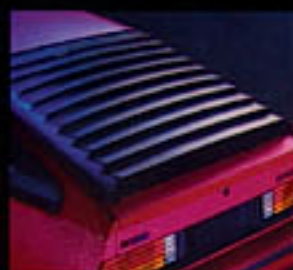
Rear-window louvers are available for hatchbacks.

AM/FM radio Dual rear speakers (monaural radios) ETR™ (electronically tuned) AM/FM stereo radio ETR AM/FM stereo radio w/digital clock ETR AM/FM stereo radio with seek and scan, cassette tape and digital clock