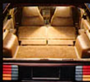
Hatchbacks feature up to 43.3 cubic feet of cargo space.

Optional Equipment Appearance and Protection CL Custom Interior and Equipment Package (available CS and Type 10 models) includes Custom