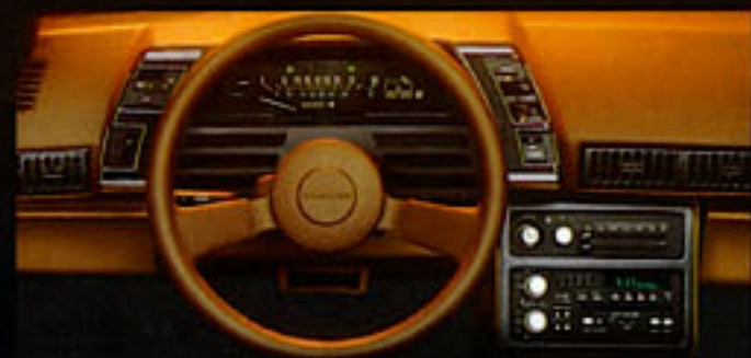
Type 10 models feature new cockpit design with full console.

Interior with Custom reclining seats and adjustable head restraints, color-keyed Sport steering wheel, split-folding rear seat on hatchback and wagon, and Quiet Sound Group Body pin striping Bumper guards Custom Two-Tone paint (CS and Type 10 models only; includes pin striping on CS) Electric rear window defogger Floor mats, front and/or rear with carpeted inserts