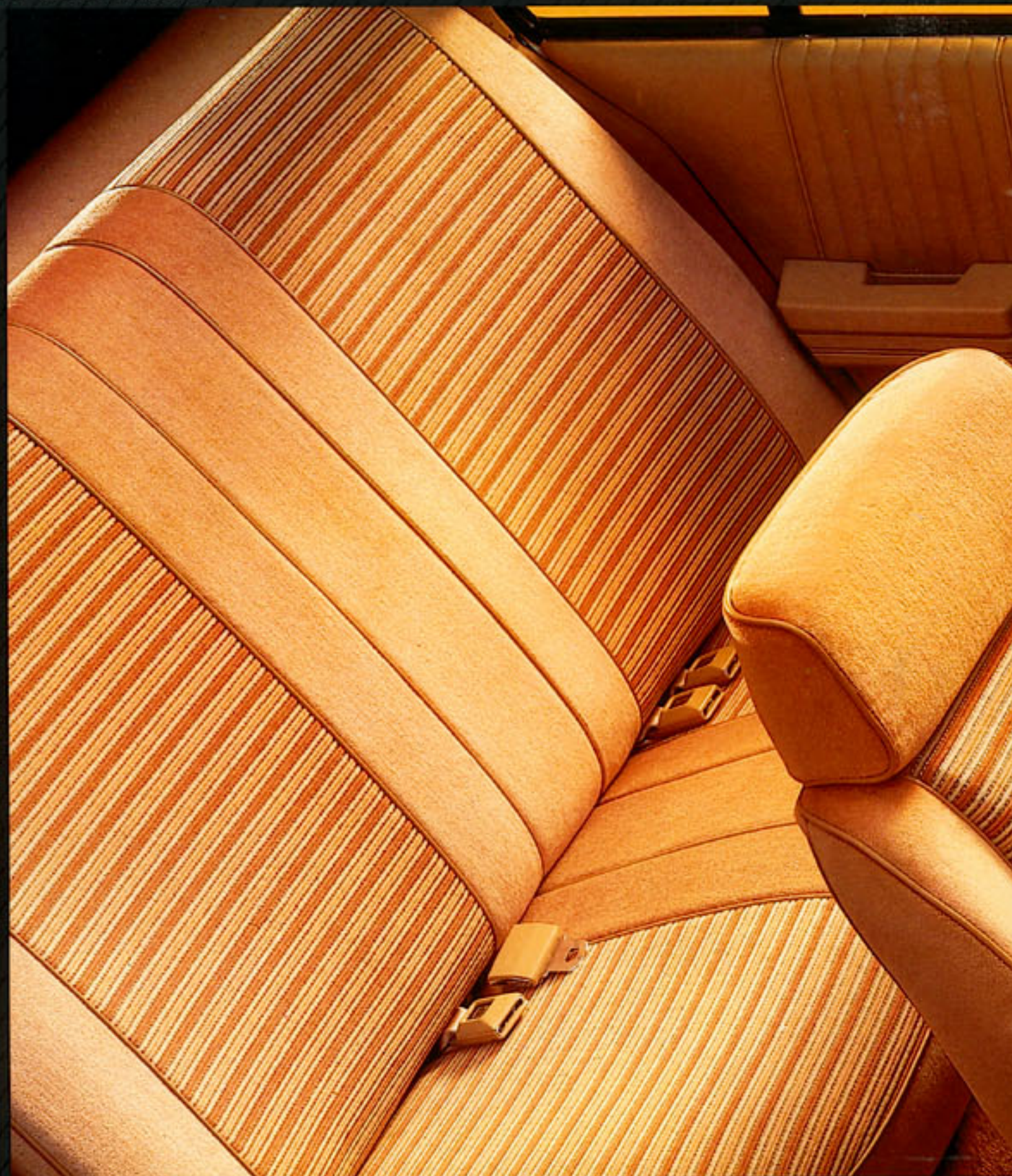
Cavalier Sedan with CL Custom Interior.

In today's wonderfully competitive market, many cars feel good in a quick test drive around the block. But 10 miles out on the open road you begin to appreciate just how much like a fine driving glove Cavalier fits you.