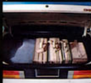
Cavalier Sedans and Coupe accommodate over 13 cubic feet of luggage.