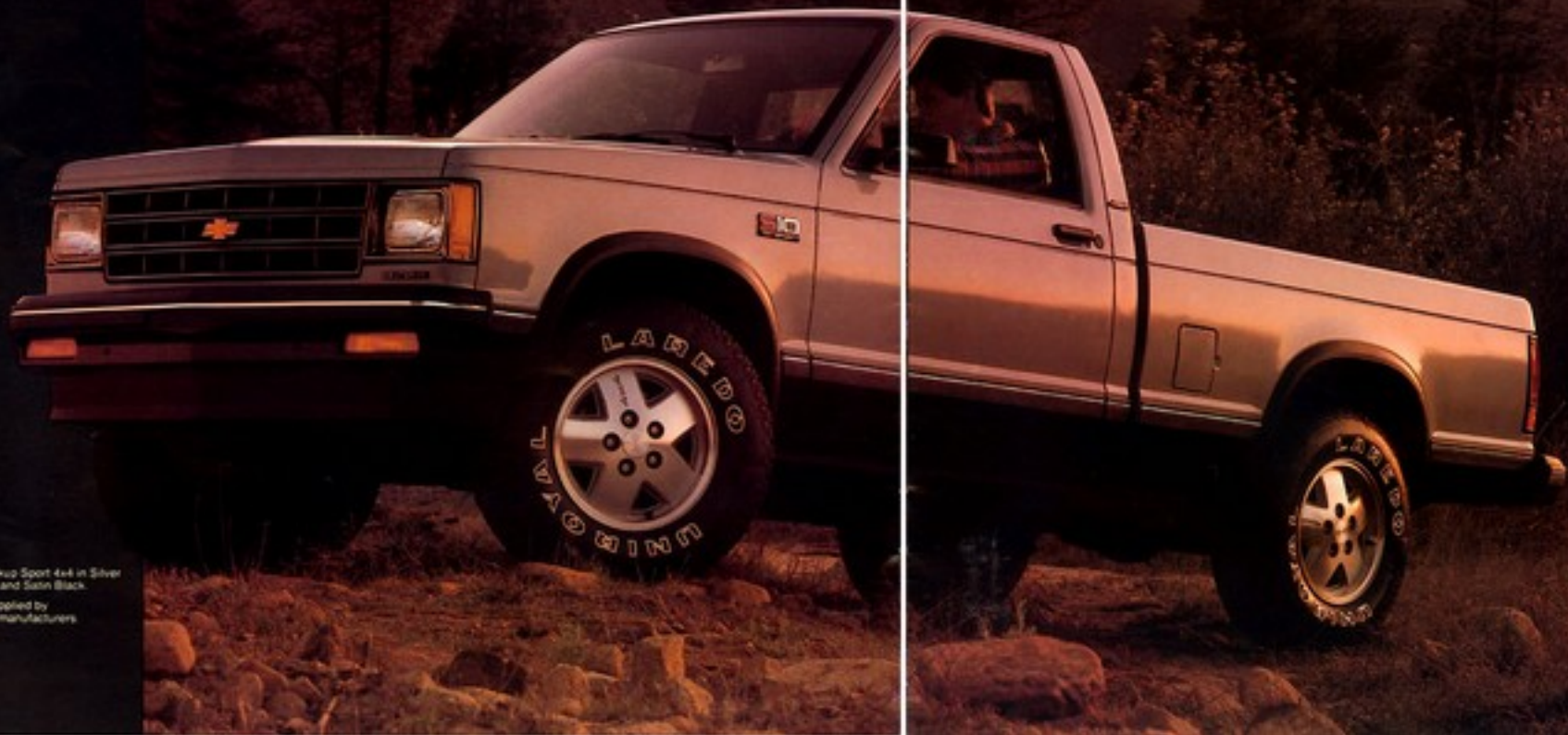
S-10 Pickup Sport 4x4 in Silver Metallic and Satin Black.

after off-road mile. S-10 4x4. The action-traction machine that's just plain fun to drive. S-10 Pickup 4x4 Special Two-Tone in Octane Blue Metallic and Silver Metallic. Shown with snowplow available from independent supplier.