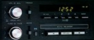
GM-Delco AM/FM stereo radio with cassette deck