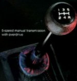
5-speed manual transmission with overdrive