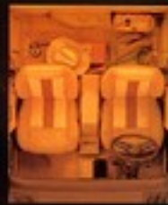
S-10 Maxi-Cab Sport interior in Saddle Tan with available front buckets and rear jump seats.

Up front, passengers can enjoy the comfort of optional full-foam, high-back bucket seats, available with a reclining feature. The passenger seat even slides forward, then uses "memory" to return to its preset position, allowing easy access to the rear.