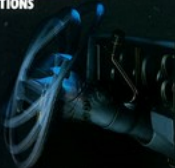
Comfortilt steering wheel