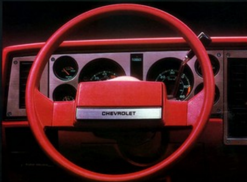
Tahoe instrument panel.

up to five functions, including available Speed Control. Conveniently placed comfort controls are on your right. Below in 4x4 models is the Insta-Trac console, a lighted diagram that displays