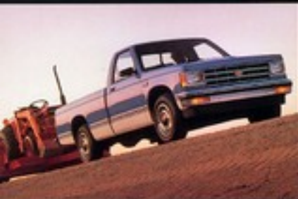
5-10 Durango Pickup Sport Two-Tone in Light Blue and Frost White.

*See the wall poster at your Chevy dealer's for EPA ratings.