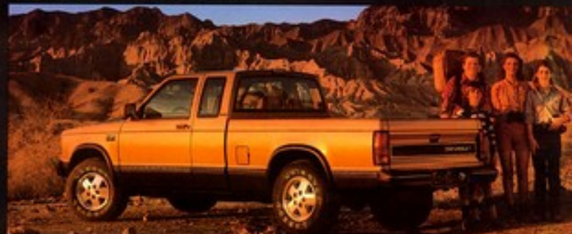
S-10 Maxi-Cab Sport 4x4 in Desert Sand and Satin Black.

bench seat. Or available rear jump seats (with required optional front buckets) provide seating for four. Outside visibility is good, too, through generous rear quarter windows, back window and windshield, all equipped with standard glare-reducing tinted glass.