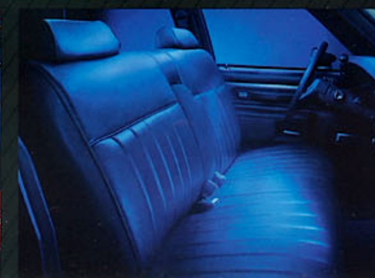
Caprice Wagon's three-way tailgate with power window permits easy loading of packages, cargo or people. The standard vinyl seat, shown at left, features a pull-down center armrest.