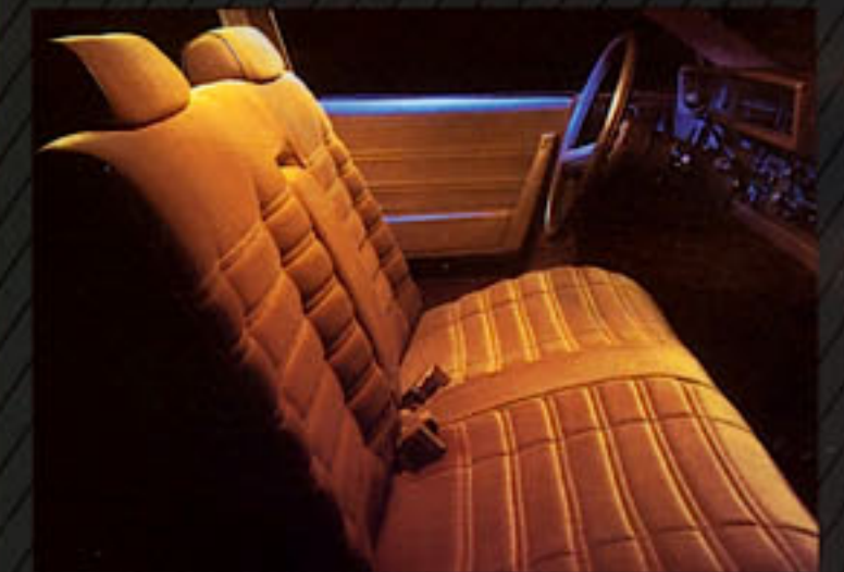
Standard bench seat with pull-down center armrest.

Take your choice of engines. From the smooth-running standard Electronic