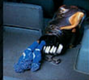
Split-folding rear seat is available.

In fact, Cavalier is so adaptable it just might become the favorite of everyone in your family.