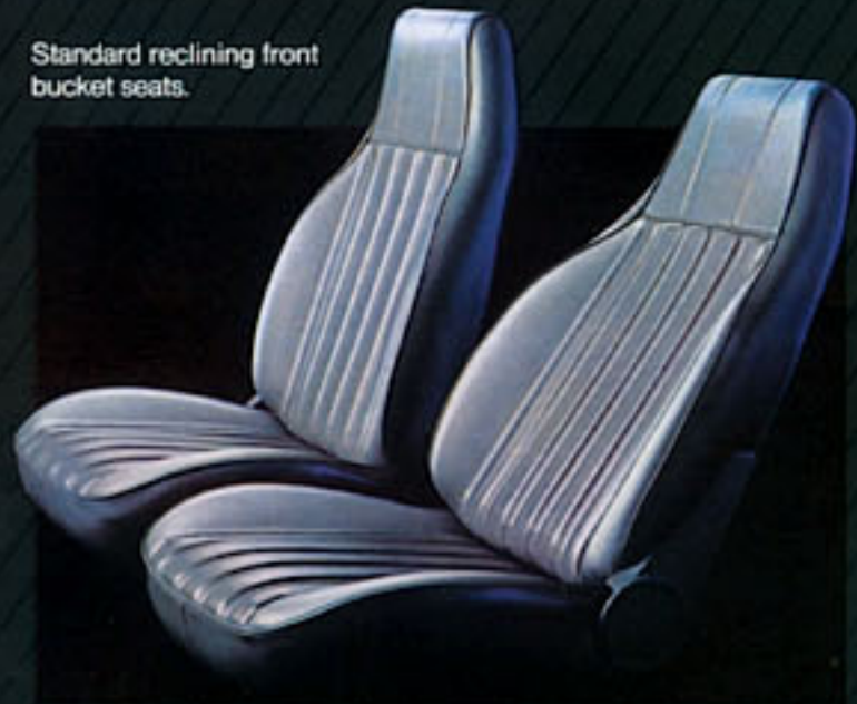
Standard reclining front bucket seats.