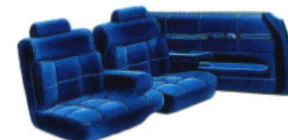
55/45 seat in Custom CL Cloth. Optional LS Coupe only.