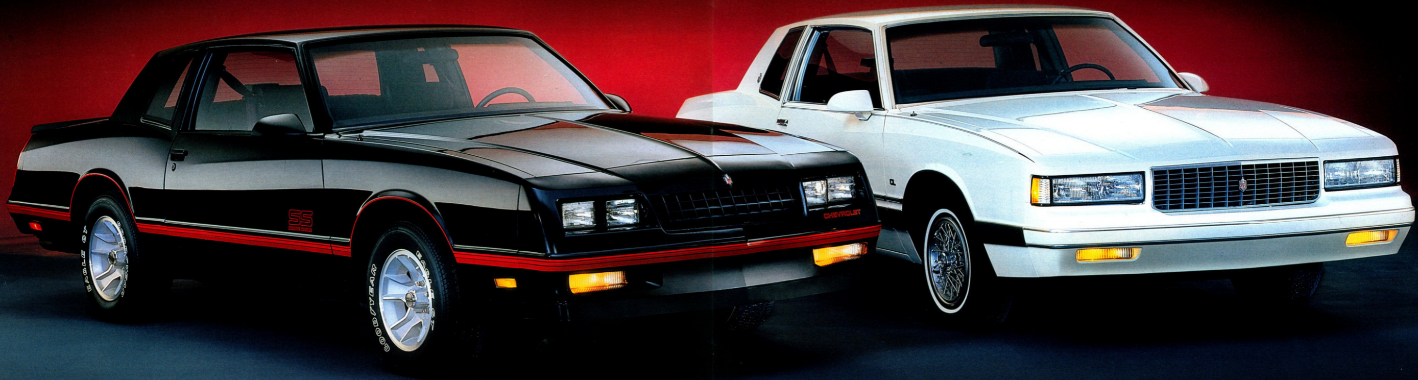
Monte Carlo LS.