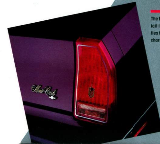
The Monte Carlo tail lamp exemplifies the quiet flair characteristic of LS.

But that's just half the story on Monte Carlo. Turn the page to discover the delights awaiting you inside.