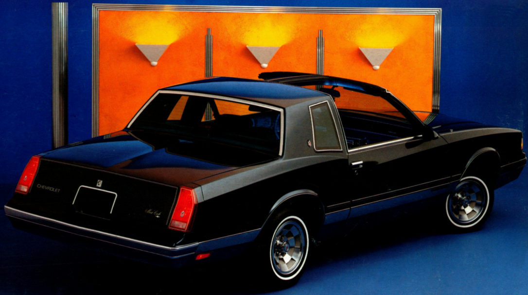
Monte Carlo LS in Dark Blue Metallic with optional T-tops and aluminum wheels.