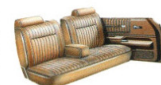
Standard cloth bench seat. Vinyl optional LS Coupe only.