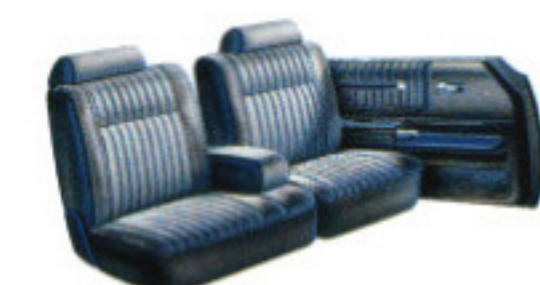
55/45 optional cloth seat. Available all models.