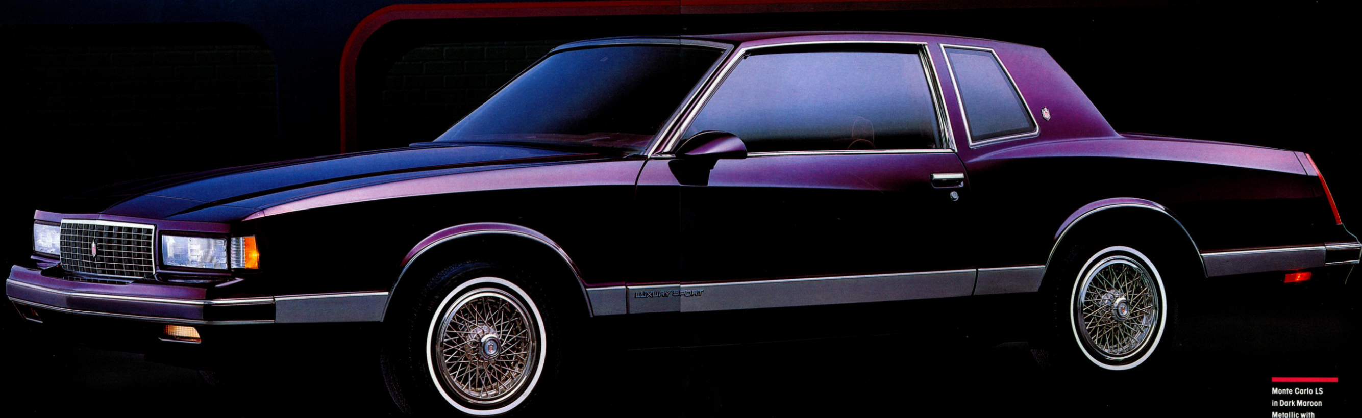
Monte Carlo LS in Dark Maroon Metallic with optional wire wheel covers.