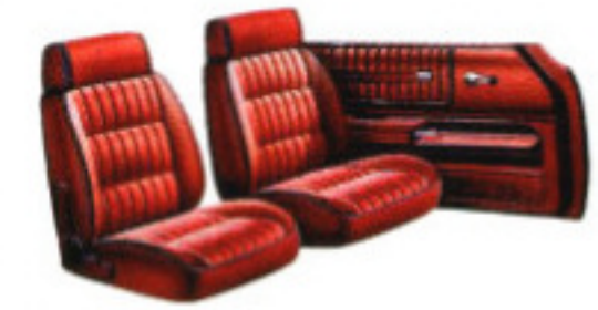
Optional cloth bucket seat. Available all models.