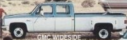
GMC WIDESIDE BONUS CAB PICKUP