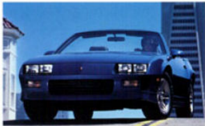
Camaro RS Convertible

Camaro RS and Camaro IROC-Z are available as coupes or as convertibles in 1989.