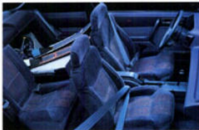
Beretta GT interior.