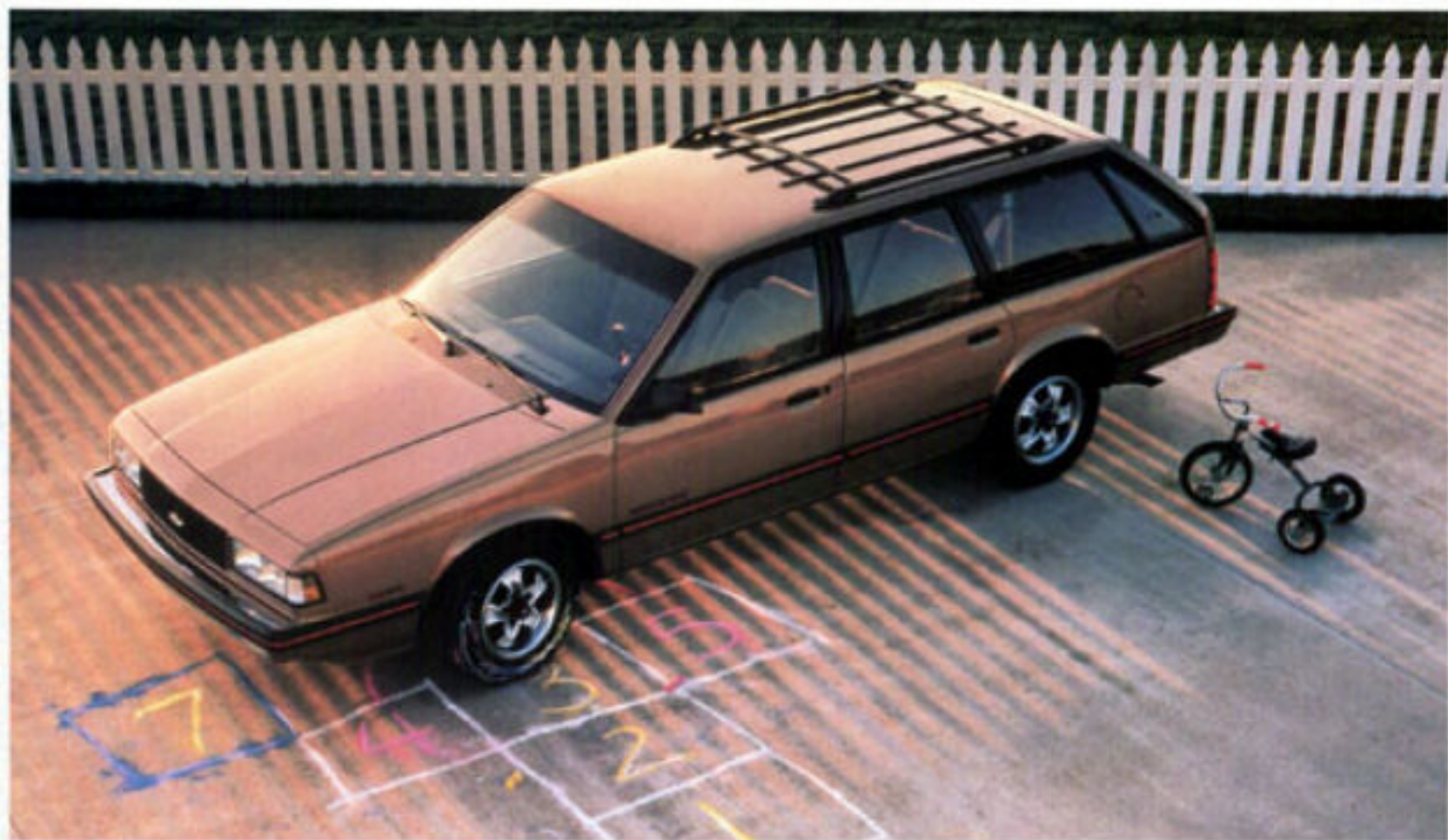
Celebrity Eurosport Wagon with optional roof carrier