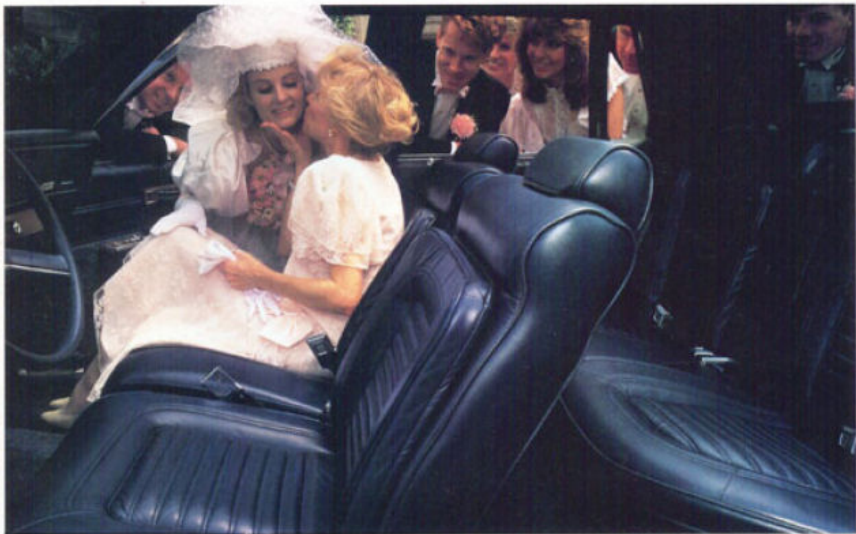
Caprice Classic Brougham LS interior with optional leather seating surfaces.

Chevrolet Caprice, one of America's most distinctive automobiles, retains its uncompromised size and style for 1989. Refinements to the popular full-size Chevrolet include standard V8 power and standard air conditioning on all models. Caprice continues to feature Full Coil suspension, full-frame construction and a proven rear-drive design. And when it's traveling time, you'll appreciate Caprice Sedan's huge 20.9-cu.-ft. trunk.