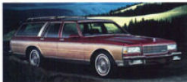
Caprice Classic Estate Wagon with optional roof carrier.