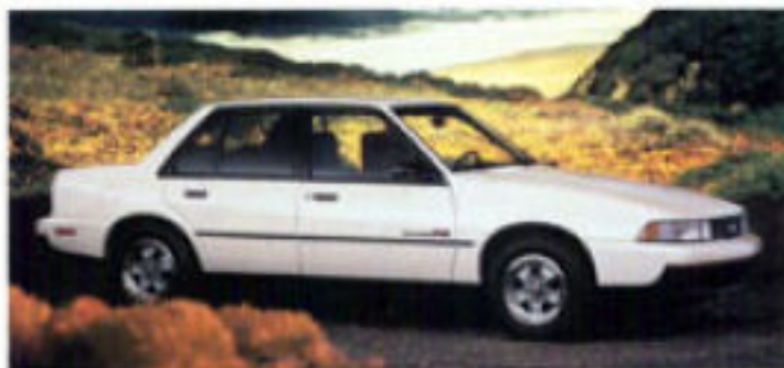
Cavalier RS Sedan.