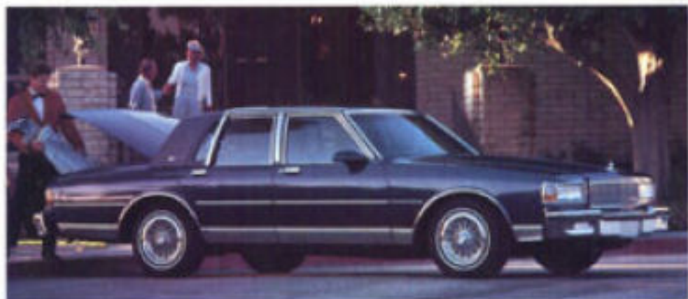
Caprice Classic Brougham LS features an elegant padded landau-style rear roof treatment.

NOTE: For additional details on any 1989 Chevrolet featured in this folder, see your Chevrolet dealer for a complete selection of brochures by vehicle line. They include * Cavalier * Beretta * Corsica * Camaro * Celebrity * Caprice * Corvette.