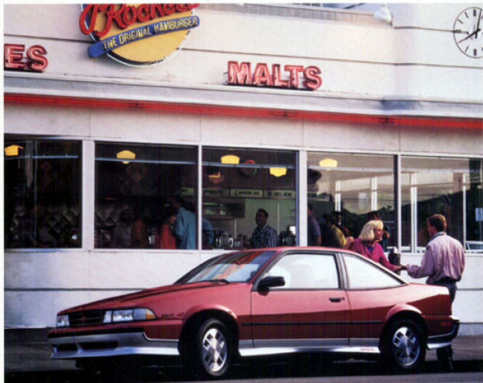
Cavalier Z24 Coupe.