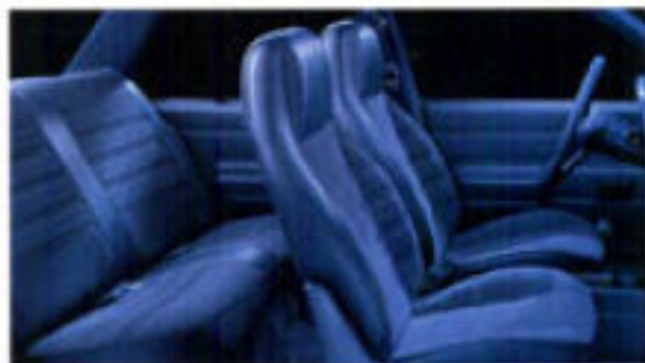
Cavalier Sedan interior.