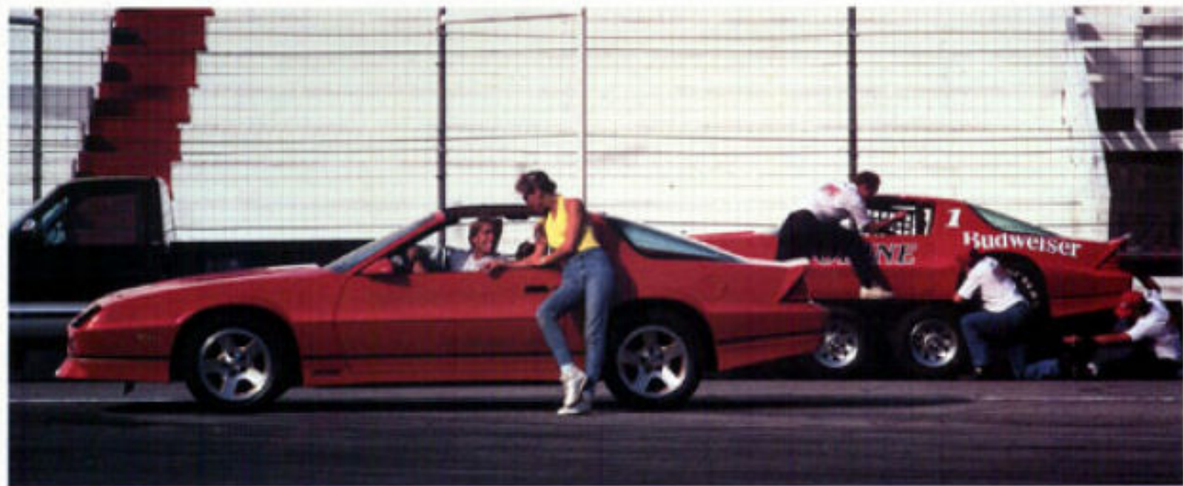
Camaro IROC-Z Coupe with optional 16" aluminum wheels and Eagle unidirectional tires