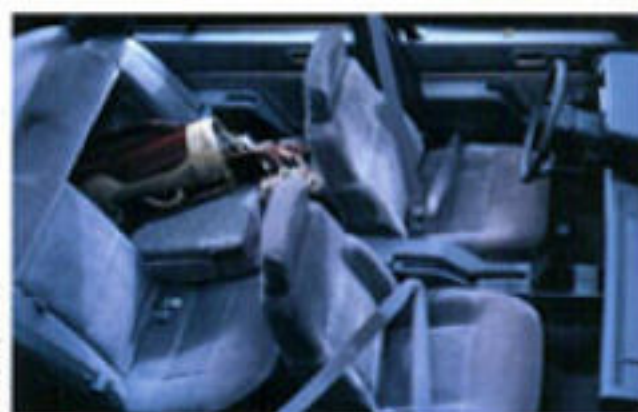
Corsica LTZ's luxury interior includes overhead console and 60/40 split-folding rear seat with center armrest.