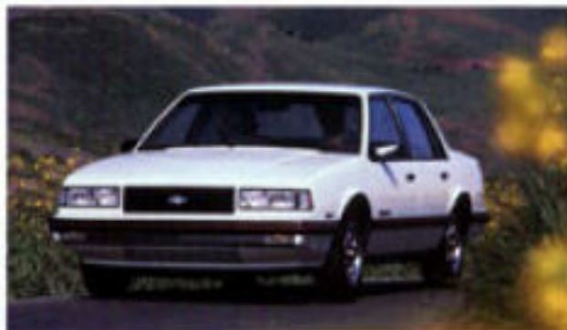
Celebrity Eurosport Sedan

The popular Eurosport package transforms Celebrity into a sport sedan—at an affordable price. It includes a performance-tuned suspension, quick-ratio power steering, larger P195/75R-14 all-season radial tires, blackout exterior trim with red-accent striping, Rally Wheels with trim rings, padded sport steering wheel and special identification.