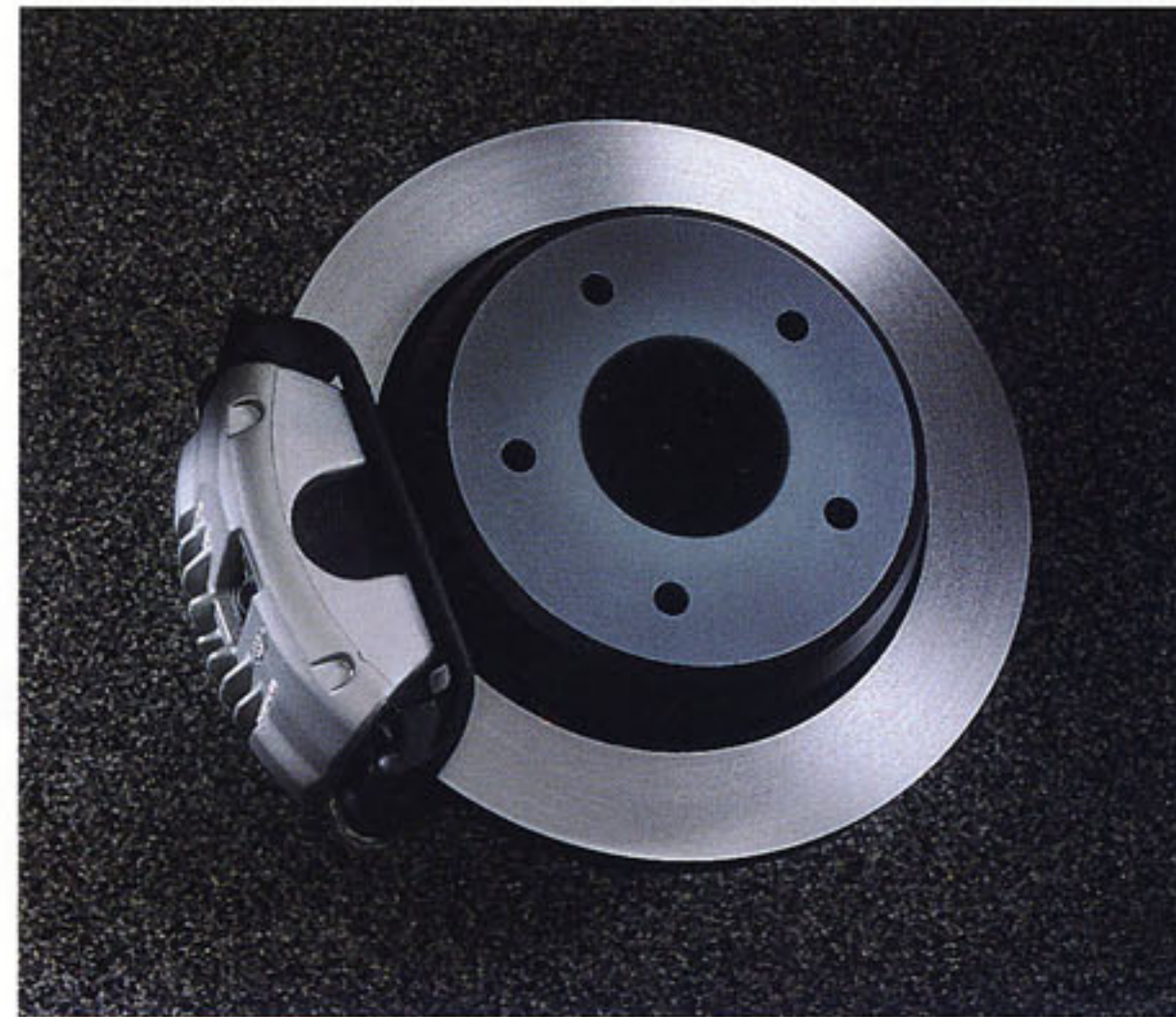
Standard on Impala SS: a large-diameter disc brake at each wheel and a four-wheel anti-lock brake system (ABS).

A specially-tuned De Carbon shock absorber and coil spring at each wheel deliver impressive ride characteristics while maintaining road feel. The special Ride and Handling Suspension also includes tuned front and rear stabilizer bars.