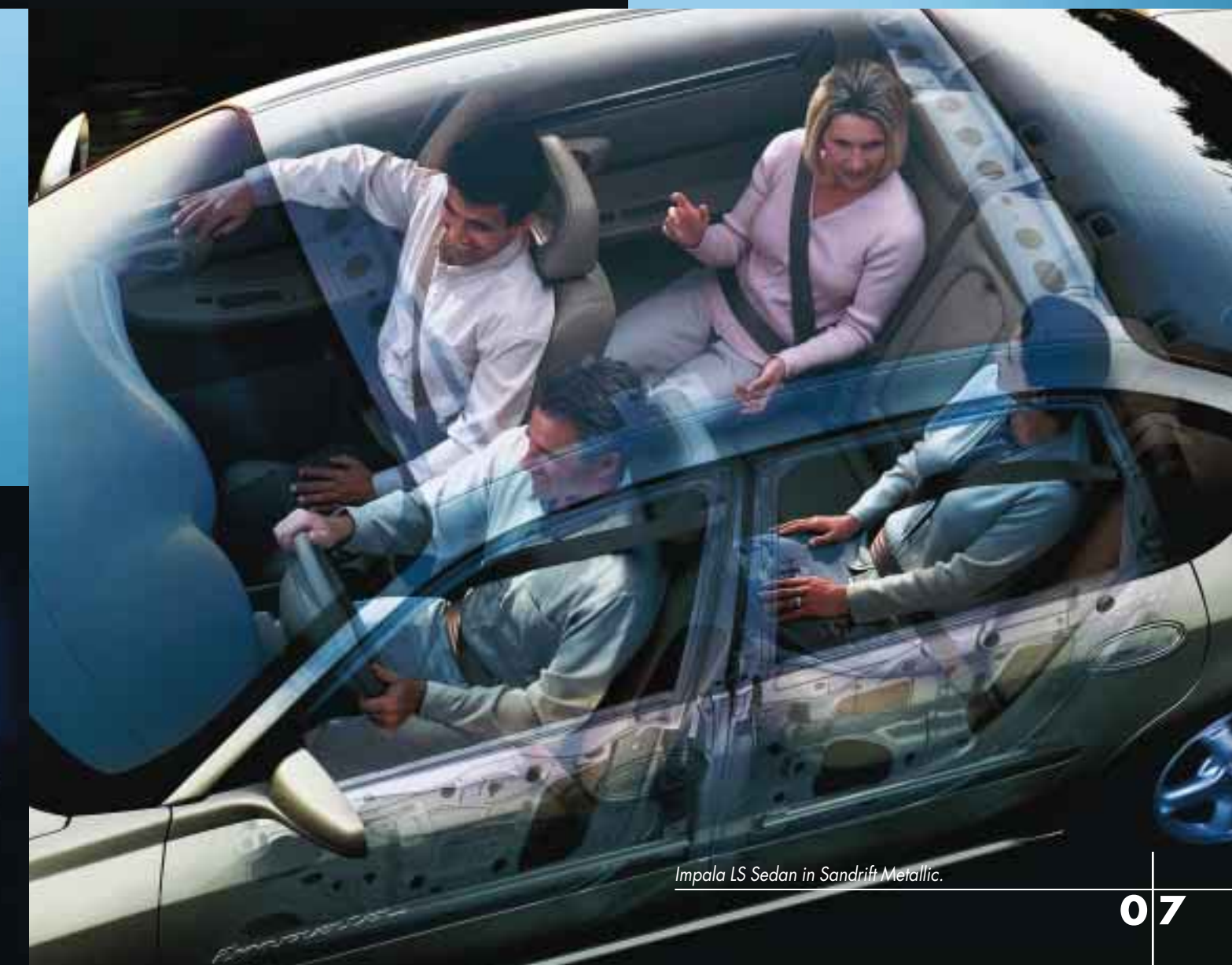
Impala LS Sedan in Sandrift Metallic.

Impala has a high-strength steel "safety-cage" body structure with side-door beams. Front and rear "crush zones" absorb energy in a collision to help preserve the integrity of the passenger compartment.