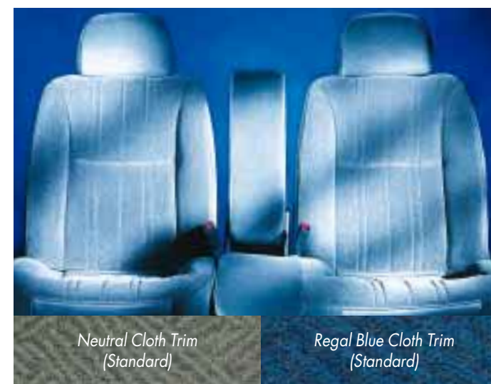
Neutral Cloth Trim (Standard)