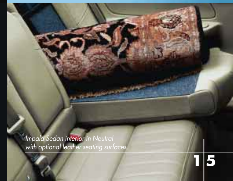
Impala Sedan interior in Neutral with optional leather seating surfaces.

An optional split-folding rear seat (included with optional Custom Cloth seating and leather seating surfaces) adds to Impala's already impressive cargo-carrying capacity.