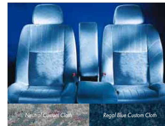
Neutral Custom Cloth