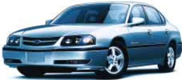
Galaxy Silver Metallic