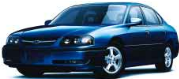
Superior Blue Metallic