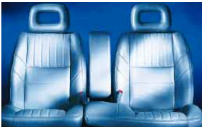
Neutral Leather Seating Surfaces (Optional)

60/40 SPLIT-BENCH SEAT WITH LEATHER SEATING SURFACES OPTIONAL IN ALL IMPALA MODELS