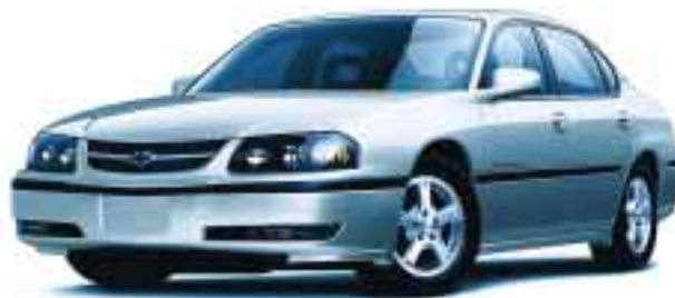
Cappuccino Frost Metallic