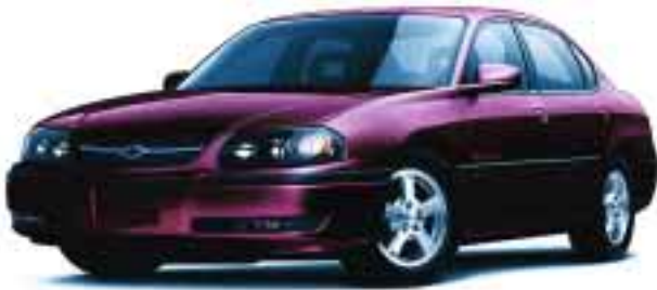
Berry Red Metallic