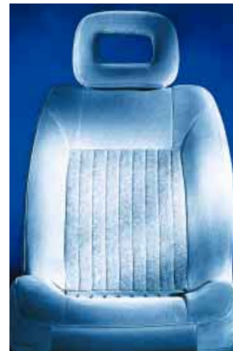
Neutral Sport Cloth