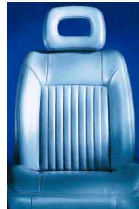
Neutral Leather Seating Surfaces (Optional)