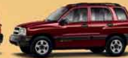
MEDIUM RED METALLIC