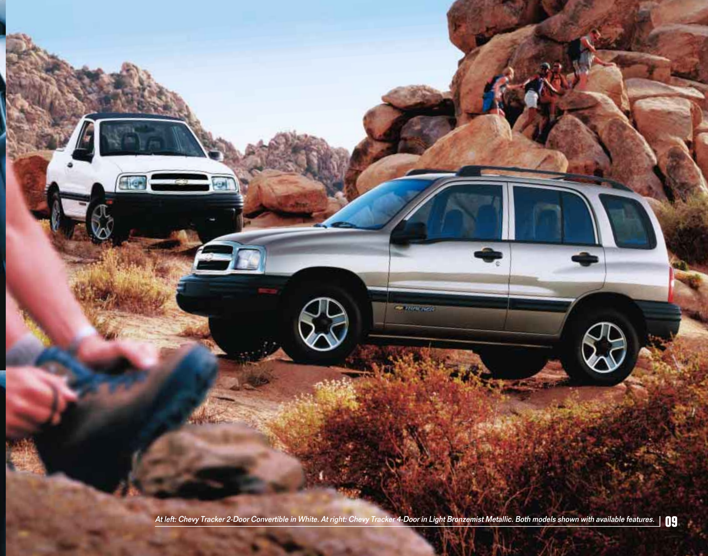
At left: Chevy Tracker 2-Door Convertible in White. At right: Chevy Tracker 4-Door in Light Bronzemist Metallic. Both models shown with available features.