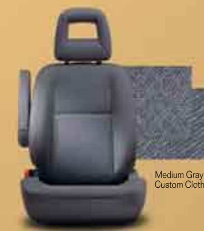
Medium Gray Custom Cloth