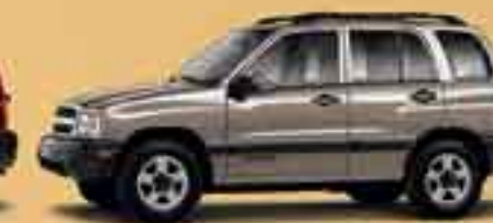
LIGHT BRONZEMIST METALLIC