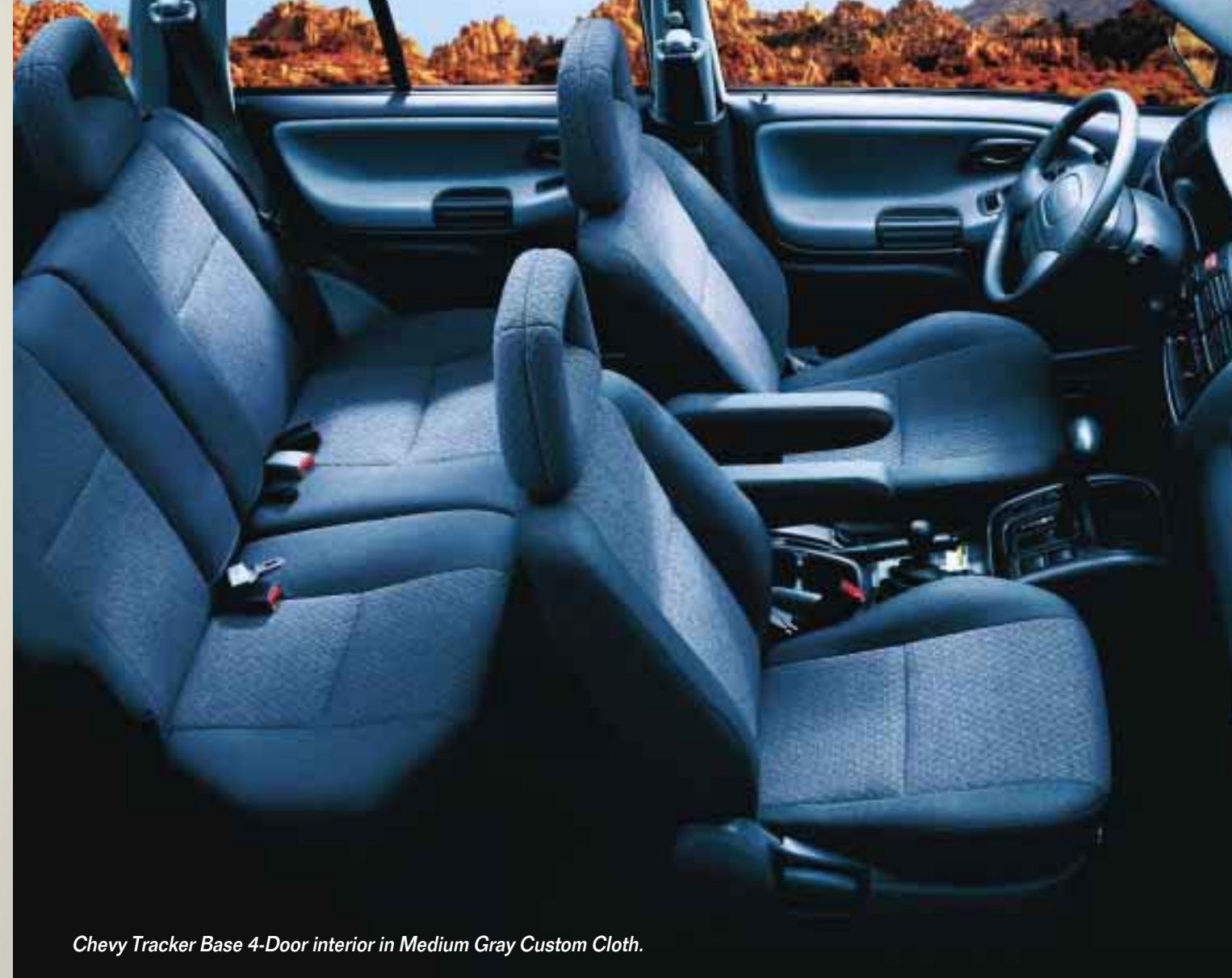
Chevy Tracker Base 4-Door interior in Medium Gray Custom Cloth.