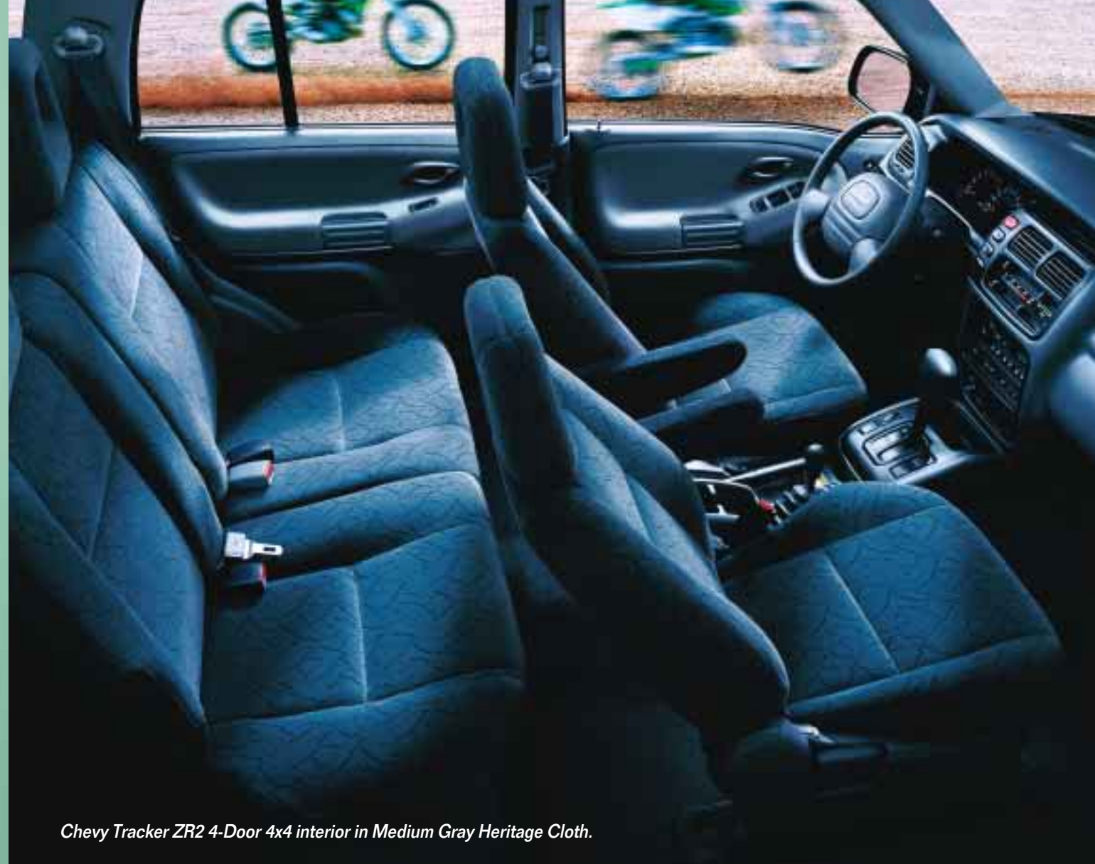
Chevy Tracker ZR2 4-Door 4x4 interior in Medium Gray Heritage Cloth.

Dirt bike racers know that to master a challenging track, you need a competitive spirit and off-road expertise. So you can see why Tracker ZR2 fits right in. There's more about ZR2 4x4 at chevy.com , but first check out these features: ■ ZR2 Off-Road Package: skid plates, wider track, wheel flares with mud flaps, ZR2 grille, alloy wheels, P215/75R-15 tires, vinyl spare tire cover and Heritage Cloth (full seat surface). ■ V6 engine (4-Door only). ■ Shift-on-the-fly 4x4 (up to 60 mph). ■ Four-speed automatic transmission with fourth-gear overdrive (standard on 4-Door, available on Convertible).