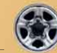
15-INCH BASE STEEL WHEEL