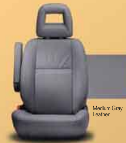
Medium Gray Leather