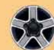
15-INCH LT ALLOY WHEEL (OPTIONAL ON BASE)