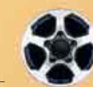
15-INCH ZR2 ALLOY WHEEL