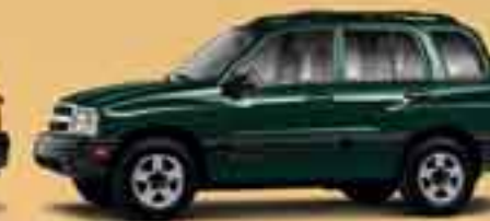
DARK GREEN METALLIC