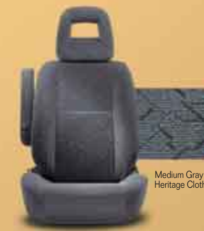
Medium Gray Heritage Cloth