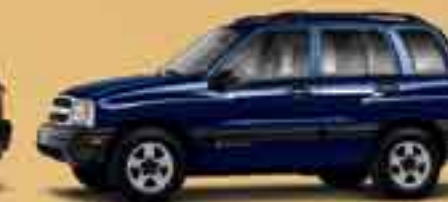
INDIGO BLUE METALLIC