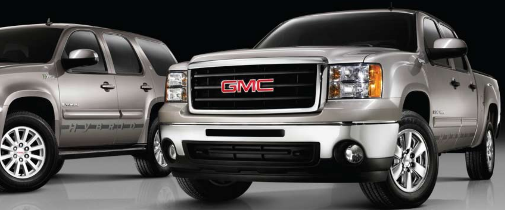
YUKON HYBRID SHOWN IN SILVER BIRCH METALLIC WITH AVAILABLE EQUIPMENT