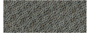
MEDIUM PEWTER Not available with Sand Beige Metallic