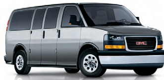
STEEL GRAY METALLIC EXTRA-COST COLOR