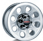
P03 ▣ 17" 6-LUG GRAY-PAINTED STEEL WITH CHROME CENTER CAP ▣ STANDARD: 1500 SERIES LT TRIM ▣ AVAILABLE: 1500 SERIES LS TRIM