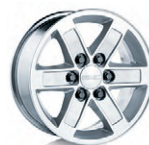
N88 ▣ 17" 6-LUG POLISHED ALUMINUM SPORT ▣ AVAILABLE: 1500 SERIES