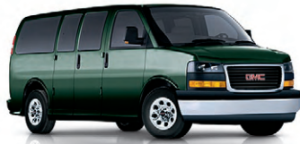
POLO GREEN METALLIC EXTRA-COST COLOR