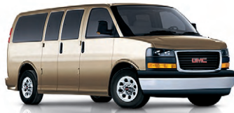
SAND BEIGE METALLIC EXTRA-COST COLOR