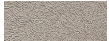
NEUTRAL Not available with Pure Silver Metallic or Steel Gray Metallic