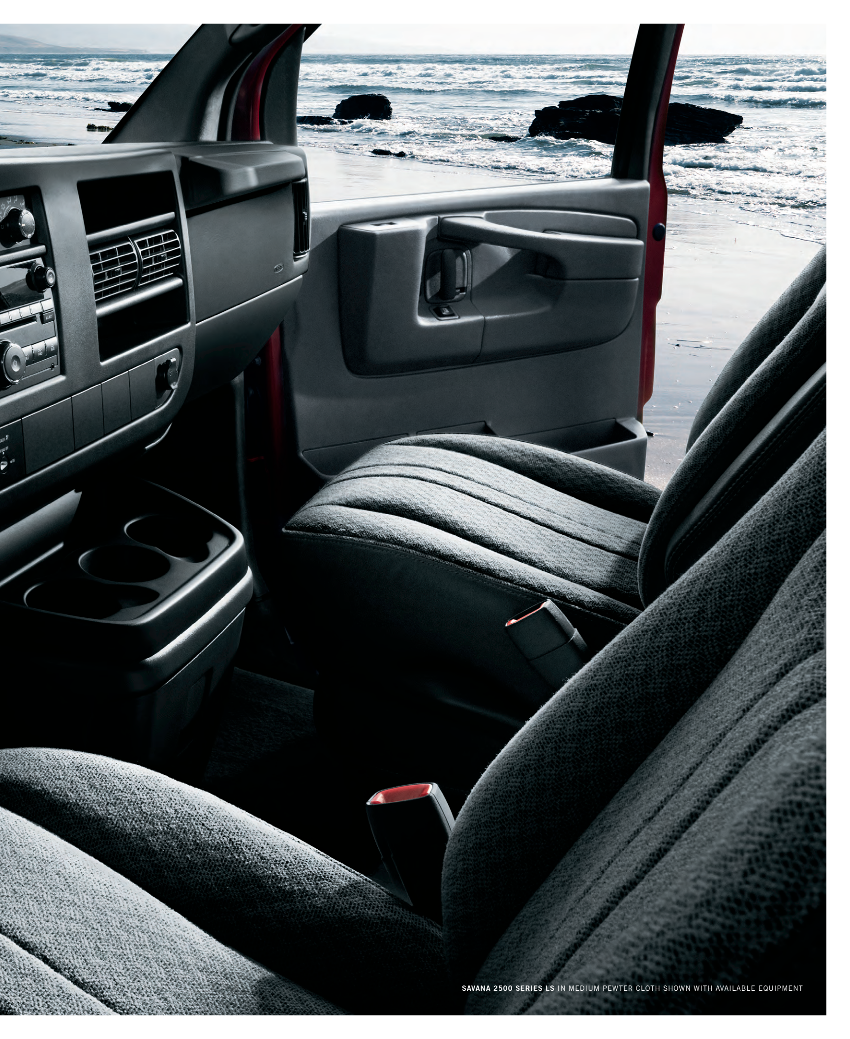
SAVANA 2500 SERIES LS IN MEDIUM PEWTER CLOTH SHOWN WITH AVAILABLE EQUIPMENT