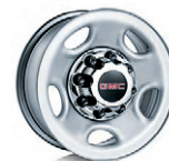
P03 ▣ 16" 8-LUG GRAY-PAINTED STEEL WITH CHROME CENTER CAP ▣ STANDARD: 2500/3500 SERIES LT TRIM ▣ AVAILABLE: 2500/3500 SERIES LS TRIM