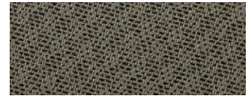
NEUTRAL Not available with Pure Silver Metallic or Steel Gray Metallic