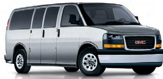
PURE SILVER METALLIC EXTRA-COST COLOR