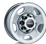
QB5 ▣ 16" 8-LUG GRAY-PAINTED STEEL ▣ STANDARD: 2500/3500 SERIES LS TRIM ▣ AVAILABLE: 2500/3500 SERIES LT TRIM