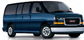
DEEP BLUE METALLIC EXTRA-COST COLOR