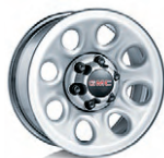
NX7 ▣ 17" 6-LUG GRAY-PAINTED STEEL ▣ STANDARD: 1500 SERIES LS TRIM