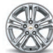
16" Aluminum (Standard on LT)