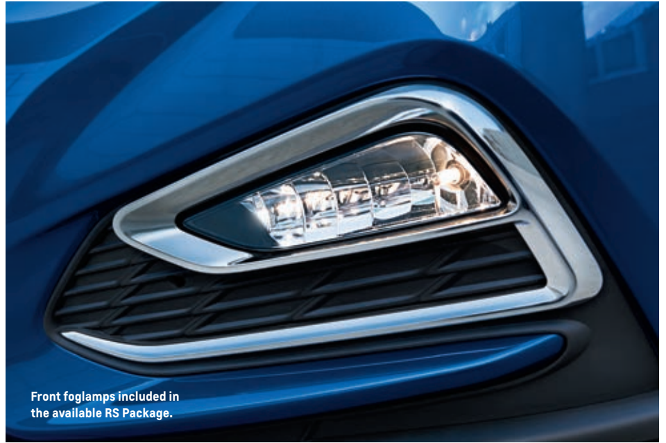
Front foglamps included in the available RS Package.