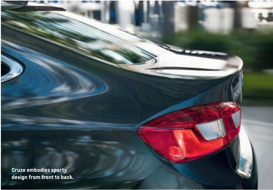
Cruze embodies sporty design from front to back.