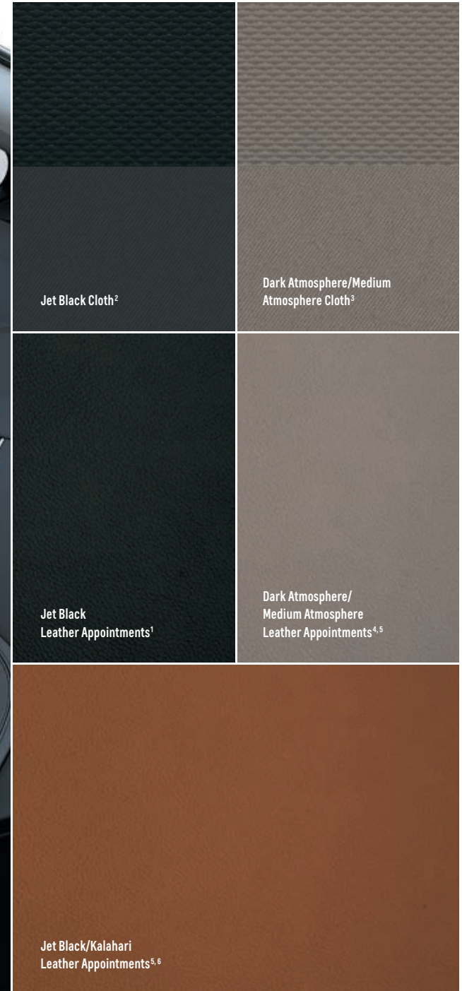
Jet Black Cloth 2