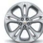
18" Machined-Face Aluminum (Available on Premier) 4