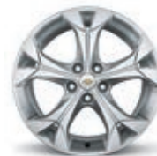
17" Aluminum (Standard on Premier)