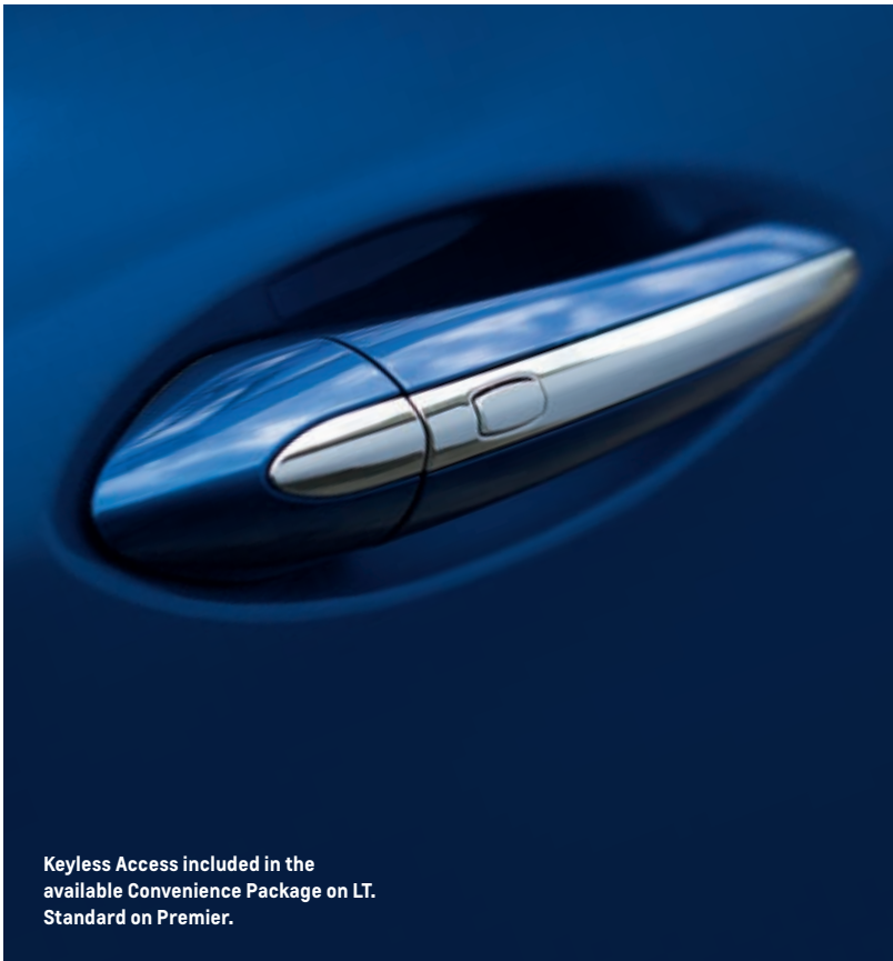
Keyless Access included in the available Convenience Package on LT. Standard on Premier.