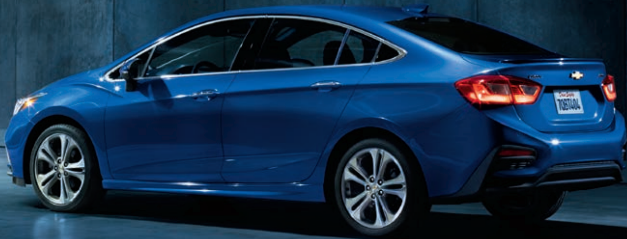
Cruze Premier in Kinetic Blue Metallic (extra-cost color) with available features including the RS Package.