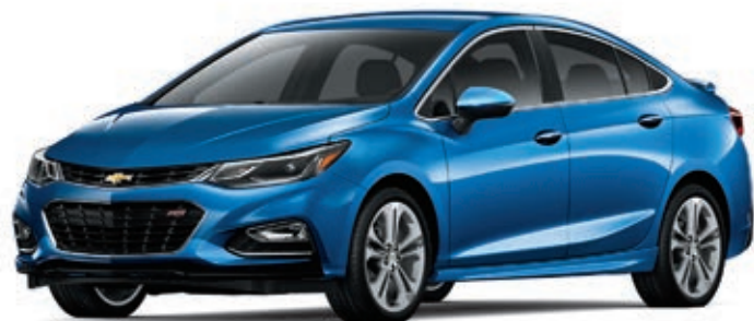
KINETIC BLUE METALLIC 1,2