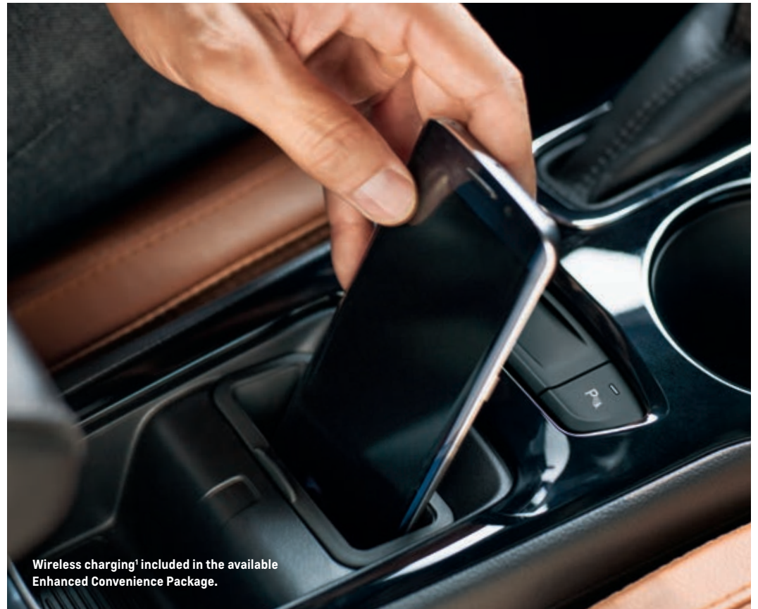
Wireless charging 1 included in the available Enhanced Convenience Package.