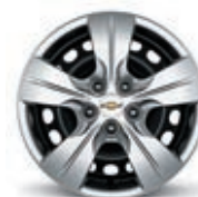
15" Steel with Painted Wheel Covers (Standard on L and LS)