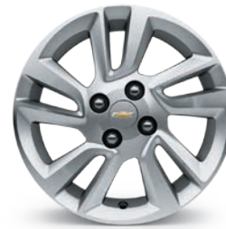
15" Aluminum 3