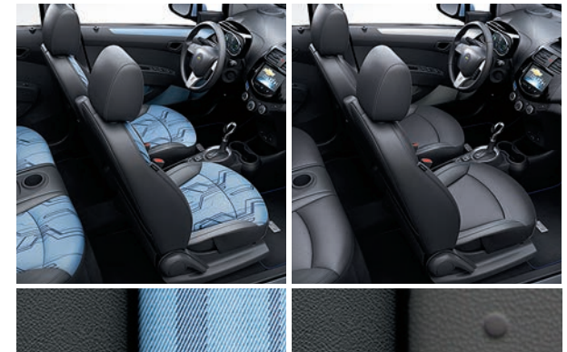
Electric Blue Cloth with Electric Blue Trim (1LT)