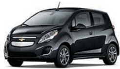
BLACK GRANITE 1