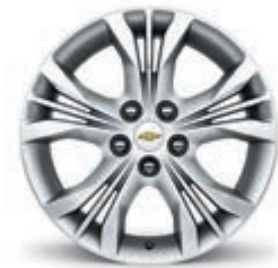
18" Painted-Aluminum (Standard on LT)