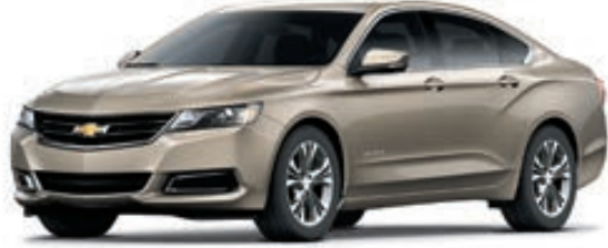
PEPPERDUST METALLIC 3