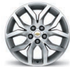
19" Machined-Face Aluminum (Standard on Premier)