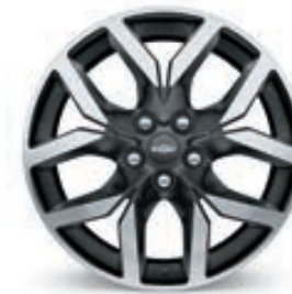
19" Special Midnight Edition with Black-Painted Pockets (Available on LT and Premier) 2