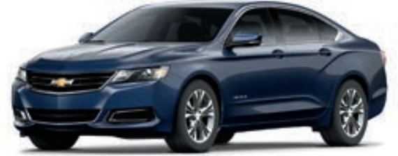
BLUE VELVET METALLIC