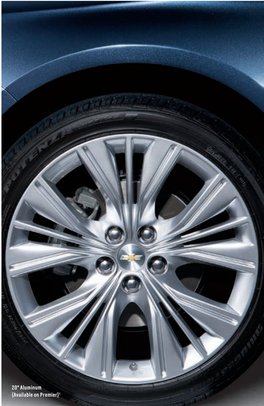
20" Aluminum (Available on Premier) 1