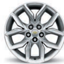
19" Painted-Aluminum (Available on LT) 3