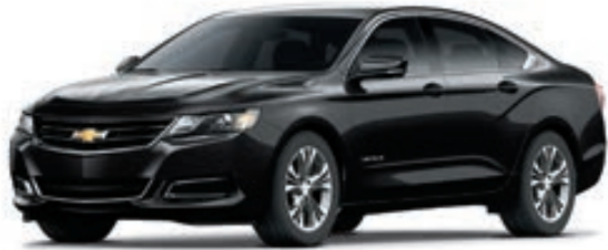
MOSAIC BLACK METALLIC 3