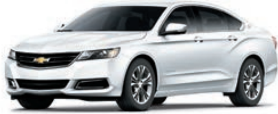
SUMMIT WHITE 1