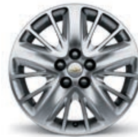
18" Steel with Fascia-Spoke Wheel Cover (Standard on LS)