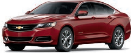
SIREN RED TINTCOAT 2,3