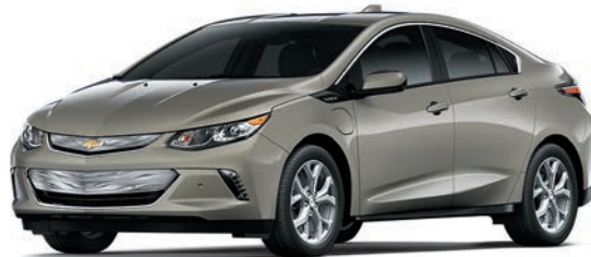
PEPPERDUST METALLIC 2