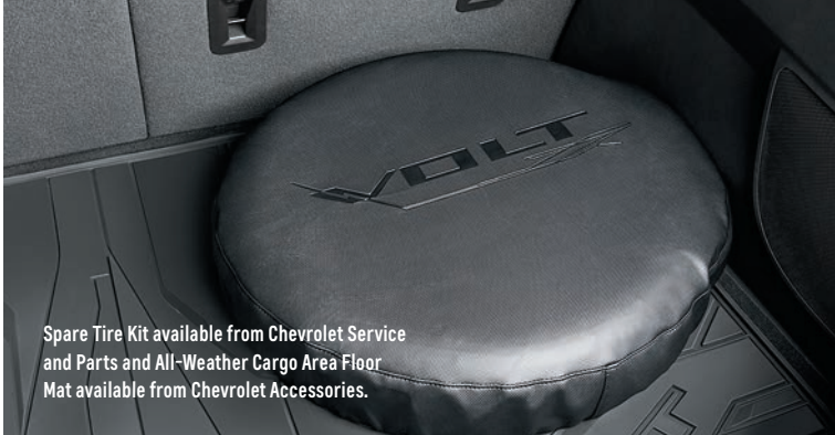
Spare Tire Kit available from Chevrolet Service and Parts and All-Weather Cargo Area Floor Mat available from Chevrolet Accessories.