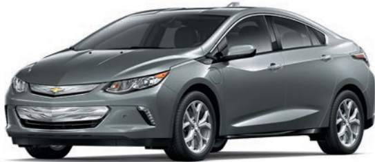
HEATHER GRAY METALLIC