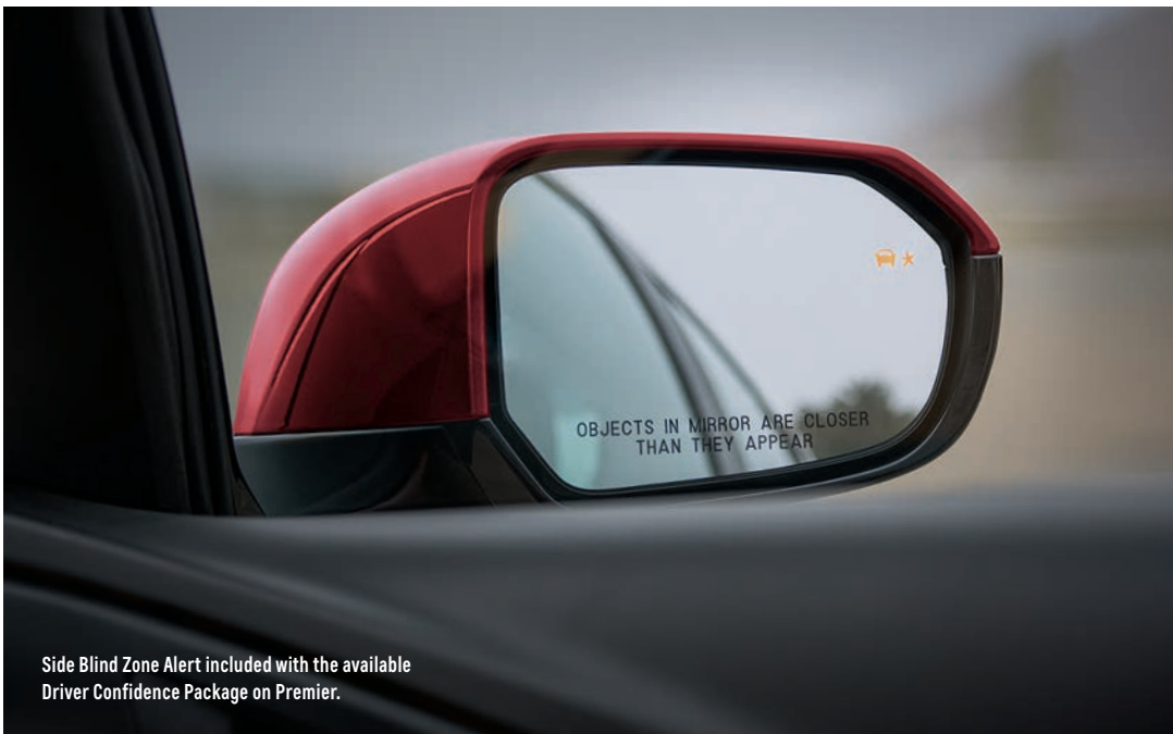
Side Blind Zone Alert included with the available Driver Confidence Package on Premier.