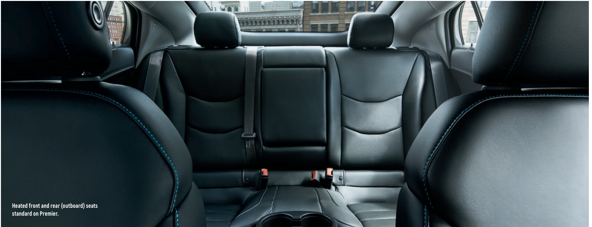
Heated front and rear (outboard) seats standard on Premier.