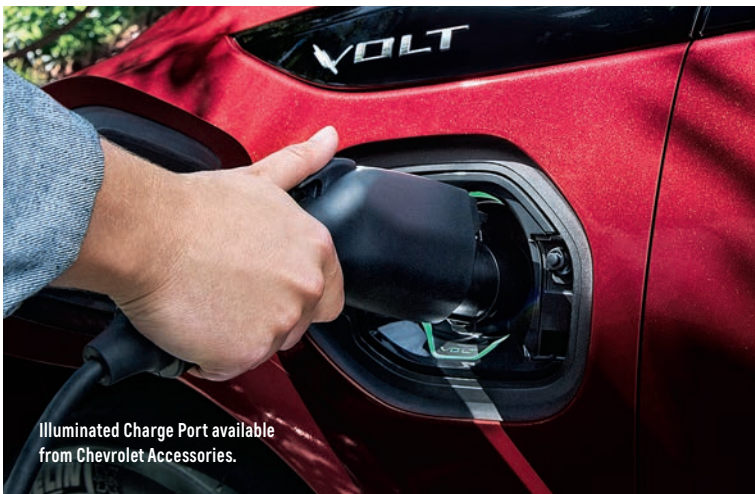
Illuminated Charge Port available from Chevrolet Accessories.