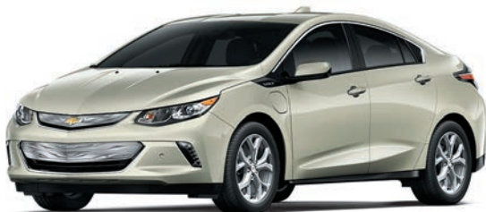
CITRON GREEN METALLIC 3,4