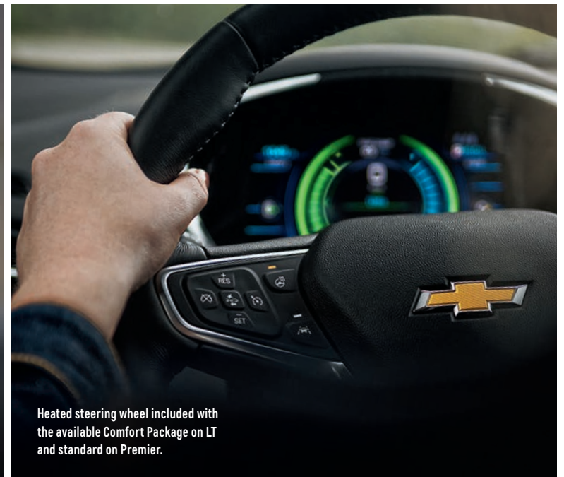
Heated steering wheel included with the available Comfort Package on LT and standard on Premier.