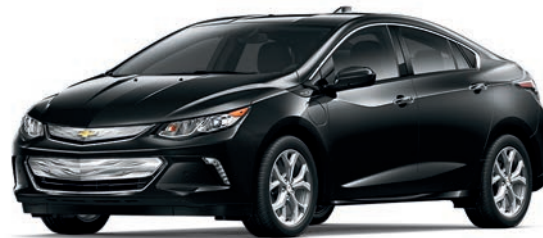
MOSAIC BLACK METALLIC