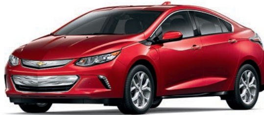
CAJUN RED TINTCOAT 1,2