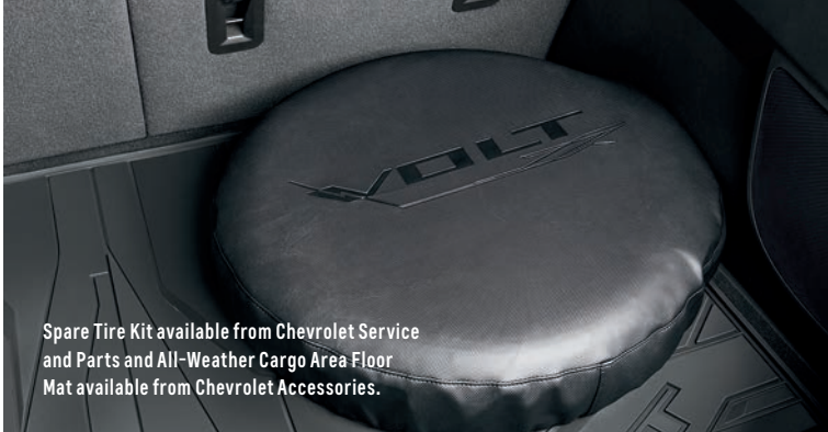
Spare Tire Kit available from Chevrolet Service and Parts and All-Weather Cargo Area Floor Mat available from Chevrolet Accessories.