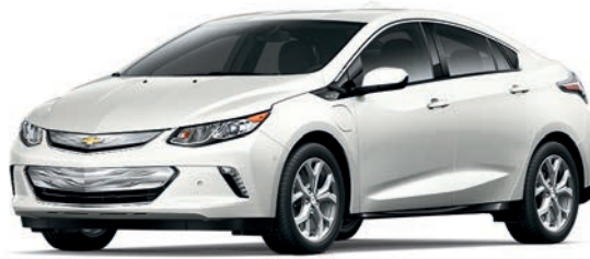
IRIDESCENT PEARL TRICOAT 1