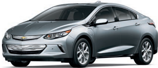
SATIN STEEL METALLIC