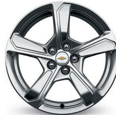
17" Painted-Aluminum (Standard on LT)