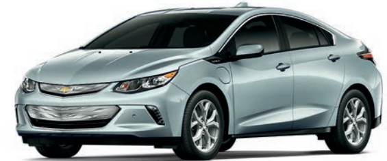
GREEN MIST METALLIC 3