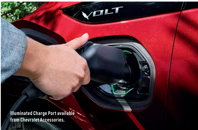
Illuminated Charge Port available from Chevrolet Accessories.