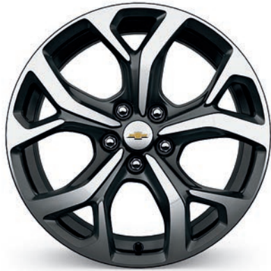
17" Ultra-Bright Machined-Aluminum Wheels with Gloss Black-Painted Pockets available from Chevrolet Accessories.