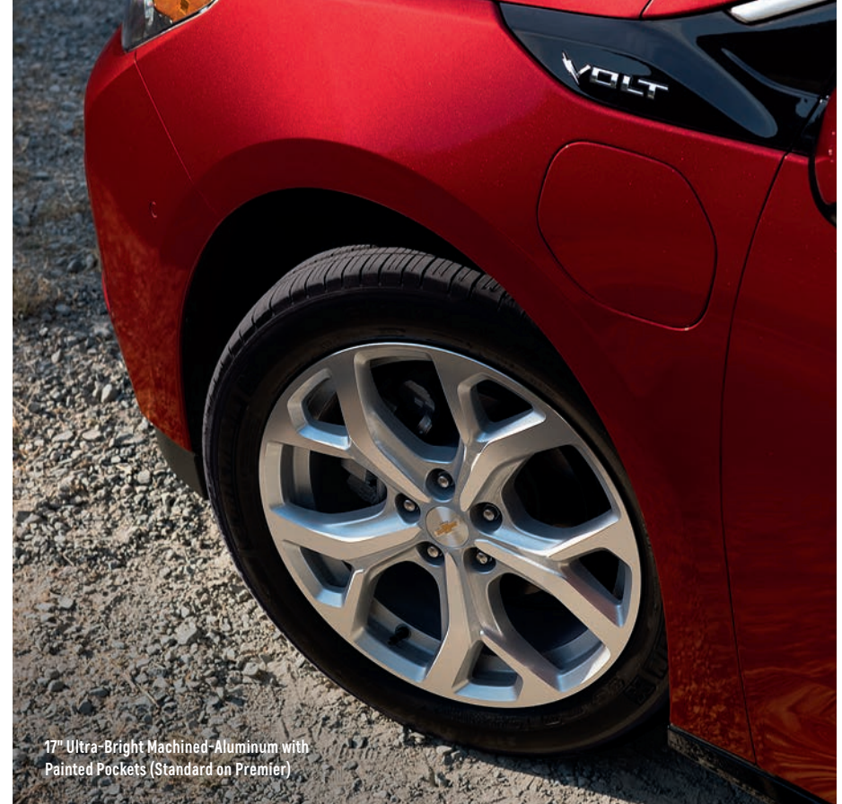
17" Ultra-Bright Machined-Aluminum with Painted Pockets (Standard on Premier)