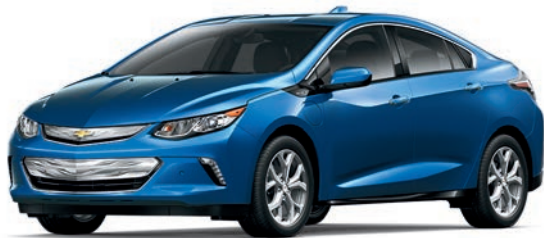
KINETIC BLUE METALLIC 1,3