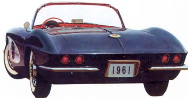
CORVETTE in Tuxedo Black. Freshly styled rear features new dual taillight design.

FOR FURTHER INFORMATION ON CORVETTE EQUIPMENT AND OPTIONS, SEE THE COMPLETE CORVETTE CATALOG.