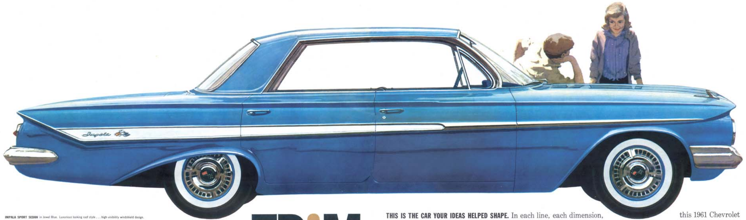
IMPALA SPORT SEDAN in Jewel Blue. Luxurious looking roof style . . . high-visibility windshield design.