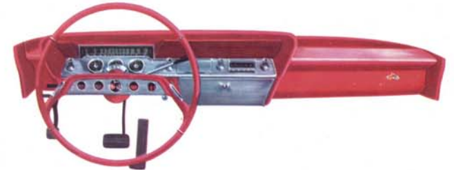
LOOK AT Chevrolet's completely new Instrument Console. See how all the instruments, including the clock in Impala models, are positioned directly in front of the driver. In addition, its compact design puts the heater controls, radio controls, ash tray and glove box all within easy reach of the driver.

In every dimension, this 1961 Chevrolet has been planned for your convenience. In fact, you can actually measure the comfort you get! Door openings are wider and roomier in every model. Higher seats give more comfortable seating. Best of all, careful engineering has given Chevy the remarkable combination of trim new size outside . . . more room inside in the dimensions that mean most to your comfort! There's more front seat head room and leg room in all models . . . more rear foot room. And the quality and workmanship in Chevy's Body by Fisher are evident at a glance. There are functional fabrics, in a wide variety of bright new colors and patterns. The handsome new Instrument Console strikes a clearly luxurious note—puts all controls at your finger tips. Chevrolet's new trunk design gives you more usable luggage space. Here, indeed, is fine new comfort in Chevrolet for 1961 . . . THE GREATEST SHOW ON WORTH!