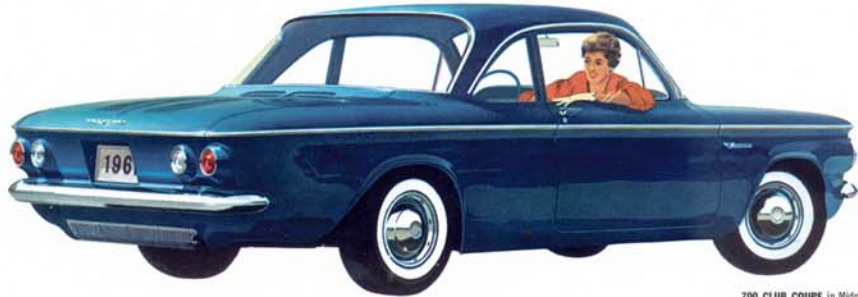
700 CLUB COUPE in Midnight Blue. De luxe interiors in three bright colors in all 700 series models.