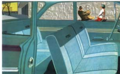
Bel Air 2-Door and 4-Door Sedans feature this new patterned upholstery for '61. Shown above is the 2-Door Sedan in turquoise. This interior is offered in a total of five bright new colors and is complemented by a wear-resistant vinyl-coated rubber floor mat keyed to interior color.