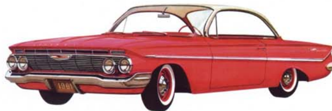
BEL AIR SPORT COUPE in Roman Red and Ermine White. New parallel-action windshield wipers, standard on every Chevy, clear more glass area.