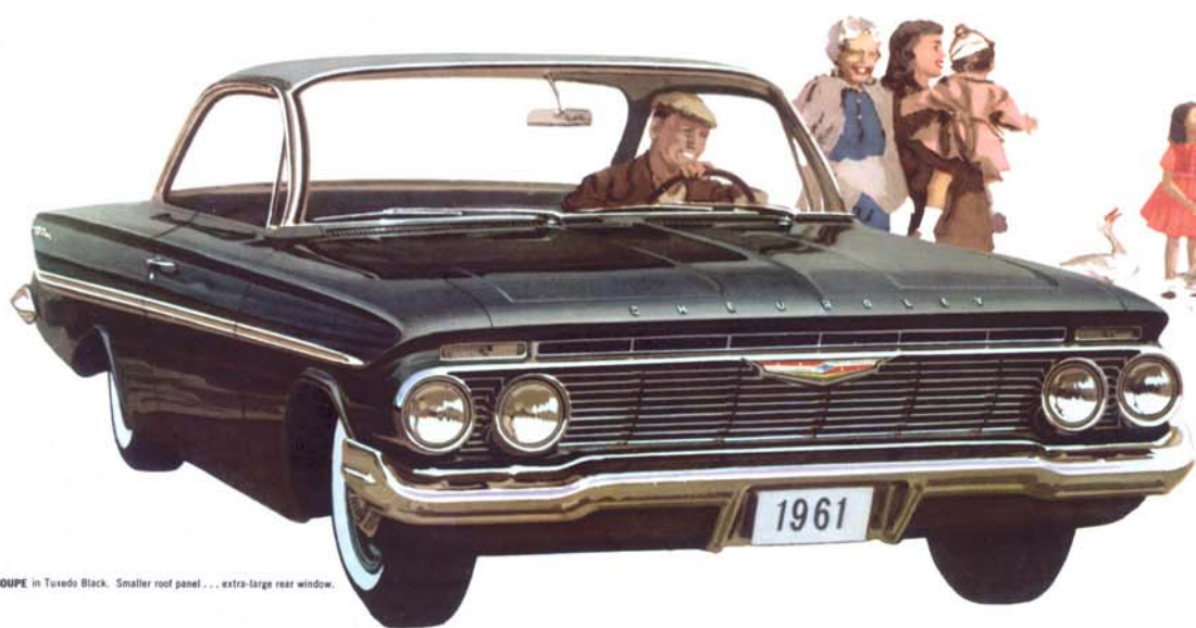
BEL AIR SPORT COUPE in Tuxedo Black. Smaller roof panel... extra-large rear window.