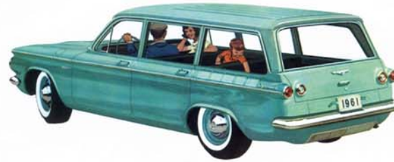
LAKWOOD 700 4-DOOR STATION WAGON in Seafair Green. Lively Corvair Turbo-Air 6 is standard equipment.