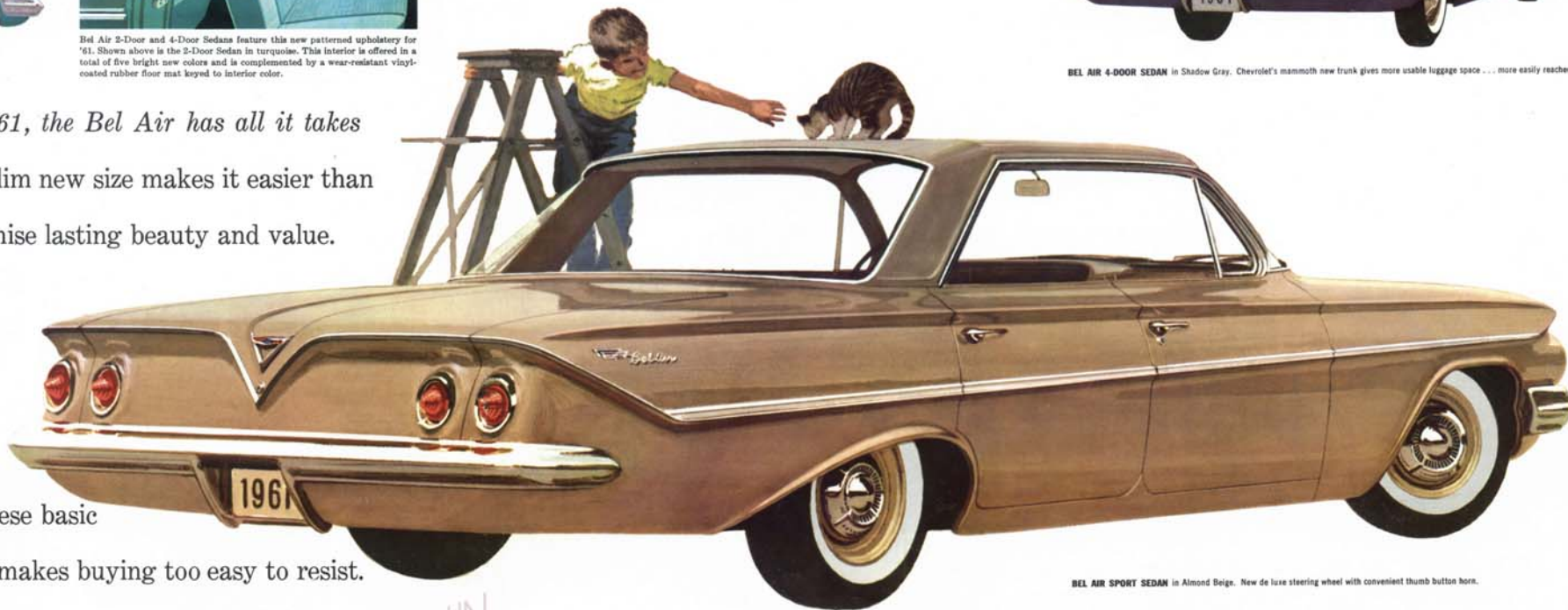
BEL AIR SPORT SEDAN in Almond Beige. New de luxe steering wheel with convenient thumb button horn.

Chevy virtues are yours in Bel Air, plus a price that makes buying too easy to resist.