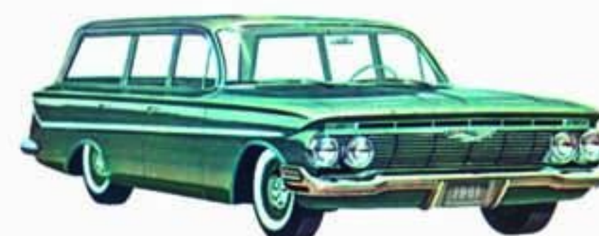
PARKWOOD 4-DOOR 6-PASSENGER STATION WAGON in Arbor Green. Offers 10.5 cu. ft. of hidden cargo space beneath the floor . . . lock is optional at extra cost.