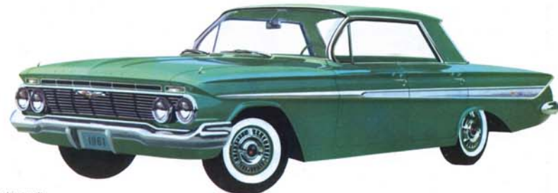
IMPALA SPORT SEDAN in Arbor Green. Glamorous hardtop styling . . . tasteful, easy-to-care-for trim accents.

◀ Open the door of any Impala, this one is a Sport Sedan, and you'll discover a brand of beauty you'd expect to find in only the highest priced cars. Impala seats are upholstered in rich patterned fabrics, trimmed with soft leather-grain vinyl and finished with distinctive bright metal end panels. Interiors are available in six beautiful color combinations. De luxe window cranks, fingertip door releases and extra-long arm-rests with built-in safety reflectors all add to the Impala's air of elegance. And in every Impala model, front or rear, you enjoy the comfort of foam cushioned seats.