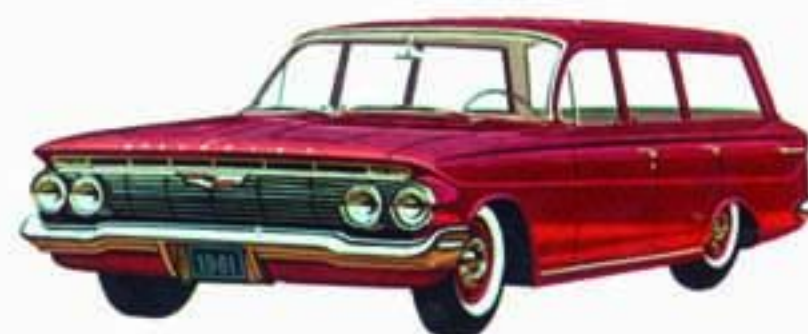
BROOKWOOD 4-DOOR 6-PASSENGER STATION WAGON in Honduras Maroon. Chevy's lowest priced wagon upholstered in washable patterned vinyl.