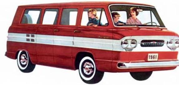
GREENBRIER DE LUXE SPORTS WAGON in Romany Maroon and Cameo White. Available in 15 solid colors and 14 two-tone combinations.