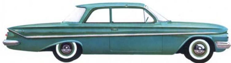
BEL AIR 2-DOOR SEDAN in Twilight Turquoise. Lowest priced Bel Air model.