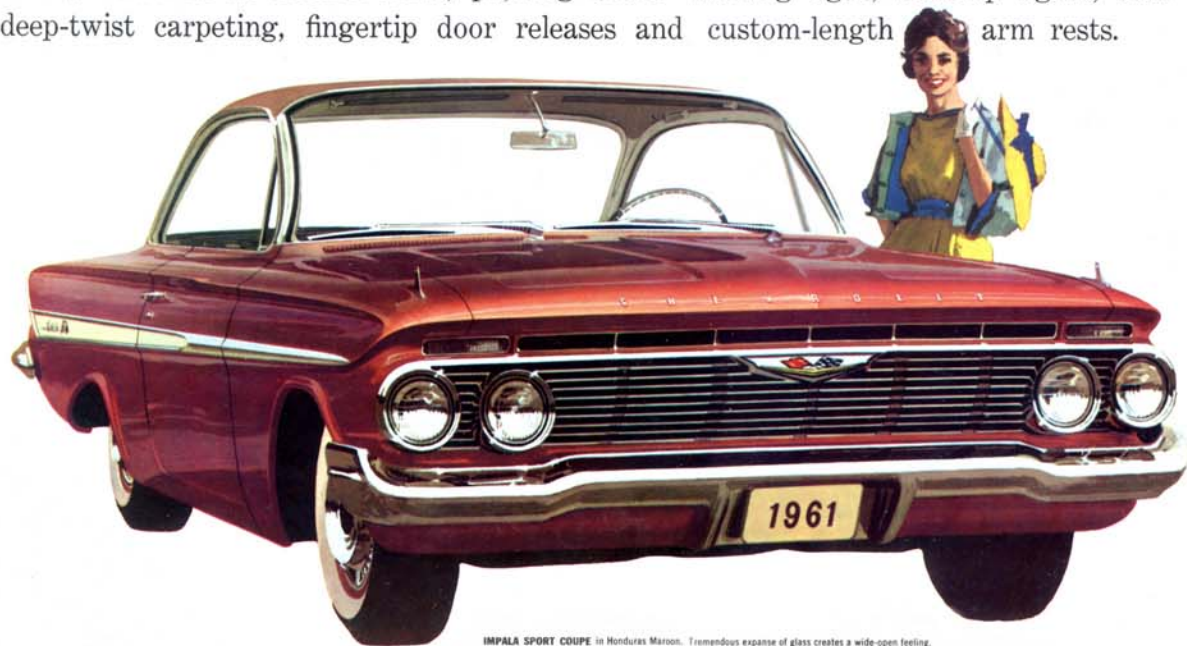
IMPALA SPORT COUPE in Honduras Maroon. Tremendous expanse of glass creates a wide-open feeling.

MOST LUXURIOUS CHEVROLET You'd be hard pressed to find a reason for wanting any more car than this! The elegant Impala is unquestionably the finest car in its field. Its new Instrument Console, a Chevy exclusive, puts every control—even the glove box—within easy reach of the driver. And Impala standard equipment also includes such luxury features as electric clock, parking brake warning light, back-up lights, rich deep-twist carpeting, fingertip door releases and custom-length arm rests.