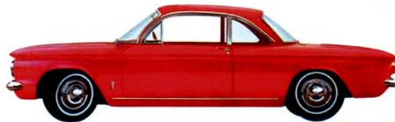
MONZA CLUB COUPE in Roman Red. Equipped with front bucket seats, luxuriously upholstered in soft leather-grain vinyl . . . custom trim, including deep-twist carpet.