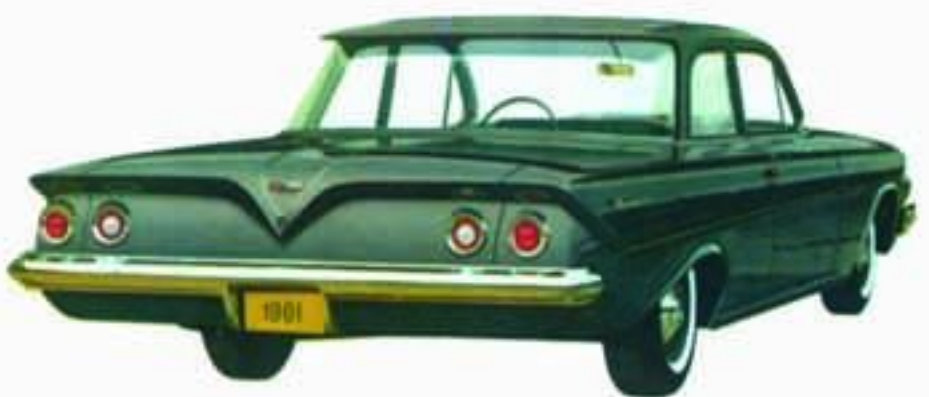
BISCAYNE UTILITY SEDAN in Tuxedo Black. Rear compartment provides 28.5 cu. ft. of carrying capacity.