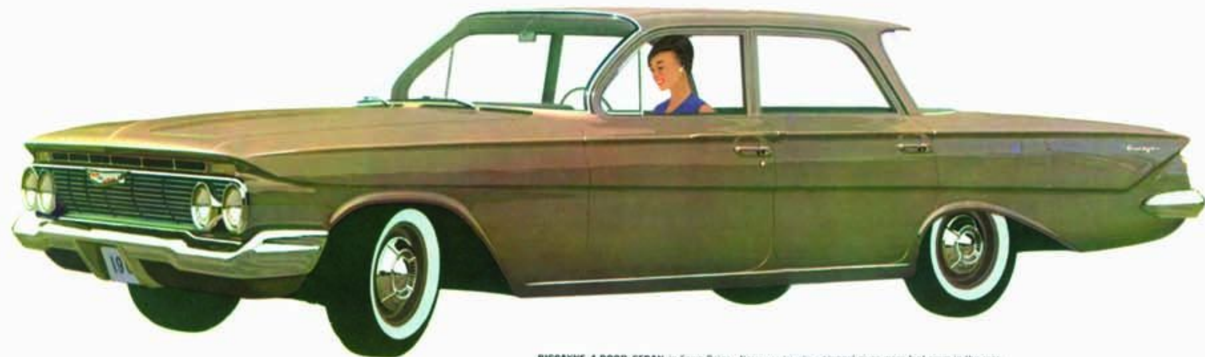
BISCAYNE 4-DOOR SEDAN in Fawn Beige. Narrower Bivelve Tunnel gives more foot room in the rear.