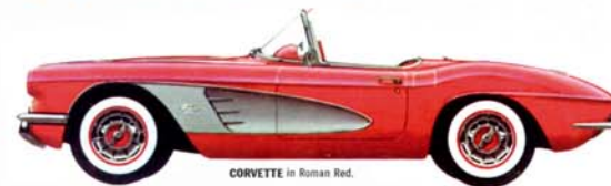
CORVETTE in Roman Red.

The famous Corvette spirit is clothed in sleek new style for 1961. Its rakish lines are an open invitation to try Corvette at its exhilarating best . . . out on the road. Corvette gives you authentic sports car performance—with precise handling, and deep-chested engines ranging from 230 h.p. up to the 315-h.p. Corvette V8 with Ramjet Fuel Injection. To team with these engines are three great transmissions: standard 3-Speed Synchro-Mesh, fully synchronized 4-Speed Synchro-Mesh* and automatic Powerglide*. Comfortable bucket seats, deep-pile carpeting, custom trim and roll-up windows—plus comfort conveniences and power assists*—offer personal car luxury. A narrower transmission tunnel gives more foot room, and an alternate seat track position makes possible more leg room for '61.