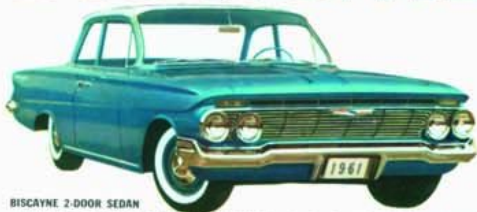
BISCAYNE 2-DOOR SEDAN in Jewel Blue and Ermine White. New, functional high-level vent ports supplement air for engine cooling.

LOWEST PRICED FULL-SIZE CHEVY. This beauty is a bargain at the price! In Chevrolet's Biscayne you enjoy the solid quality and comfort of Body by Fisher. Its rugged construction will take the bumps and jolts of the toughest everyday driving, and still stay tight and quiet. Foam cushioned front seat, dual sun visors, two arm rests, safety door locks and glove box lock are all standard equipment. These are the kind of quality features that make every Chevy more satisfying to own, worth more at trade-in time.