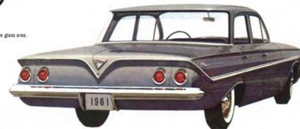
BEL AIR 4-DOOR SEDAN in Shadow Gray. Chevrolet's mammoth new trunk gives more usable luggage space . . . more easily reached.

CHEVROLET'S POPULAR PRICED MODELS Again, for 1961, the Bel Air has all it takes to make it America's most popular model. Chevy's slim new size makes it easier than ever to drive, park and garage. Its clean lines promise lasting beauty and value.