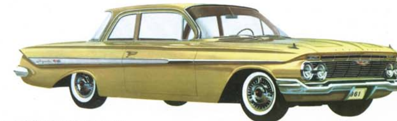
IMPALA 2-DOOR SEDAN in Coronita Cream. A newcomer to the Impala Series. Features a new canopy roof, wide new doors and slim-pillar sedan styling.