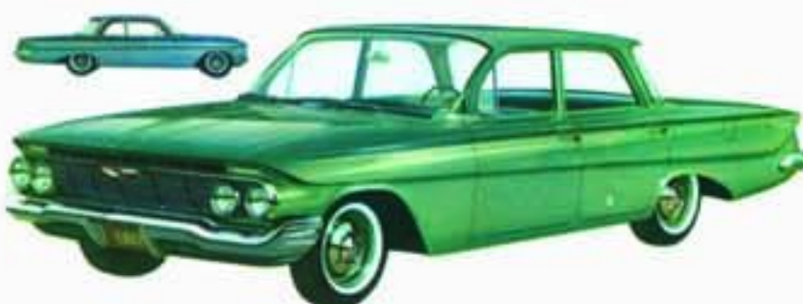
BISCAYNE FLEETMASTER 4-DOOR SEDAN in Arbor Green.