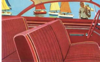
Sport Coupe and Sport Sedan models are decked out in freshly styled striped fabric. Colors include red, gray, green, blue, turquoise and fawn. Tri-color accent lines decorate the vinyl seat and door panel trim. Beneath your feet in sport models is a deep-twist carpet with rubber inserts for areas of greatest wear.