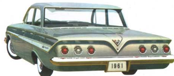
IMPALA 4-DOOR SEDAN in Sateen Silver. Beautifully sculptured rear deck . . . distinctive Impala triple taillight design.