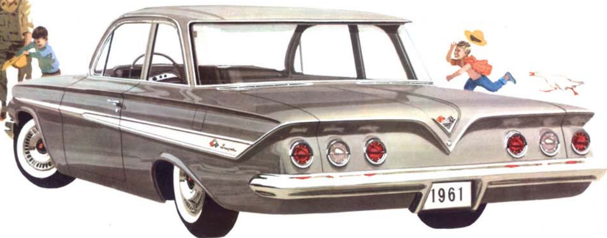
IMPALA 2-DOOR SEDAN in Fawn Beige. Richly styled, rust-free aluminum trim moldings.