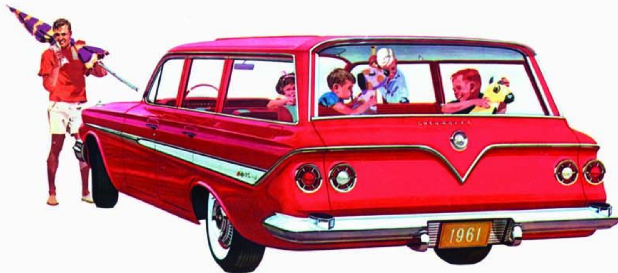
NOMAD 4-DOOR 9-PASSENGER STATION WAGON in Roman Red. Most luxurious Chevy wagon, featuring Impala trim and equipment.

Loading's easier than ever in Chevy Wagons! For 1961, the tailgate opening is wider (almost 9 inches) and higher. The loading platform is lower, and there's more usable room inside to stow the load. With tailgate down, you have nearly 10 feet of load length.