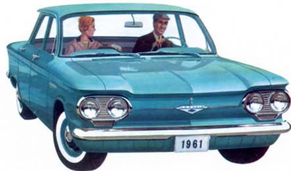
500 4-DOOR SEDAN in Seamist Turquoise. Features color-keyed interiors for 1961.