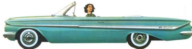
IMPALA CONVERTIBLE in Seasmist Turquoise. Top down . . . fun! Top up . . . snug and weatherlight! And tough Chevrolet top fabric lives a long life.