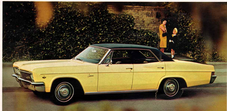
Caprice Custom Sedan in Lemonwood Yellow.