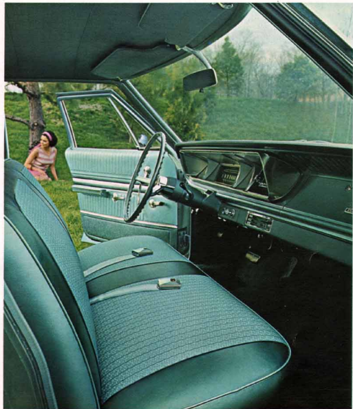
Bel Air 4-Door Sedan interior in Turquoise.

Size it up for styling and sound value Bel Air 66