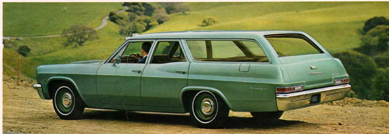
Left: Bel Air 4-Door 3-Seat Station Wagon in Mist Blue.