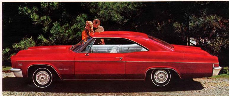
Impala Super Sport Coupe in Regal Red. Impala Sport Coupe also available.

The Impala Super Sport Coupe and Convertible are especially made for individualists who take a personal approach to car comfort and driving fun. Interiors are attired in all-vinyl and outfitted with new slim-profile tapered Strato-bucket seats in front. Between seats is a convenient center console decked out with ashtray, lighted carpet-lined compartment and courtesy light. A special Super Sport emblem is mounted on the glove compartment door. Both models have full wheel