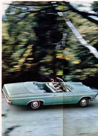
NEW TILT-TELESCOPIC steering wheel adjusts quickly and conveniently any way you please.