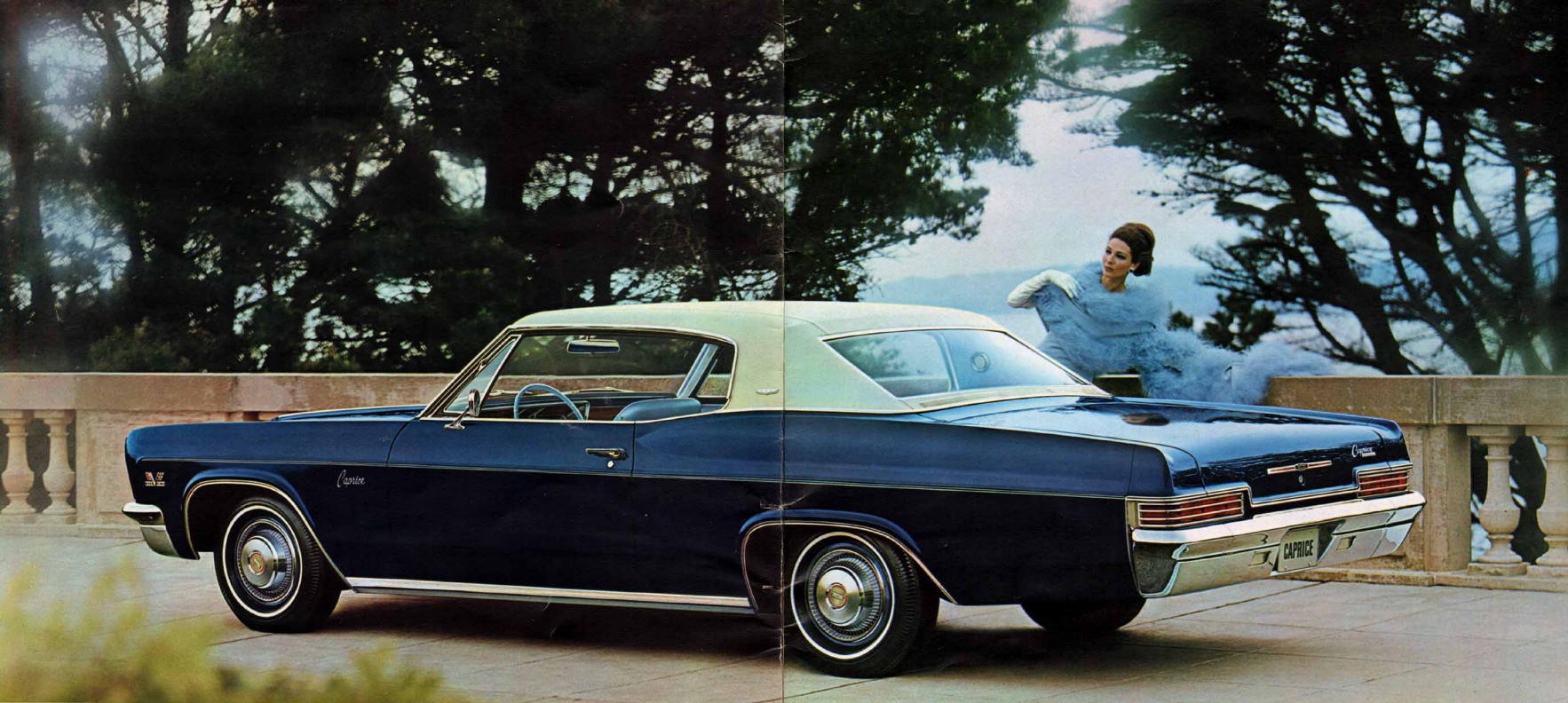
Caprice Custom Coupe in Danube Blue

Choose any Jet-smoother 1966 Chevrolet. It'll be built the Chevrolet way: comfortable, dependable and good looking . . . like the new Caprice Custom Coupe above with its one-of-a-kind roof line.