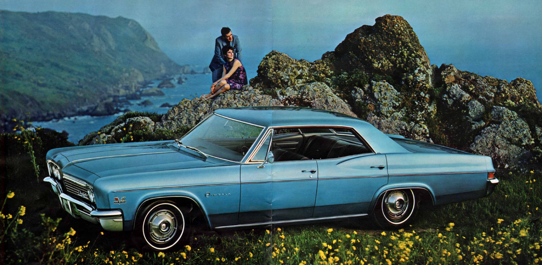
Impala Sport Sedan in Marina Blue.

Again this year, Impala affords fine-car features while sparing the high expense. Unmistakably '66 are the newly styled fenders, grille, bumpers and smart-looking wraparound taillights. Every distinctive Impala has front and rear wheel opening moldings; black-accented side and rear moldings; slender sill and hood windsplit moldings; and bright roof drip moldings.