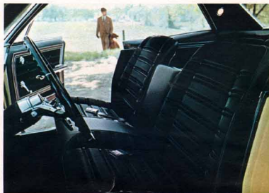
Caprice Custom Sedan interior in black with luxurious Strato-back front seat.