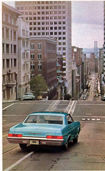
POWER BRAKES added to your new Chevrolet take much of the effort out of stopping, help make every stop an easy excursion.