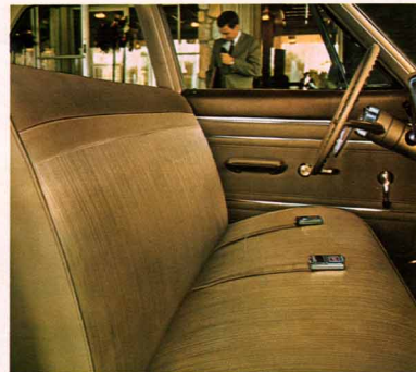
Biscayne 4-Door 2-Seat Station Wagon interior in fawn.