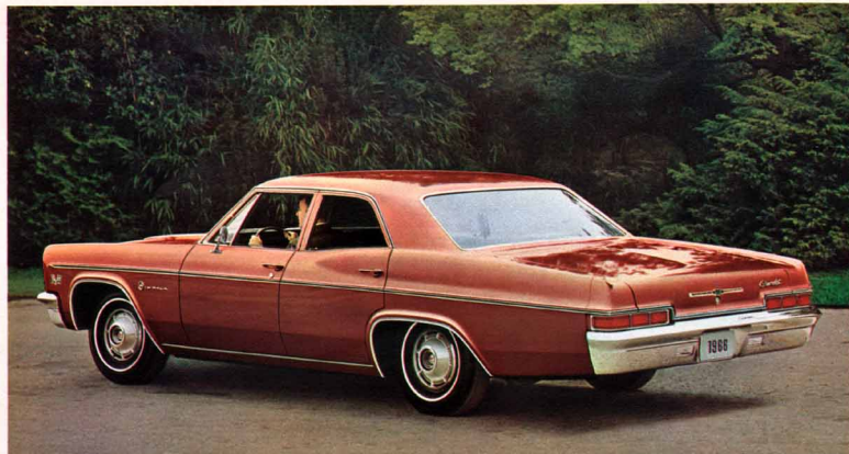
Impala 4-Door Sedan in Aztec Bronze.