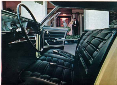
Caprice Custom Sedan interior in black.