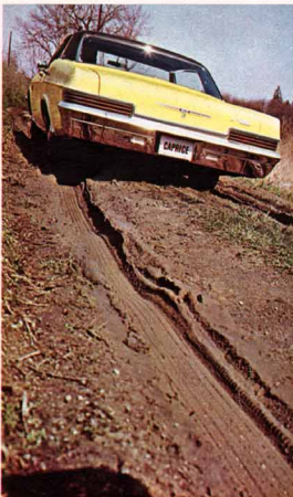
POSITRACTION rear axle beefs up your traction and your confidence when driving on ice, snow or sand.