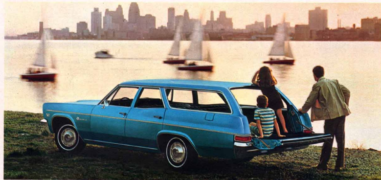
Impala 4-Door 3-Seat Station Wagon in Marina Blue.