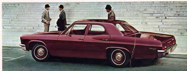
Biscayne 4-Door Sedan in Maroon.