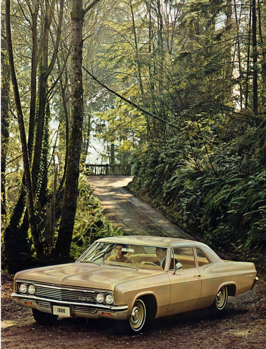
Right: Biscayne 2-Door Sedan in Camo Beige.