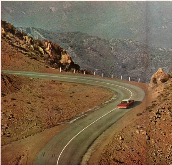
FOUR-SEASON air conditioning changes the weather to your liking so you drive and arrive fresh and pressed, cool and calm.

order air conditioning, power brakes, power steering, Positraction, tilt-telescopic steering wheel and radios (including stereo). These are only a few of the ways to make your '66 Chevrolet just right with Chevrolet's extra-cost Options and Custom Features. See Page 23 for more items.