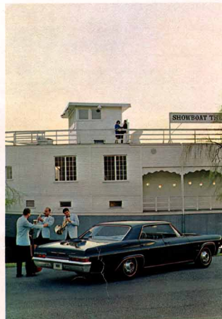
ALL-TRANSISTOR RADIOS are acoustically tailored to Chevrolet interiors and bring you beautiful sounds for '66.