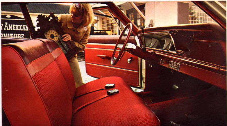
Biscayne 2-Door Sedan interior in red.

Biscayne's three budgeteers give buyers plenty to go for . . . without going out on a limb in price. Outside, bold new styling of fenders, bumpers and grille; distinctive ornamentation and nameplates. Inside, new instrument panel cluster and ornamentation, new steering wheel and handsome new pattern cloth and vinyl trim (all-vinyl for station wagon). Roomy passenger compartment has foam-cushioned front seat, color-keyed deep-twist carpeting, padded instrument panel and sun visors, seat belts and