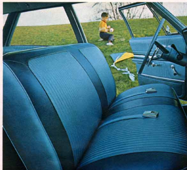
Bel Air 4-Door 2-Seat Station Wagon interior in blue.