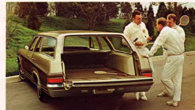
Caprice 4-Door 3-Seat Custom Wagon showing wide-opening, easy-closing counterbalanced tailgate.

Two new models distinguished by rich walnut-look paneling