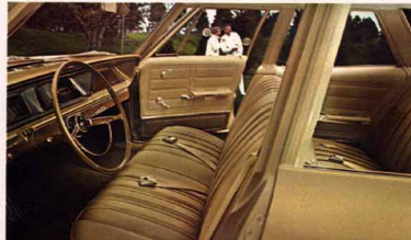
Caprice wagons' all-vinyl upholstery and deep-twist carpeting in fawn.