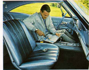
Sporty spirit characterizes this Impala Super Sport interior in blue with luxurious center console and new all-vinyl Strato-bucket seats.

Slip inside the new Impala and discover its pleasant surroundings. You can choose from up to six color schemes, depending on model: fawn, turquoise, red, blue, green and black. As for upholstery, Impala Sport Coupe, Sport Sedan and 4-Door Sedan are fashioned in new tufted textured pattern cloth with deeply padded vinyl bolsters. The convertible and station wagons are similarly styled in all-vinyl. A special all-vinyl black interior can be ordered for the sport coupe and sport sedan.