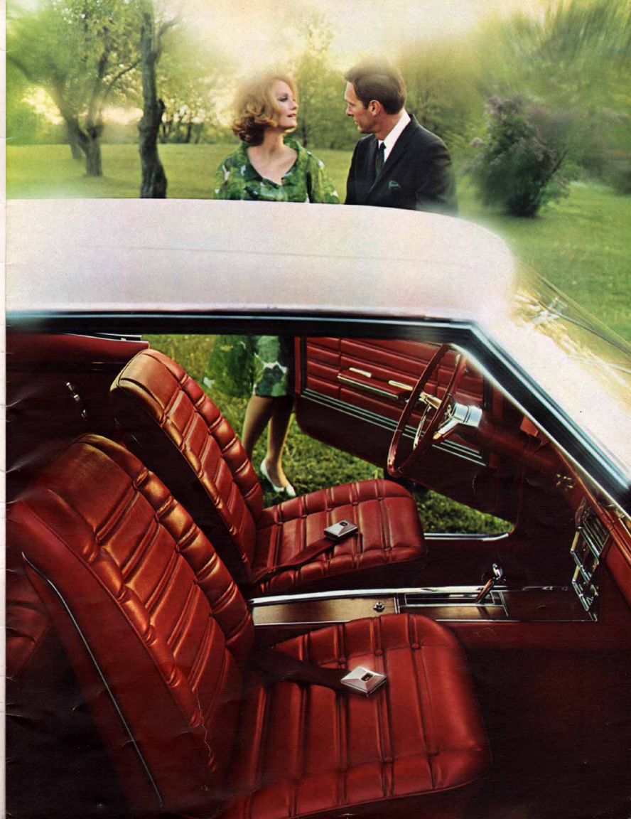
Right: Caprice Custom Coupe interior in red featuring elegant Strato-bucket seats, center console, special instruments and padded lower instrument panel.