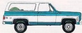
Special Two-Tone Exterior

Chrome bumpers front and rear. Bright upper and lower body side and rear moldings. Bright hubcaps. Many other bright accents. Cheyenne nameplate.