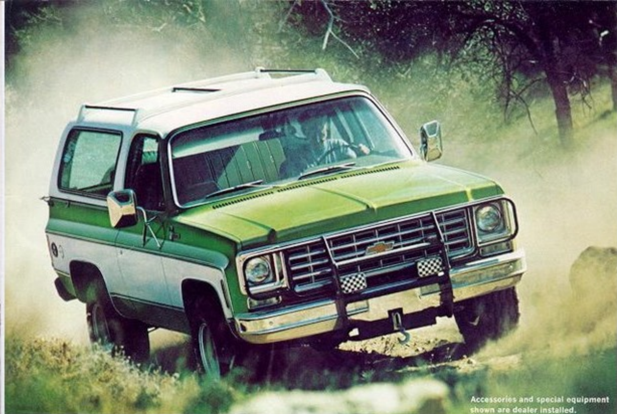
Accessories and special equipment shown are dealer installed.