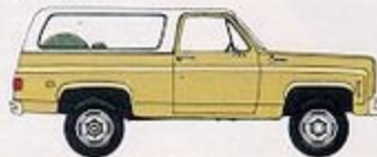
Custom Deluxe Exterior