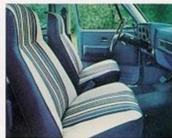
Standard Sierra front seats.

Available Sierra Rear Bench Seat provides seating for 3 passengers with legroom in footwell in floor behind the front seat. The seat, upholstered to match front seats, is removable or it can be folded against the front seats to permit 89.6 cu. ft. of flat cargo space. Available with Sierra (shown at upper right) and Sierra Classic trim.