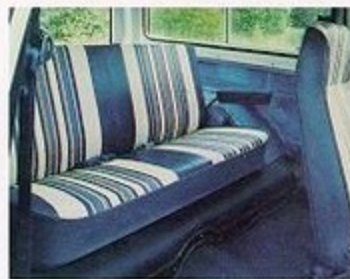
Available Sierra rear seat.

Standard Sierra Interior. Includes driver and front passenger high-back bucket seats in standard striped vinyl or available custom vinyl in Blue or new Doeskin color. A new-style center console and color-keyed front floor carpeting are included with custom vinyl seat trim option. Also standard: color-keyed new-style; padded instrument panel pad; bright-trimmed, Black crackle-finish instrument cluster faceplate; Black crackle-finish pad applique; bright Sierra nameplate; door trim panels; and sun visors. Standard floor mats are Black rubber. Front and rear compartments have matching floor covering (shown at upper right) when available rear seat is specified.