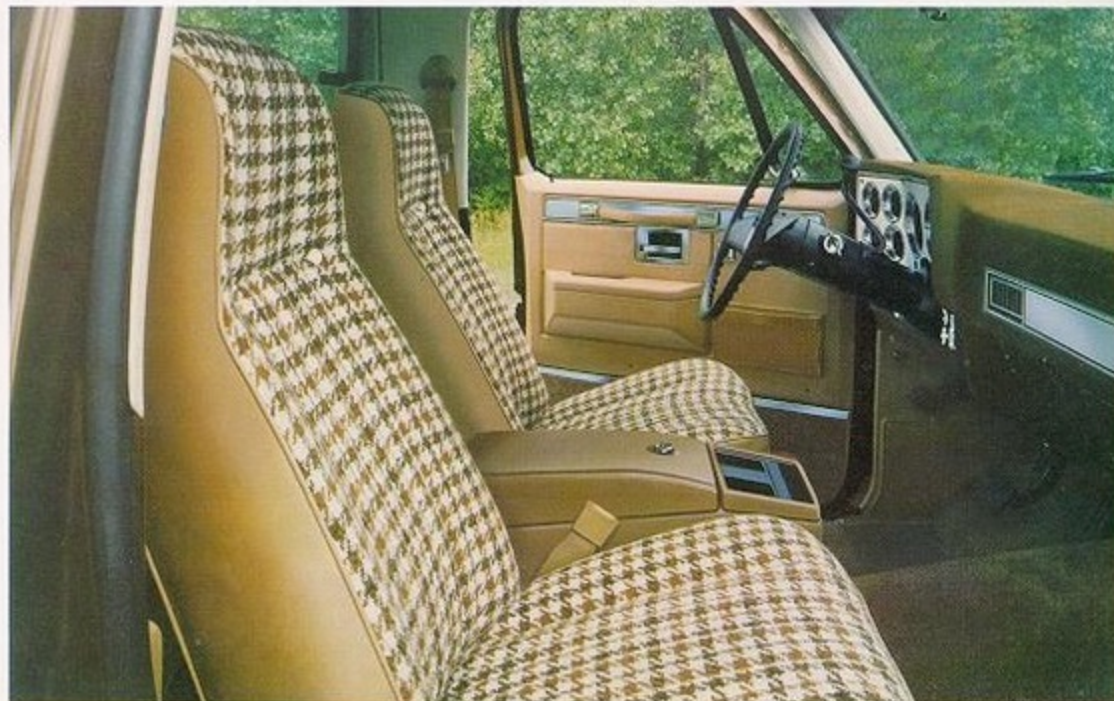
Available Sierra Classic interior.

Use Jimmy Year Around! Ask your GMC Truck dealer about new Trailing Special equipment and power take-off in available 4-speed transmission to operate snowplows and other specialized equipment.