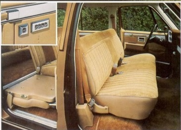
Sierra Classic interior with available new custom velour cloth upholstery and available seating.

GMC CONTINUOUS PROTECTION PLAN This option offers service protection in addition to that provided by GM's new vehicle limited warranty. Ask your dealer about it. (Available in the USA and Canada during the 1981 model year.)