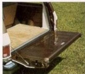
Available wagon-styled tailgate has manually operated glass. Power drop window is available.

Flow-through power ventilation is activated by switch on the standard heater. Outside air is blower-circulated through interior, exiting through door vents when the windows are closed. Uses heater blower. With available air conditioning, the driver has control of interior temperature in winter and summer.