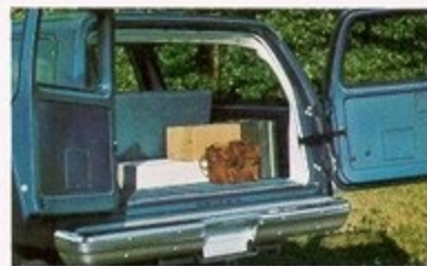
Standard panel-type dual rear doors have fixed glass, outside key lock.