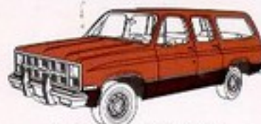
Available Special Two-Tone