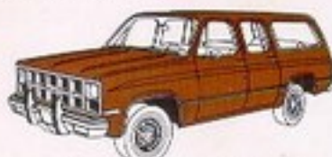
Standard Solid Color Scheme