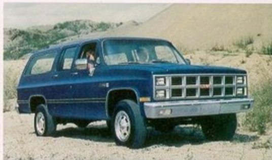
GMC 4-WD Suburban for off-road travel.

For off-road fun, consider the available new Front Quad Shock Package consisting of dual right and left 25-mm front shock absorbers and 32-mm rear shock absorbers. The package also includes a front axle pinion nose bumper mounted on the right frame side member to limit front axle windup.