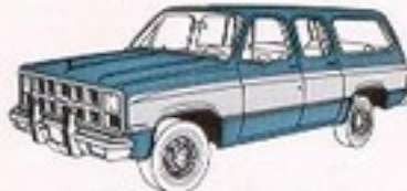
Available Exterior Decor Package