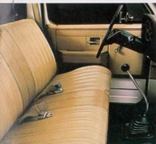
Custom Deluxe interior shown in Medium Almond