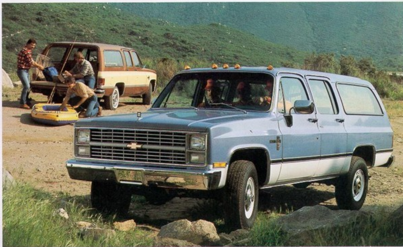
K20 Suburban Silverado Diesel shown in Light Blue Metallic and Frost White