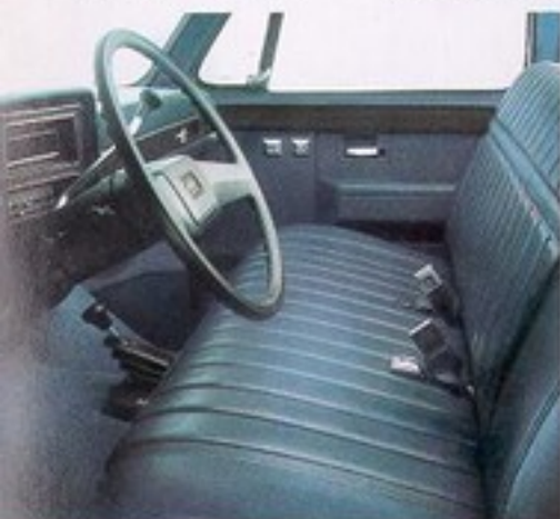
Scottsdale interior shown in Blue