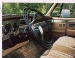
Comfortilt steering wheel

*Gross Combination Weight Rating with selected engine and rear axle ratios. Refer to the 1986 GMC Trailing Guide for further information.