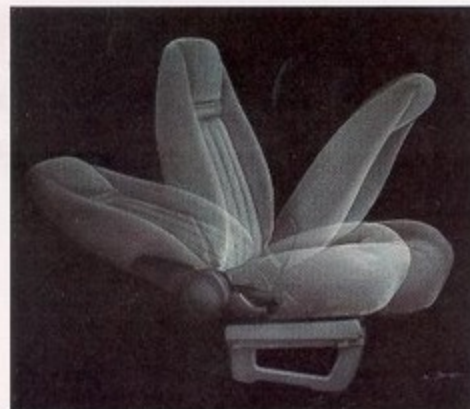
Sierra Classic interior features new-style bucket seats with reclining seat backs. Shown with custom velour cloth trim.

For '86 back-seat passengers will enjoy more footroom thanks to new-design front bucket seats. The new seats, in cloth or vinyl, have folding backrests; recliner is included in Sierra Classic applications. The passenger seat slides forward to make entering the rear compartment much easier than in most competitive sport utility trucks.