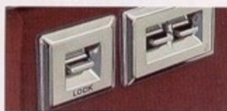
Power windows and power door locks