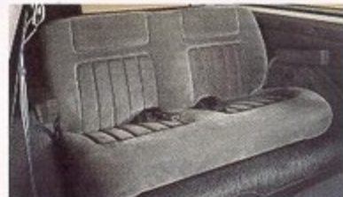
Sierra Classic interior with available 3-passenger folding rear bench seat and custom velour cloth seat trim

Sierra Classic exterior has dual headlamps and bright-trimmed grille. Bright moldings embellish the body sides and rear, windshield, wheel opening, side quarter windows, front side marker lamps, and taillamps. K-Jimmy and Sierra Classic ... impressive performance ... distinctive appearance!