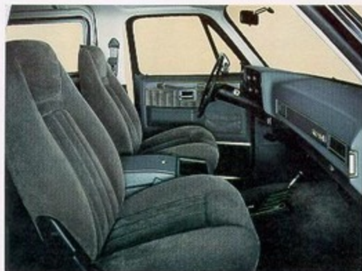
Sierra Classic interior with new-style bucket seats upholstered in custom velour cloth