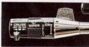
Electronic automatic speed control and intermittent windshield wipers (controls on multifunction switch)