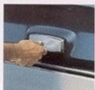
Electric tailgate window control