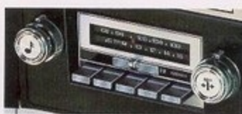
Delco radios including an AM/FM stereo electronic-tuned radio with seek/scan feature, cassette tape, and clock