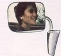
Below-eyeline stainless steel mirrors