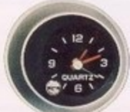
Quartz electric clock