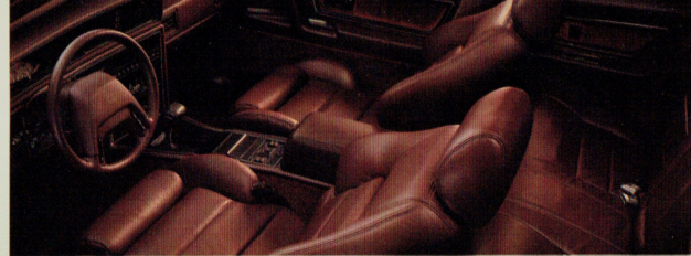
1987 Lincoln Mark VII LSC in Cabernet Clearcoat Metallic with Cabernet leather interior. Some features shown may be optional. See your Lincoln-Mercury dealer for details.

For driving pleasure and performance, 1987 Lincoln Mark VII.