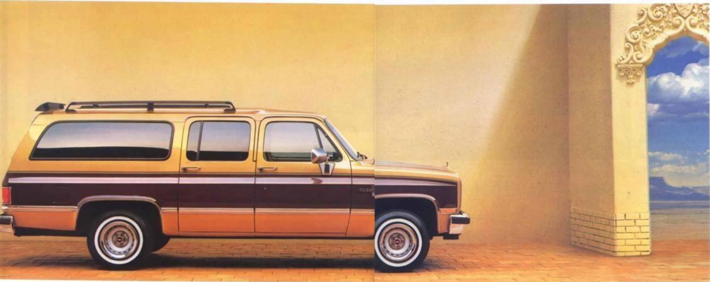
2WD 10 Series Suburban with optional Silverado trim and optional Exterior Decor Package in Yukon Gold Metallic and Woodlands Brown Metallic.

■ Suburban's quietness in motion is enhanced by padded interior trim, extra sound-deadening insulation beneath floor mats, under front seats, in the dash panel and on back of headliner.