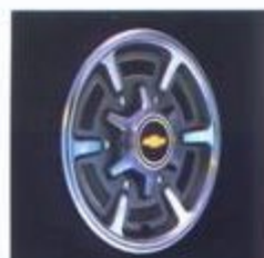
Optional wheel covers (10 Series only).