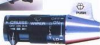
Optional electronic speed control with Resume and Accelerate features.