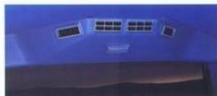
Optional rear air conditioning.