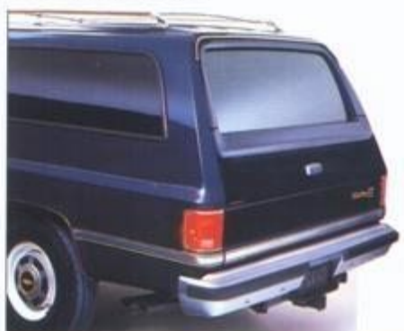
Optional bumper guards and Deluxe Front Appearance Package.

Suburban with optional trailer hitch platform, bumper rub strips, electrically operated rear window, rear window defogger, deep-tinted side glass and dealer-installed luggage rack.