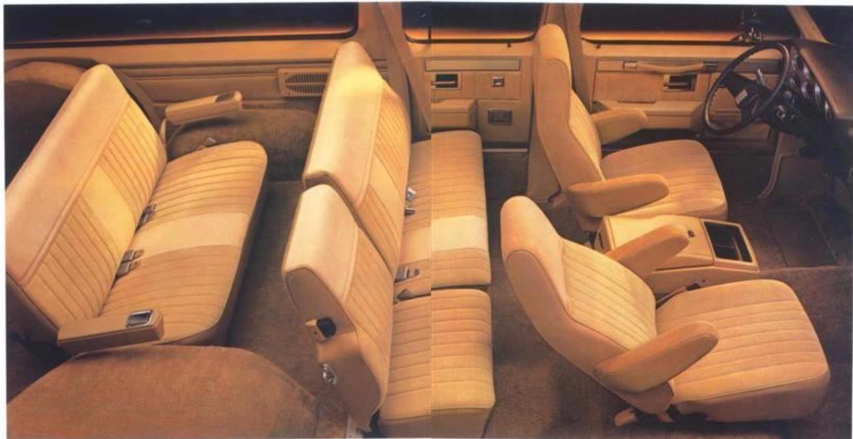
Suburban interior in Saddle with optional Silverado trim.