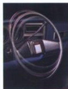
Optional Comfortilt steering wheel.