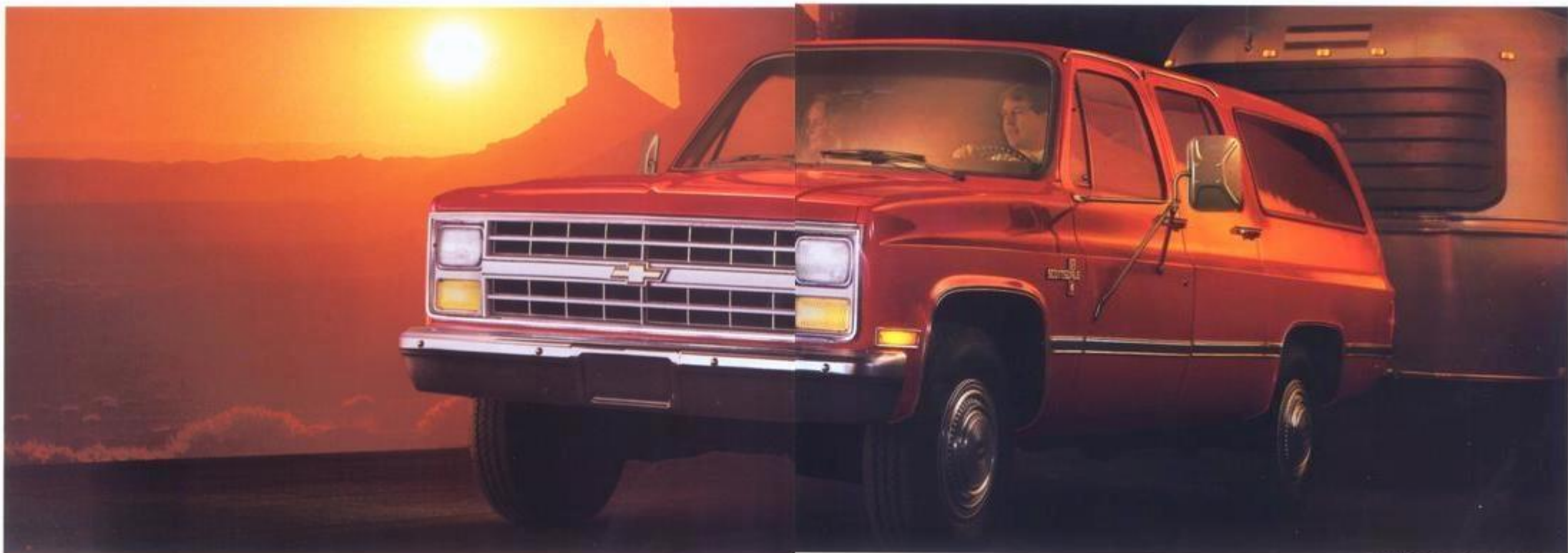
2WD 20 Series Suburban in Apple Red.

Some years ago, the Chevy Suburban picked up the nickname "Superwagon," and the name has stuck. That's quite understandable, since the Suburban is really a rugged truck that passes for a wagon—thanks to its exterior styling, interior comforts, smooth ride and carlike garageability.