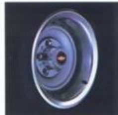
Optional Rally Wheels (included on Silverado), 10 Series only.