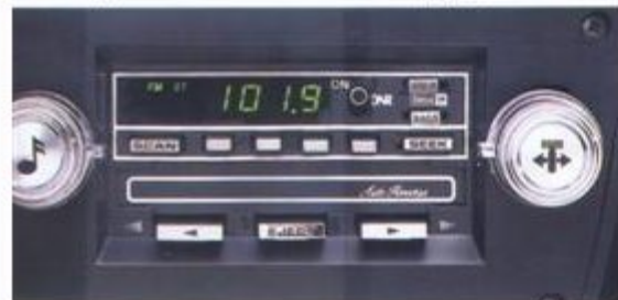
Optional Delco AM/FM stereo ETR™ radio with Seek and Scan and cassette tape player.