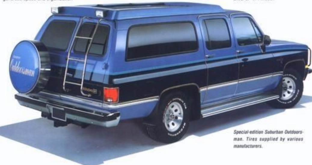
Special-edition Suburban Outdoorsman. Tires supplied by various manufacturers.

See your Chevy truck dealer for full details on the hunting or fishing version of the Outdoorsman Suburban, available as either a 2WD or 4x4 model.