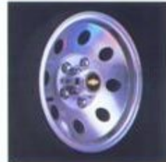
Optional aluminum wheels. (10 Series only).