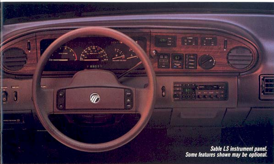
Sable LS instrument panel. Some features shown may be optional.

The need for a versatile wagon used to mean settling for box-like styling. Not any more. Sable is one of the most aerodynamic wagons available today. Inside its 60/40 split rear seat allows you to fold all or just part of it down to increase cargo capacity. Mechanically Sable wagon enjoys the same benefits as Sable sedan with V-6 power, fully independent suspension, front-wheel drive and a 4-speed automatic overdrive transmission.