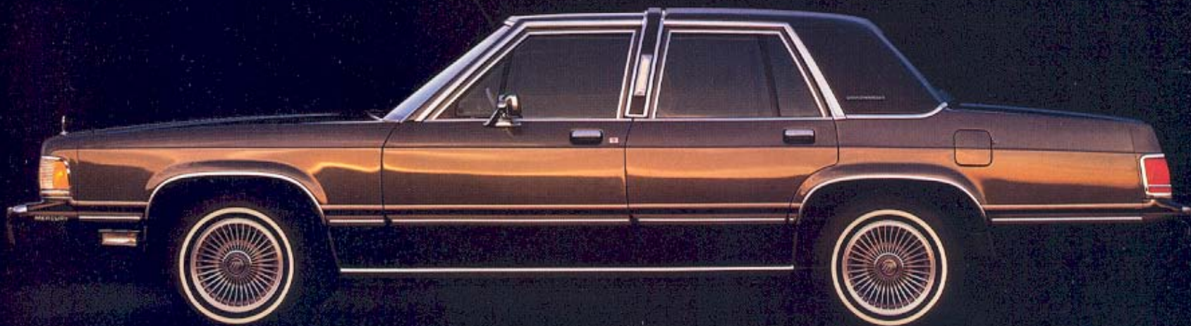
Grand Marquis LS Tu-Tone with Smoke Metallic upper body and Black lower. Some features shown may be optional.

IF FINDING EXTRAORDINARY ROOM AND COMFORT IS A PROBLEM,