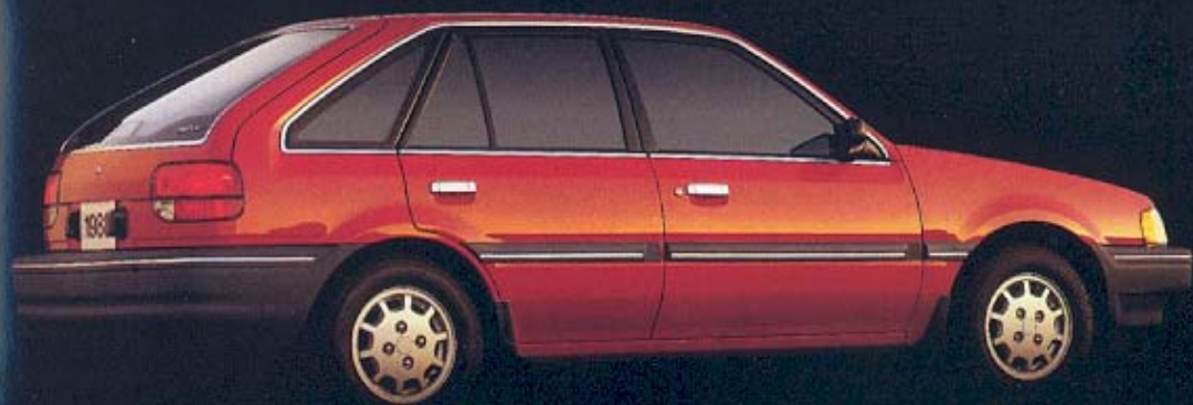
Tracer four-door hatchback in Light Canyon Red. Some features shown may be optional.

Some small cars don't seem to put much effort into the comfort of their occupants. In contrast, Mercury offers Tracer. It's so well equipped it comes with 68 standard features and only seven options. You can have Tracer in two- or four-door hatchback or a roomy four-door wagon. All the ingredients for fun driving are there, too, with an overhead cam engine, a 5-speed manual transmission, fully independent suspension and front-wheel drive.