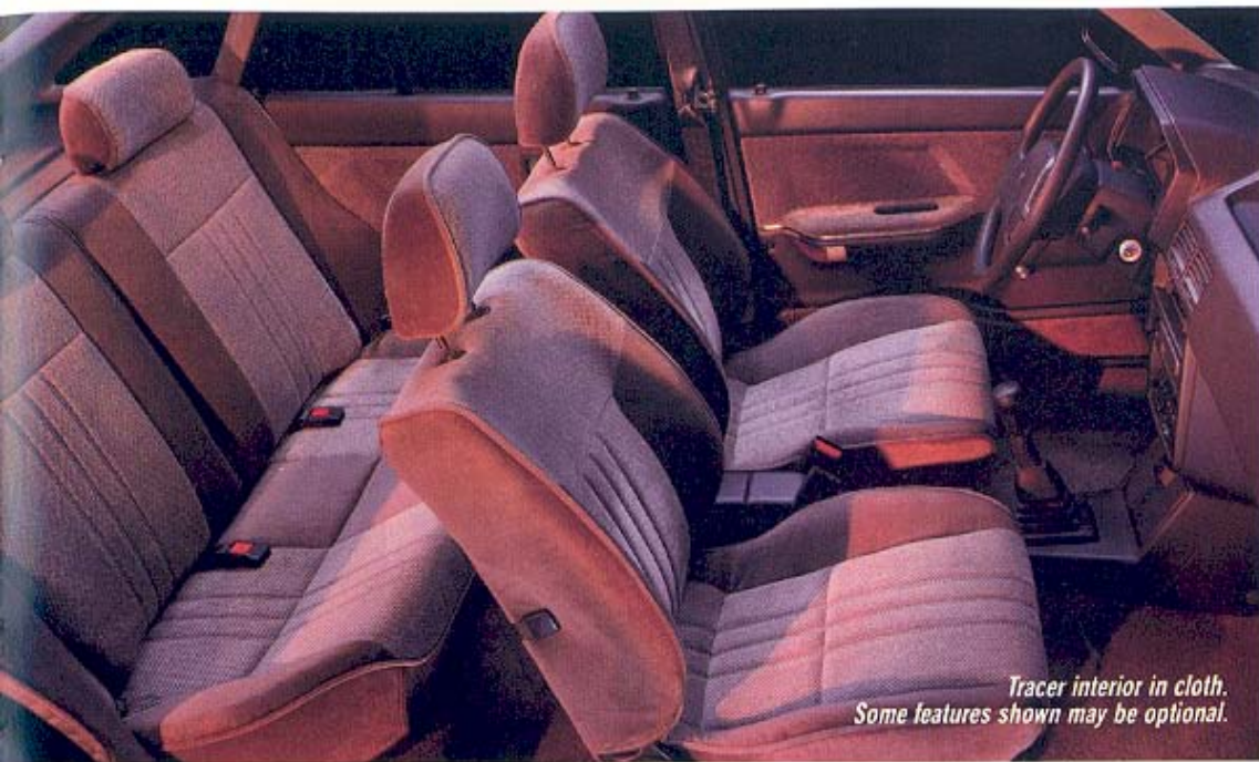
Tracer interior in cloth. Some features shown may be optional.

Being cute isn't enough when you're looking for a versatile little car. So Tracer offers an array of useful features. Like its 50/50 split fold-down rear seatback, and a concealed storage tray under the front passenger seat. Other standard features include electronic AM/FM stereo radio with four speakers, reclining front bucket seats, manual adjustments for height and lumbar support on the driver's seat, and dual power mirrors.