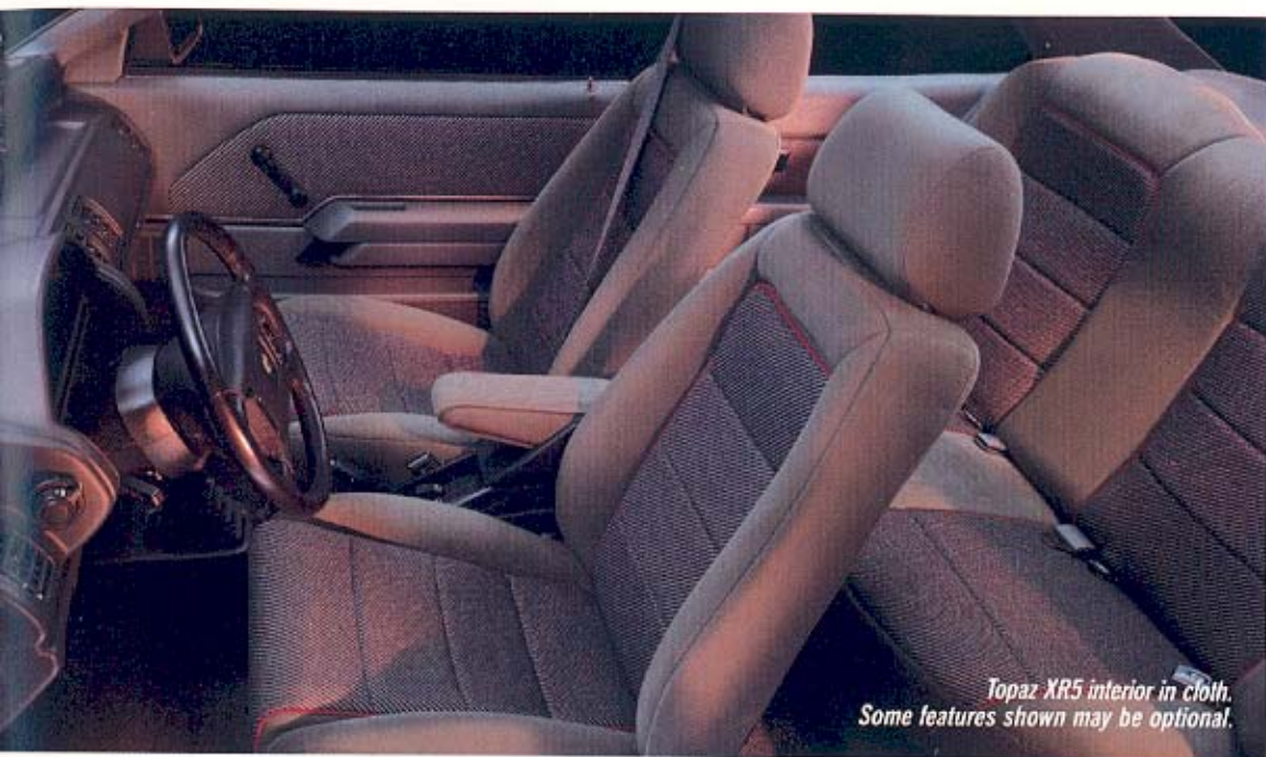
Topaz XR5 interior in cloth. Some features shown may be optional.

XR5 has the most powerful engine in the Topaz line—the 2.3-liter HSO with multi-port electronic fuel injection. XR5's performance is evident in its fully independent suspension with nitrogen gas-pressurized struts and a front stabilizer bar. A 5-speed manual transmission and performance steel-belted radial tires on cast-aluminum wheels are also standard, as well as analog gauges and sport bucket seats.