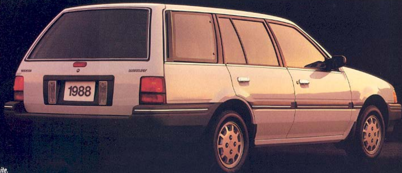
Tracer wagon in Oxford White. Some features shown may be optional.

THIS IS A SMALL, VERSATILE SHAPE THAT DOESN'T WASTE SPACE.