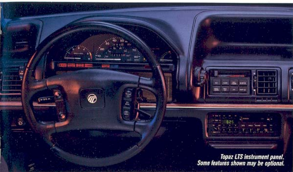
Topaz LTS instrument panel. Some features shown may be optional.

Topaz LTS shown here has an attractive new aerodynamic shape. Inside there's an all-new instrument panel with analog instrumentation that provides information in an easy-to-read fashion and places all vital controls within easy reach. And when the going gets tough, you'll appreciate the Topaz all-wheel drive option.* It provides extra traction with a simple flick of a switch. It's available on all Topaz models.