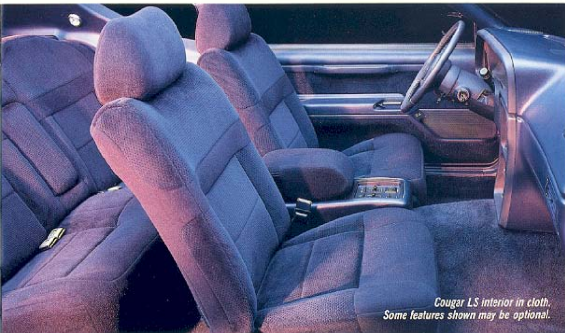
Cougar LS interior in cloth. Some features shown may be optional.

Cougar LS. Sophisticated style and personal luxury are obvious in its standard features, including plush seating with individual fold-down armrests front and rear, air conditioning and an electronic AM/FM stereo radio with four speakers. Its new standard 3.8-liter V-6 balance shaft engine is mated to a 4-speed automatic overdrive transmission, creating a certain luxury even in the way Cougar LS moves.