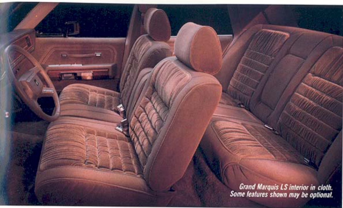
Grand Marquis LS interior in cloth. Some features shown may be optional.

In the search for extraordinary room and comfort, Grand Marquis has few equals. Grand Marquis sedan has more interior room than 99 percent of today's automobiles, and the Colony Park has the most interior space of any American-built wagon.* Grand Marquis has a lengthy list of standard features, including plush seating, air conditioning, a powerful 5.0-liter V-8 and a 4-speed automatic overdrive transmission.