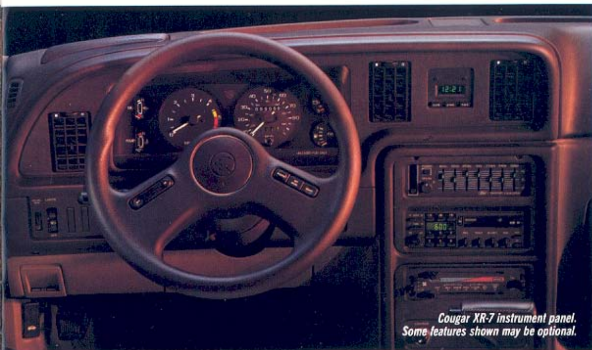
Cougar XR-7 instrument panel. Some features shown may be optional.

Cougar XR-7 is the kind of car that commands attention. Its distinctive shape uses modern aerodynamics to help it handle the road. XR-7's performance capabilities spring from its 5.0-liter V-8, equipped with advanced multi-port electronic fuel injection. XR-7 is even more distinct this year with its striking monochromatic color scheme, available in Black, Medium Scarlet or Oxford White.