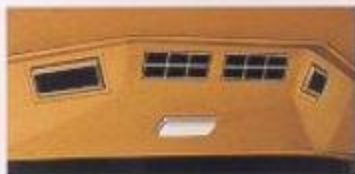
Front/rear air conditioning is available (rear shown)