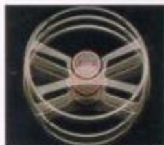
Tilt steering wheel together with an electronic speed control are available as a convenience package