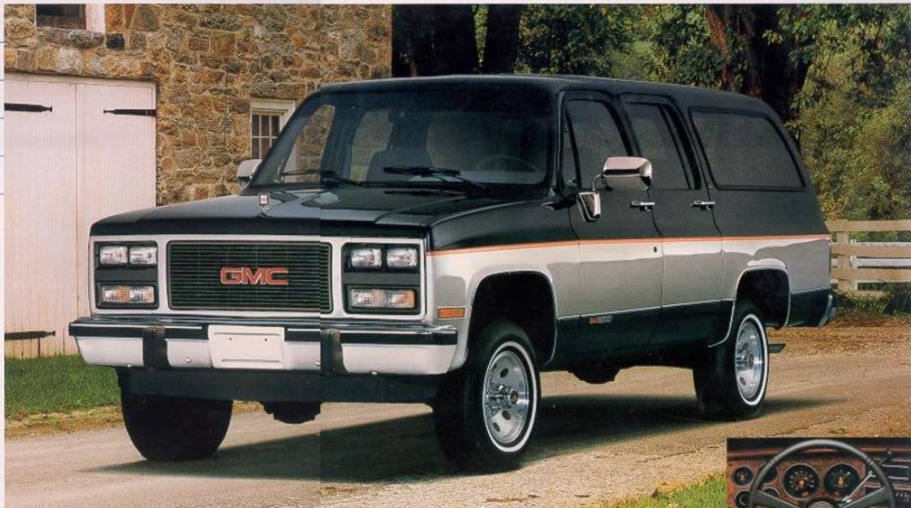
4x4 SLE Suburban shown with available equipment, including deluxe two-tone paint

THE ENDURINGLY POPULAR TRUCK-SIZE WAGON. Suburban continues to be the one wagon you can count on for genuine full-size space, comfort, strength and power. Equipped with available center and rear seating, it can carry up to nine persons. Or haul up to 167 cu ft of cargo with no rear seat (or available rear seat removed) and center seat folded. Plus, Suburban can move gross trailer weights (weight of trailer, cargo and equipment) up to 9500 lb., depending on model and equipment. Choose from 4x2 or 4x4 versions with big V8 gasoline or diesel power (diesel engine not available in California on 1500 Series models). A 4-speed automatic transmission with overdrive is standard. Rear wheel anti-lock brakes also are standard; on 4x4 models, the anti-lock brakes operate only in the 2-WD mode.