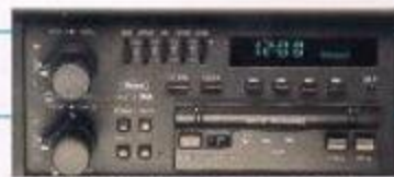
Full-feature AM stereo/FM stereo Delco radio is available for SLE models