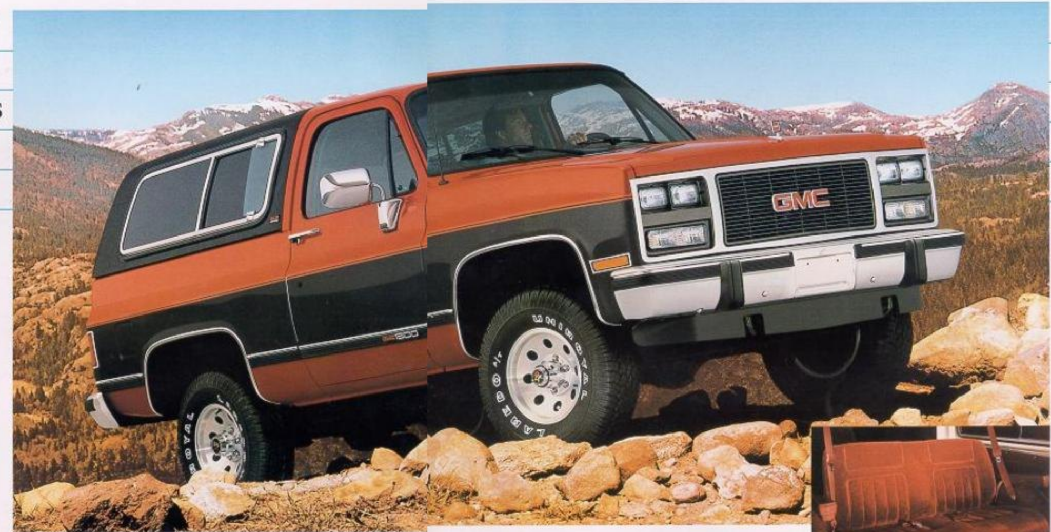
SLE V-Jimmy shown with available equipment, including deluxe two-tone paint

ground-gripping traction for any driving situation. And big V8 power packs plenty of hill-climbing, dune-busting torque for operating off the road. Specify either the standard 4-speed manual or available 4-speed automatic overdrive transmission. The standard rear wheel anti-lock brake system helps provide straight, smooth, stable stops on slick or dry pavement (system operates only in the 2-WD model). Inside, V-Jimmy is roomy enough to carry up to five passengers when equipped with the available folding rear bench seat. Or haul up to