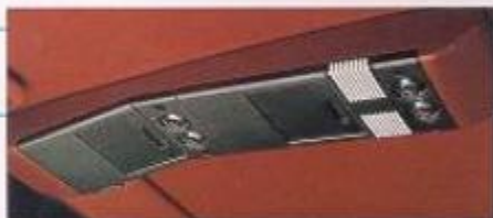
Roof console is included on SLE Suburban with available reclining front bucket seats