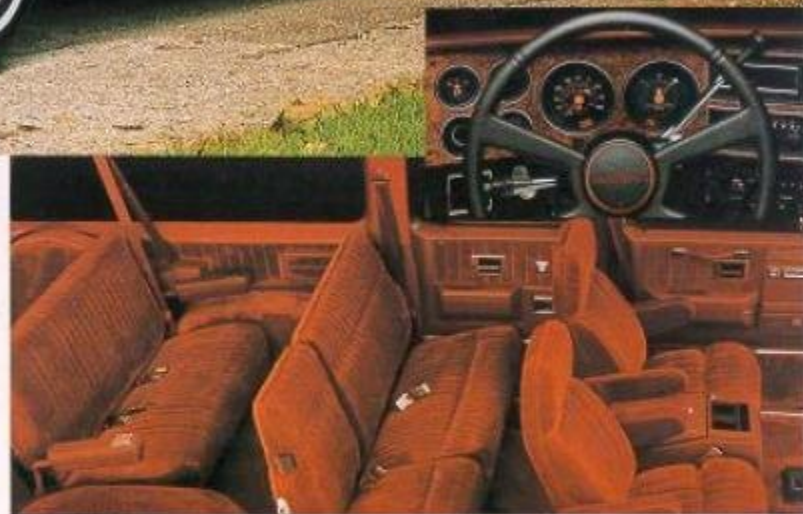
Top: SLE instrument cluster with standard gauges and simulated woodgrain applique. Bottom: SLE interior with available seating, including reclining high-back front bucket seats.