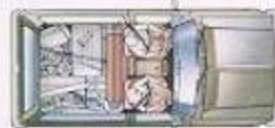
With available folding rear bench seat folded, there's a maximum of 106.2 cu ft of cargo volume