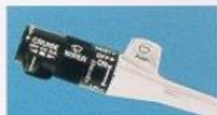
Electronic speed control is available together with the tilt steering wheel shown above

BLAZE A TRAIL TO ALMOST ANYWHERE. If going to far-out places is your kind of fun, the full-size V-Jimmy is your kind of truck. Standard 4-wheel drive gives you