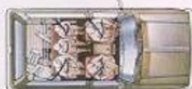
Available 5-person seating allows 51.3 cu ft of cargo volume behind the folding rear bench seat in the unfolded position

SLX. This attractive package comes with Custom Vinyl high-back front bucket seats in a choice of Dark Blue or Saddle colors. Standard equipment includes gage-type instrument cluster, tinted glass and headlamp-on warning buzzer. See page 6 for further details of SLX and SLE interior/ exterior features.