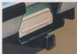
Trailer hitch platform is included as part of the available trailering equipment package

THE ENDURINGLY POPULAR TRUCK-SIZE WAGON. Suburban continues to be the one wagon you can count on for genuine full-size space, comfort, strength and power. Equipped with available center and rear seating, it can carry up to nine persons. Or haul up to 167 cu ft of cargo with no rear seat (or available rear seat removed) and center seat folded. Plus, Suburban can move gross trailer weights (weight of trailer, cargo and equipment) up to 9500 lb., depending on model and equipment. Choose from 4x2 or 4x4 versions with big V8 gasoline or diesel power (diesel engine not available in California on 1500 Series models). A 4-speed automatic transmission with overdrive is standard. Rear wheel anti-lock brakes also are standard; on 4x4 models, the anti-lock brakes operate only in the 2-WD mode.