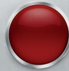
CURRENT RED (S, EX)

YOU'RE A SPARKLING CONVERSATIONALIST AND NEVER FORGET YOUR COOLER ON A HOT DAY.