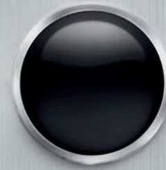
AURORA BLACK (LX, S)

YOU ARE DRAWN TO THE WATER AND YOUR SOUL RUNS DEEP. DOLPHINS GRAVITATE TOWARD YOU.