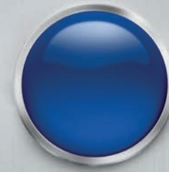
DEEP-SEA BLUE (S, EX)

YOU ARE CALM BEFORE, DURING, AND AFTER THE STORM AND EXCEL AT PLAYING HIDE-AND-SEEK.