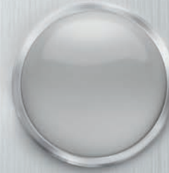
SILKY SILVER (LX, S, EX)

YOU LIKE LISTENING TO THE BLUES AROUND A CAMPFIRE AT TWILIGHT. CURRENT MOOD: MELLOW.