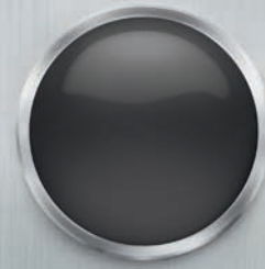
PHANTOM GRAY (EX)

YOU SEEK ADVENTURE AND ARE THE LIFE OF THE PARTY. NO CHILI PEPPER IS OFF LIMITS TO YOU.