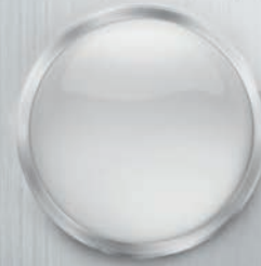
CLEAR WHITE (LX, S, EX)

Actual colors may vary from printed brochure. See kia.com/rio for interior combinations. RIO EX SHOWN