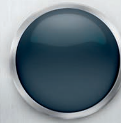
SMOKE BLUE (EX)

YOU ARE OPEN TO EXPLORING ENDLESS POSSIBILITIES. YOUR GLASS IS ALWAYS HALF-FULL.