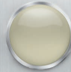
ICE WINE (S)

YOU NOTICE THE SUBTLE IRONIES IN LIFE. NOTHING IS EVER BLACK AND WHITE TO YOU.