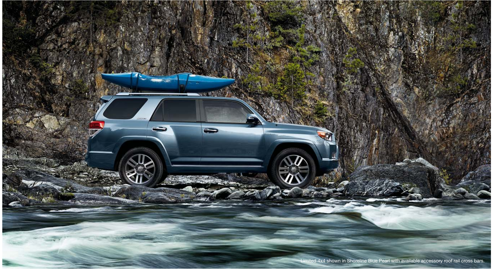
1. EPA-estimated mileage for 4Runner V6 4x2 models. Actual mileage will vary.

It's a power trip. Its V6 engine uses Dual Independent Variable Valve Timing with intelligence (VVT-i) to give you 270 hp, 278 lb.-ft. of torque and an EPA-estimated 23 highway mpg rating! Put the power down and 4Runner's lineage to a tradition of tough, rugged, body-on-frame SUV engineering is obvious. On Limited, precise handling and a smooth ride are delivered using X-REAS, a sport suspension that automatically balances gas/hydraulic pressure between cross-linked shocks to further reduce body sway and pitch. From Limited's 20-inch split 6-spoke alloy wheels on up, it's a lean and mean sport utility that never feels utilitarian.