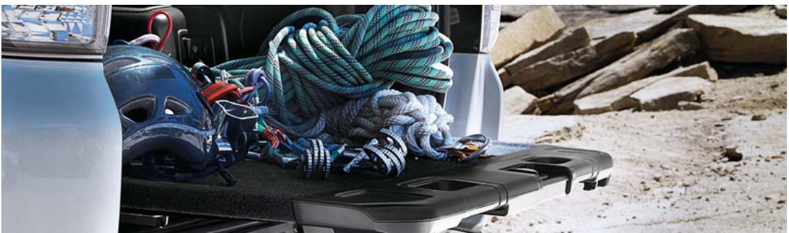
1. See footnote 25 in Disclaimers section. 2. See footnote 5 in Disclaimers section.

LONGEVITY FACT: 4Runner is a true SUV, built using body-on-frame construction. The frame is fully boxed, and it's been reinforced at key stress points. So the rigors of towing up to 5000 lb? won't faze 4Runner. Or its driver.