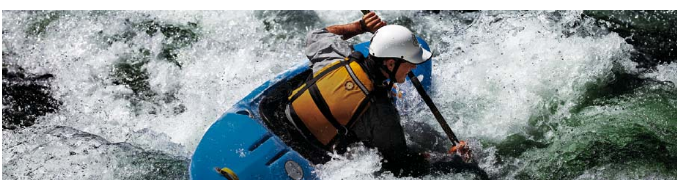
1. See footnote 14 in Disclaimers section. 2. See footnote 8 in Disclaimers section. 3. See footnote 9 in Disclaimers section. 4. See footnote 11 in Disclaimers section.

With Limited's dual zone automatic climate control, the driver can set one temperature setting while the front passenger can select a separate setting. Rear ventilation and an air filtration system add to the high level of interior comfort.