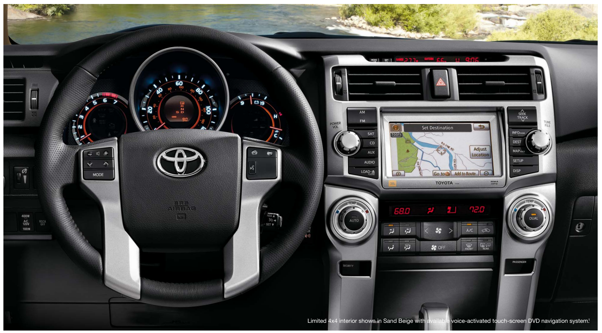
1. See footnote 11 in Disclaimers section. 2. See footnote 10 in Disclaimers section. 3. See footnote 12 in Disclaimers section.

In a word, commanding. As the driver, you sit up high in the spacious cabin, your right foot firmly in charge of 4Runner's rugged capability, with the thick-rimmed steering wheel in your grip and large, easily legible dials in your gaze. You're surrounded by available technologies like voice-activated touch-screen DVD navigation, hands-free phone and music streaming via Bluetooth wireless technology and an integrated backup camera. Strength has seldom felt so rewarding.