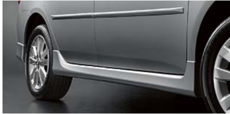
Body side moldings

Add a personal touch to your Corolla with Genuine Toyota accessories. Some accessories may not be available in all regions of the country. See your Toyota dealer for details.