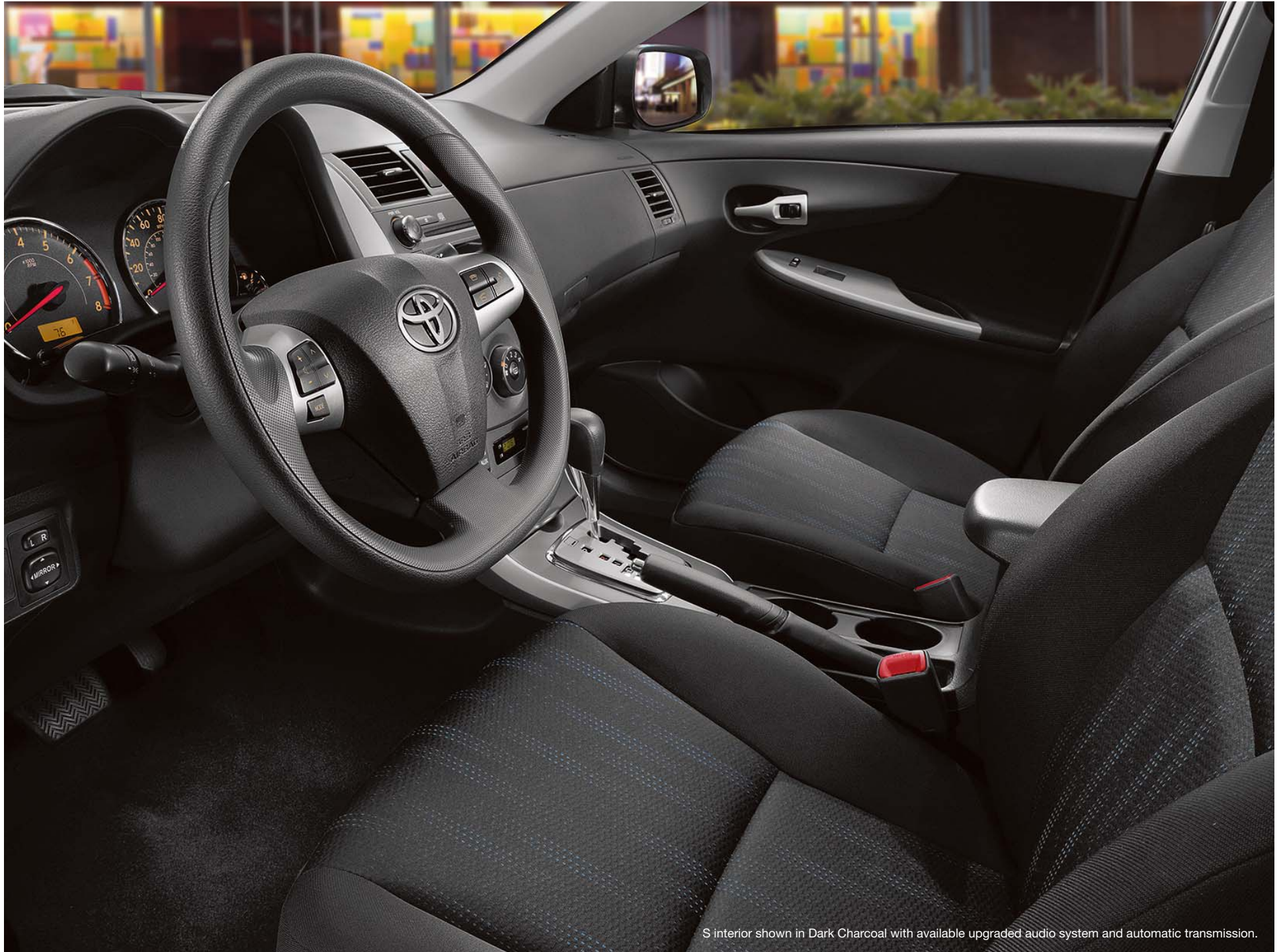
S interior shown in Dark Charcoal with available upgraded audio system and automatic transmission.