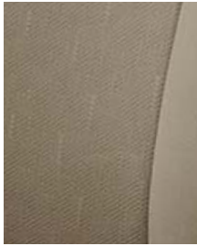
Corolla fabric in Bisque