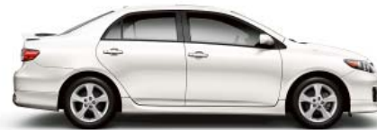
SUPER WHITE Ash, Bisque or Dark Charcoal 1 interior