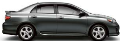
MAGNETIC GRAY METALLIC Ash, Bisque or Dark Charcoal 1 interior