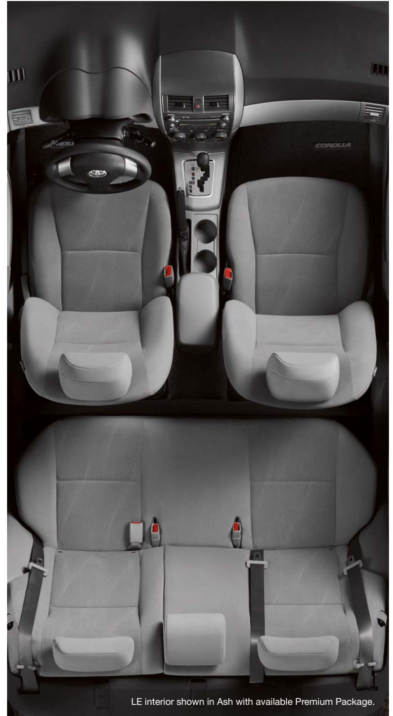
LE interior shown in Ash with available Premium Package.

Corolla may be a compact car, but you wouldn't know it to peek in the trunk. In the back, you'll be pleasantly surprised to find a full 12.3 cubic feet 2 of cargo space for road trip necessities.