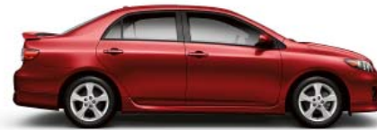
BARCELONA RED METALLIC Ash, Bisque or Dark Charcoal 1 interior