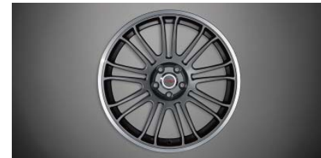
TRD 18-in. multi-spoke alloy wheels

Ashtray cup Auto-dimming rearview mirror BLU Logic® Hands Free System 19 Body side moldings Cargo mat Cargo net Cargo tote