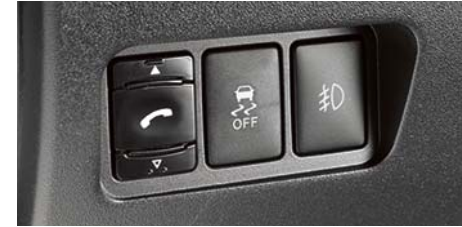
BLU Logic® Hands Free System 19