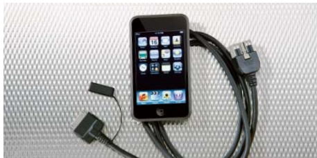
Interface kit 20 for iPod® 11