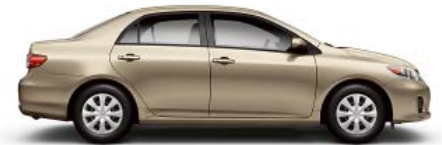
SANDY BEACH METALLIC 2 Bisque interior