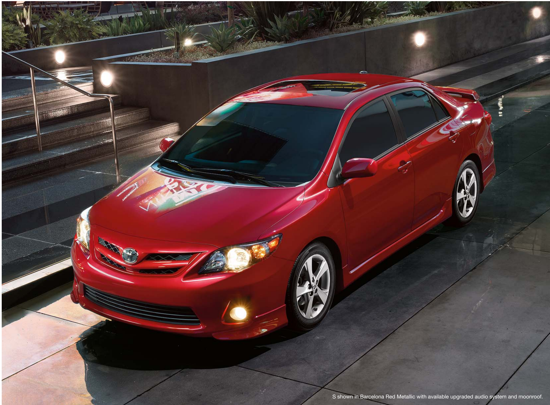
S shown in Barcelona Red Metallic with available upgraded audio system and moonroof.