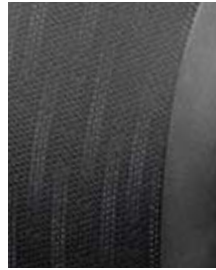
S fabric in Dark Charcoal