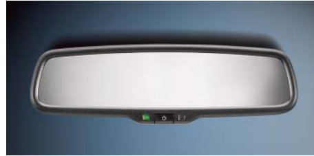
Auto-dimming rearview mirror