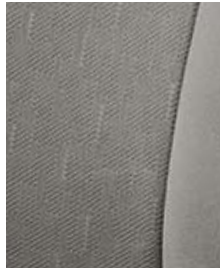
Corolla fabric in Ash