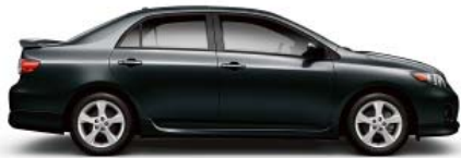
BLACK SAND PEARL Ash, Bisque or Dark Charcoal 1 interior

Corolla offers seven exterior colors to choose from — not surprising, considering Corolla’s accommodating nature. And each exterior color offers two or three interior colors to match. Decisions, decisions.