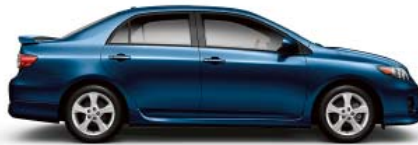
NAUTICAL BLUE METALLIC Ash, Bisque or Dark Charcoal 1 interior