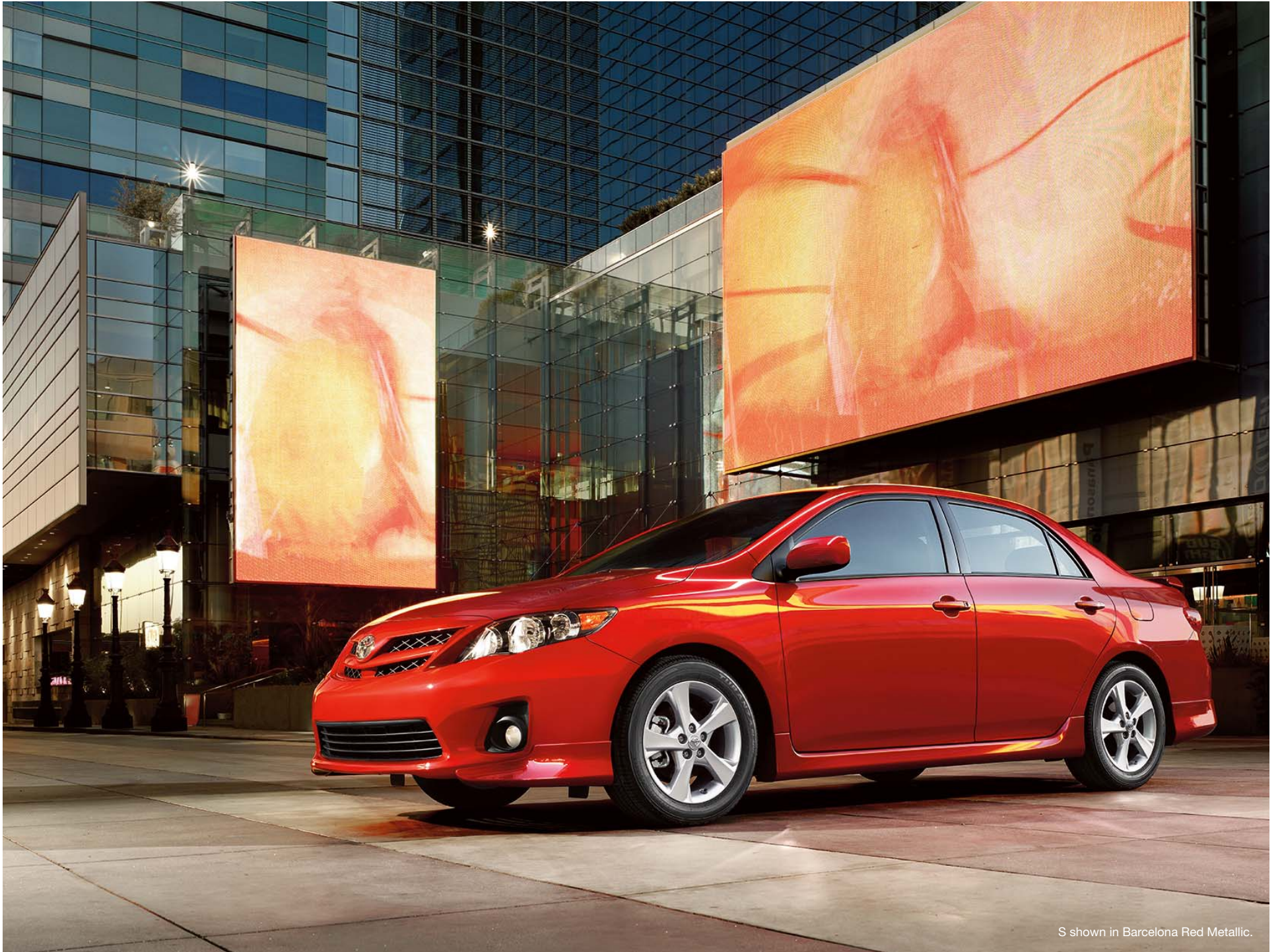
S shown in Barcelona Red Metallic.