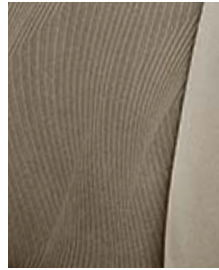
LE fabric in Bisque