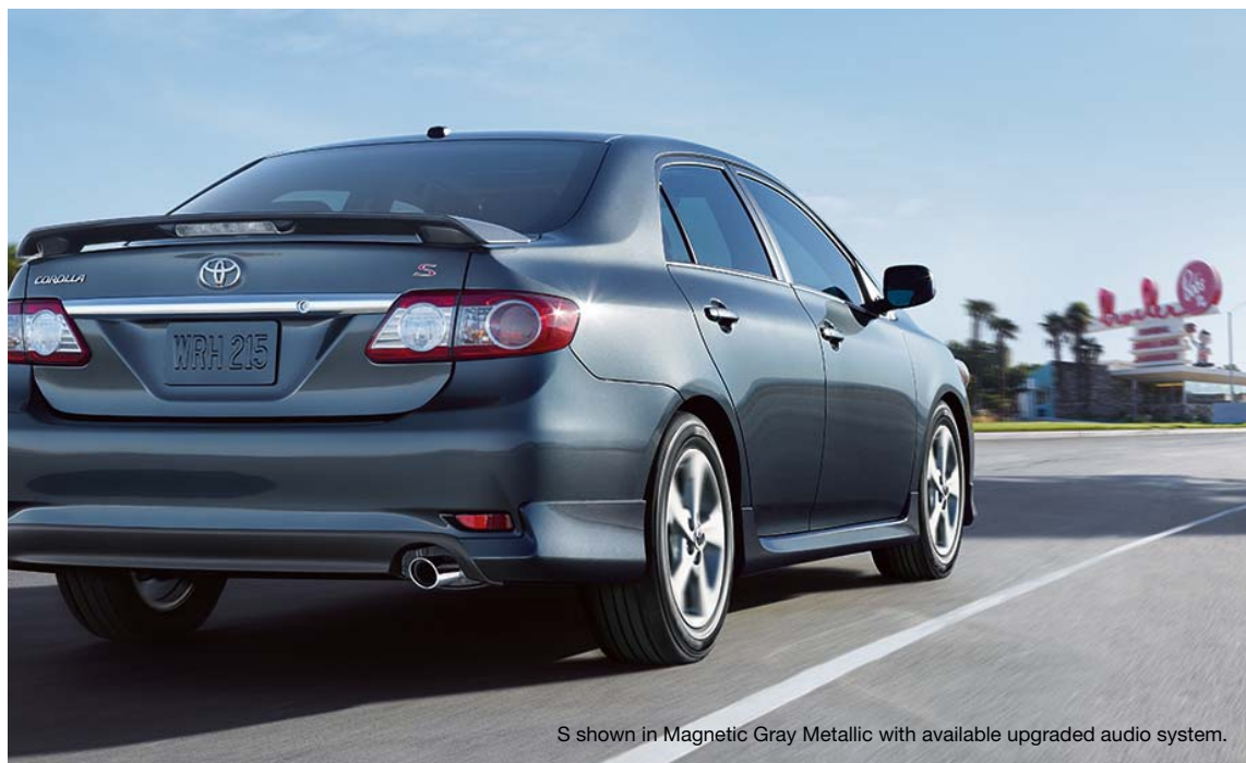
S shown in Magnetic Gray Metallic with available upgraded audio system.

Corolla's impeccable road manners begin with its rigid chassis. Built to resist body flex, it provides a reliable platform so that the suspension can best do its job. The front suspension, mounted to an additional sub-frame to reduce noise and vibration , is tuned for precision handling. In back, the rear suspension employs a torsion-type design that further smooths the ride quality .