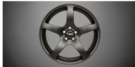
TRD 18-in. 5-spoke wheels (Silver or Black)