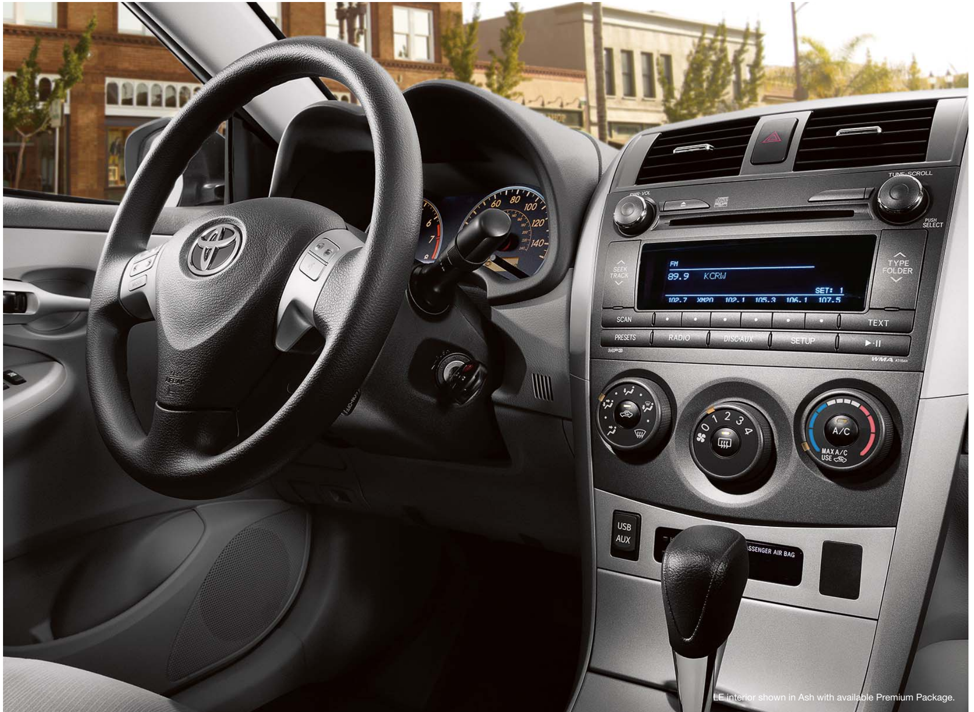
LE interior shown in Ash with available Premium Package.