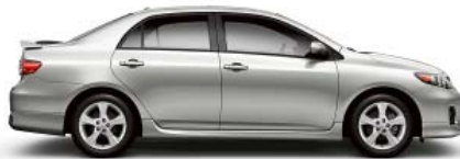
CLASSIC SILVER METALLIC Ash or Dark Charcoal 1 interior