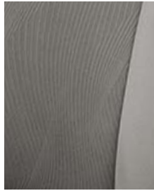
LE fabric in Ash