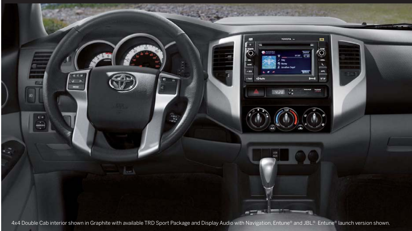
4x4 Double Cab interior shown in Graphite with available TRD Sport Package and Display Audio with Navigation, Entune ® and JBL ® . Entune ® launch version shown.

You'd be hard-pressed to find a compact truck that's more dialed-in than the 2013 Tacoma. Take Tacoma Limited: Inside, you'll find it easy to warm up to, thanks to an available heating feature for the front seats. And the seats are trimmed with SofTex, ® a revolutionary seat material that's more eco-sensitive than leather. Plus, Tacoma hooks you up with available Bluetooth ®1 wireless technology, auxiliary jack, USB port 2 and steering wheel-mounted audio controls. Also available is a rearview mirror that features a 3.3-in. backup monitor, 3 temp gauge, compass and HomeLink ®4 system. Select models offer a premium JBL ® 8-speaker multimedia system with touch-screen navigation 5 and Entune, ®6 Toyota's advanced multimedia system that connects you and your truck with popular mobile applications and data services.