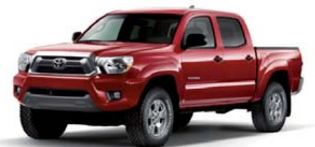
TRD Off-Road Package