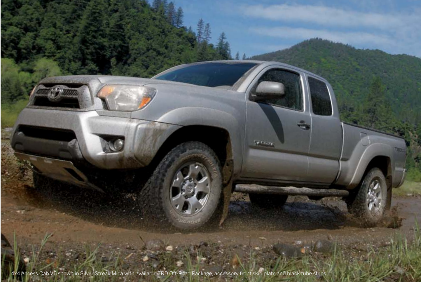
4x4 Access Cab V6 shown in Silver Streak Mica with available TRD Off-Road Package, accessory front skid plate and black tube steps.

Watch out for this one. The 2013 Toyota Tacoma is clearly looking to start something. Like an ATV weekend in the mountains. Or an off-roading trip to the desert. But there's more to this truck than its aggressive new front end. Tacoma is built to finish what it starts. It's forged on massive one-piece frame rails with eight sturdy cross members and a fully boxed front sub-frame. It's got a rugged fiber-reinforced Sheet-Molded Composite (SMC) bed that provides better impact strength than steel. Plus, a leaf spring suspension with staggered outboard-mounted gas shocks. And an available V6 engine with Variable Valve Timing with intelligence (VVT-i) that delivers maximum power on minimum fuel. If you still want to up the ante, it's also got a truckload of extras to choose from: an available TRD Off-Road Package with Bilstein® shocks, 16-in. alloy wheels with P265/70R16 BFGoodrich® tires, Hill Start Assist Control (HAC), 1 Downhill Assist Control (DAC) 2 and an electronically controlled locking rear differential. So, a word to the wise: Try to stay on Tacoma's good side. Get behind the wheel. The 2013 Toyota Tacoma.