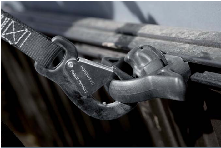
1 STANDARD DECK RAIL SYSTEM