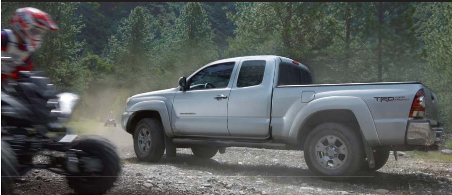
4x4 Access Cab V6 shown in Silver Streak Mica with available TRD Off-Road Package, V6 Tow Package 2 and accessory black tube steps.

You'll know you're getting somewhere in the 2013 Toyota Tacoma with available 4WD. Its two-speed electronically controlled transfer case delivers reliable power transfer to front and rear wheels, while the available P265/70R16 BFGoodrich® tires help ensure tenacious grip. And the available electronically controlled locking rear differential handles the most challenging low-traction conditions with complete confidence. Pulling a trailer? With advanced Trailer-Sway Control (TSC) 1 , Tacoma tows with confidence too. Available TSC enlists the vehicle's stability control sensors to detect side-to-side movement at the rear wheels, then employs the ABS system to help counteract yaw caused by the unwanted trailer motion.