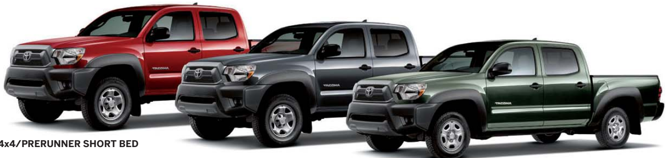
4x4/PRERUNNER SHORT BED