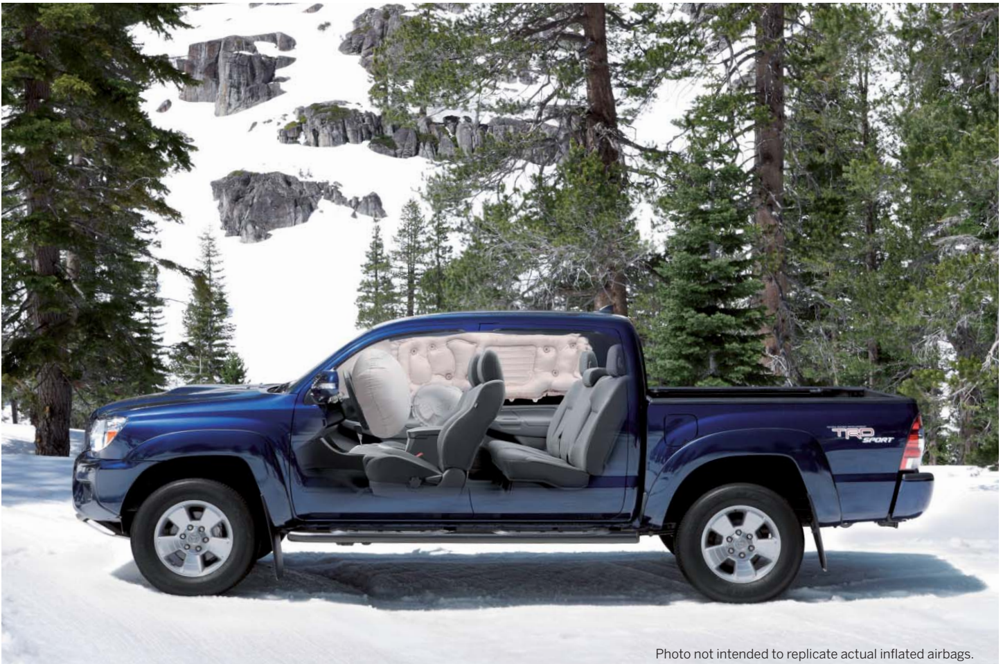
Photo not intended to replicate actual inflated airbags.