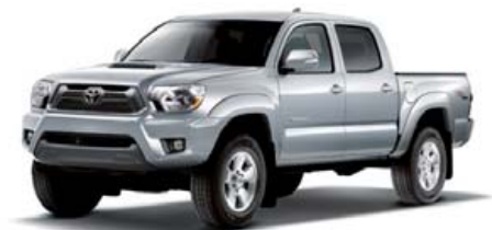
TRD Sport Package