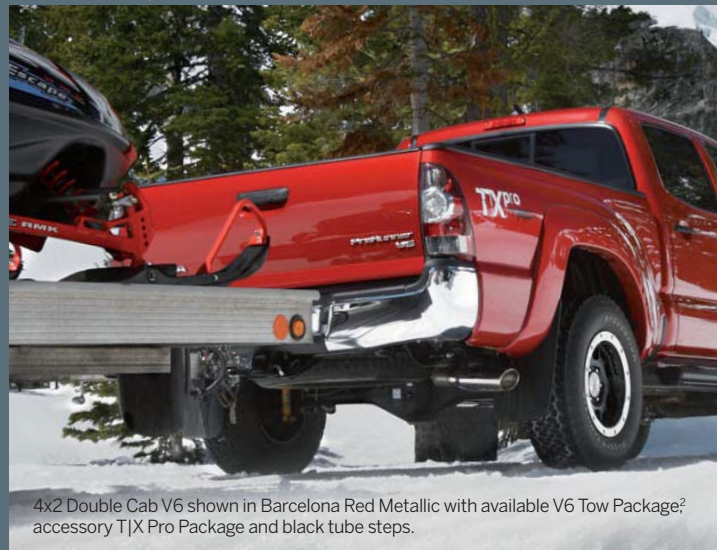
4x2 Double Cab V6 shown in Barcelona Red Metallic with available V6 Tow Package 2 , accessory T|X Pro Package and black tube steps.