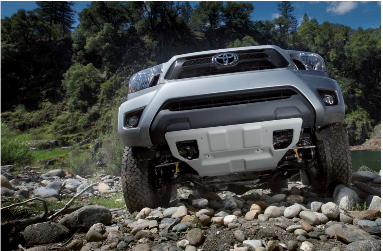
1 ACCESSORY FRONT SKID PLATE