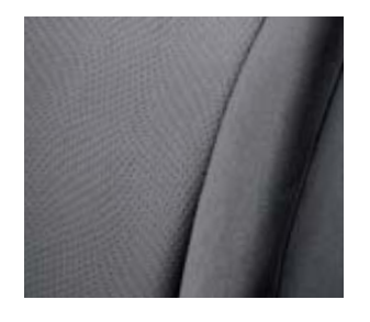
FABRIC in Dark Gray