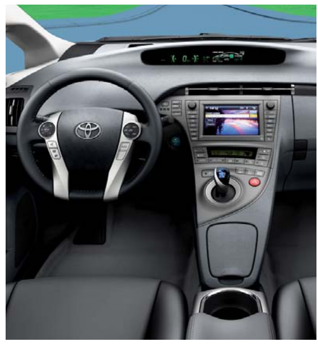
Prius Plug-in Hybrid shown in Clearwater Blue Metallic.