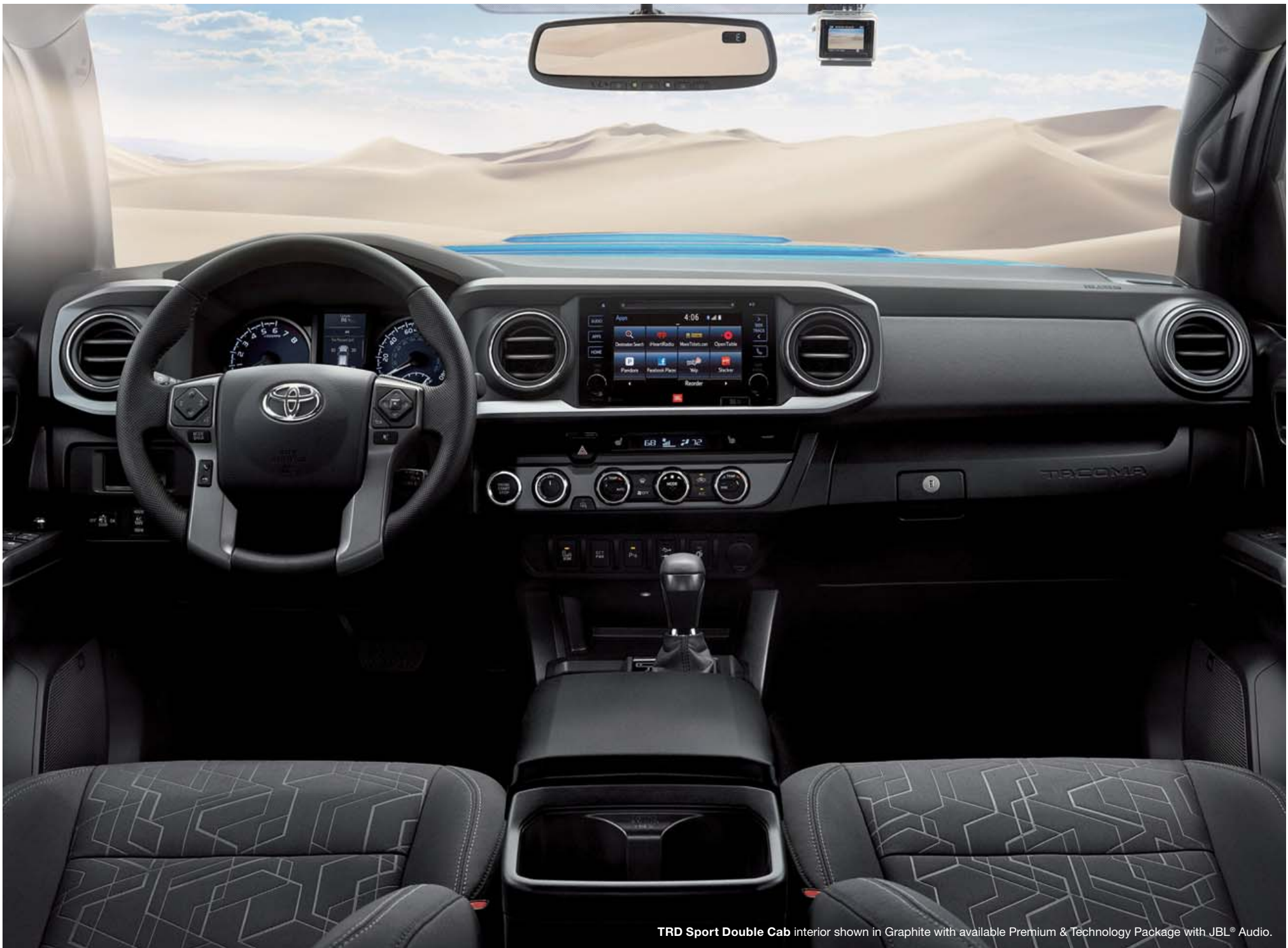
TRD Sport Double Cab interior shown in Graphite with available Premium & Technology Package with JBL® Audio.

GoPro® mount on the windshield is to be used with GoPro HERO cameras. GoPro® camera not included. GoPro, HERO, the GoPro logo, and the GoPro Be a Hero logo are trademarks or registered trademarks of GoPro, Inc. Prototype shown with options. Production model may vary.