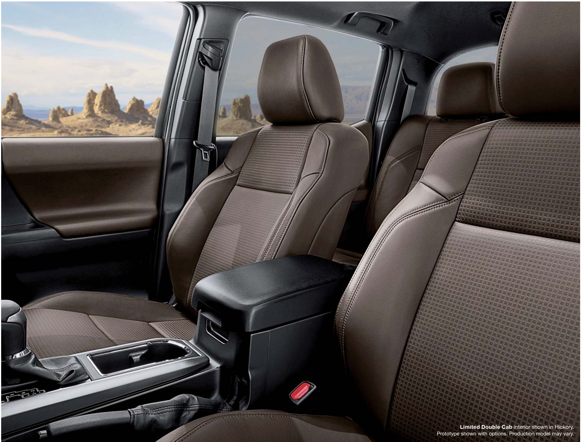
Limited Double Cab interior shown in Hickory. Prototype shown with options. Production model may vary.