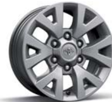
16-in. silver alloy wheel