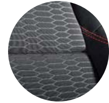
SR5 fabric in Black with red accent stitching