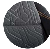
TRD Sport and TRD Off-Road fabric in Black with orange accent stitching