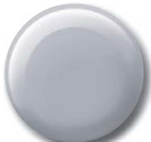
Silver Sky Metallic