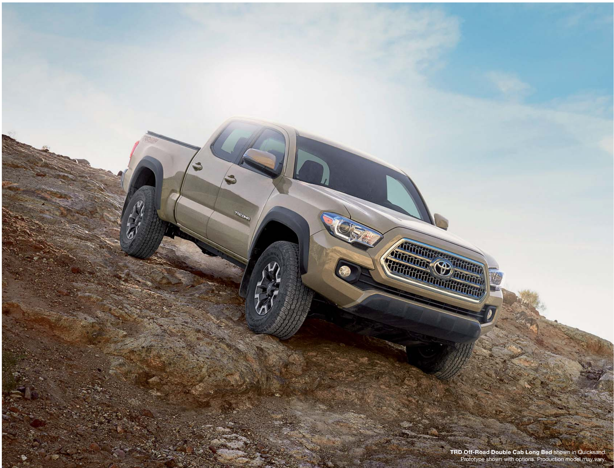
TRD Off-Road Double Cab Long Bed shown in Quicksand. Prototype shown with options. Production model may vary.