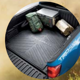
Bed mat 40