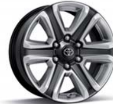
18-in. polished alloy wheel