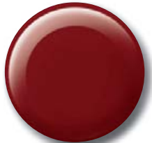
Barcelona Red Metallic