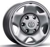
16-in. styled steel wheel