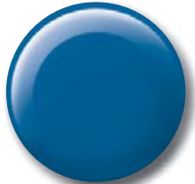
Blazing Blue Pearl