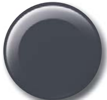
Magnetic Gray Metallic