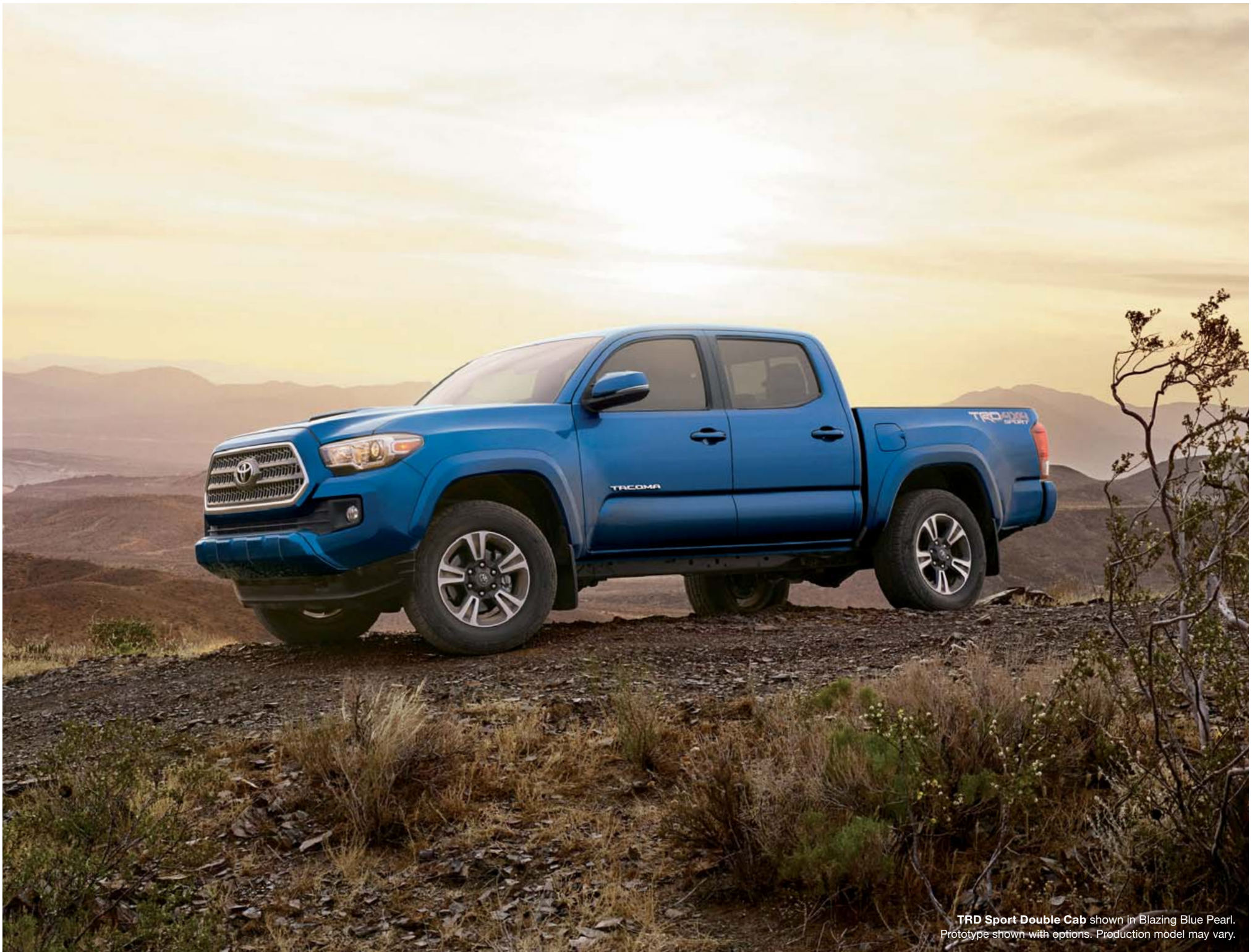
TRD Sport Double Cab shown in Blazing Blue Pearl. Prototype shown with options. Production model may vary.