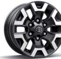
16-in. machined contrast alloy wheel