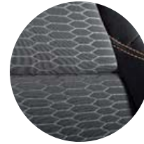
SR5 fabric in Black with caramel accent stitching