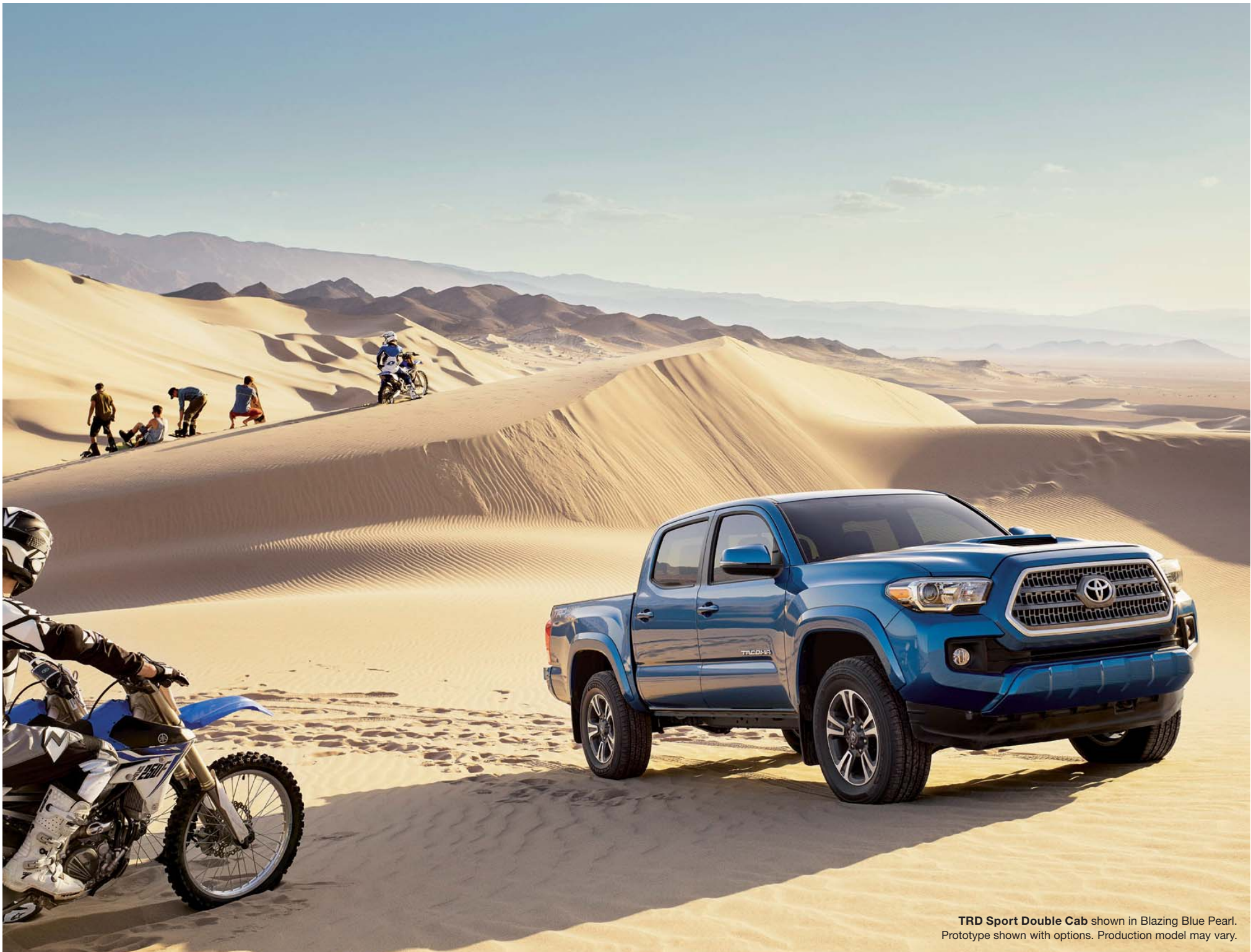
TRD Sport Double Cab shown in Blazing Blue Pearl. Prototype shown with options. Production model may vary.