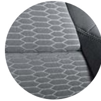
SR and SR5 fabric in Cement Gray