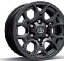
16-in. dark satin alloy wheel