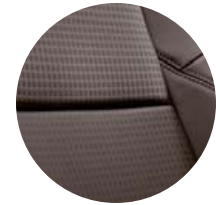
Limited leather in Hickory