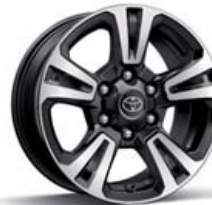
17-in. machined alloy wheel