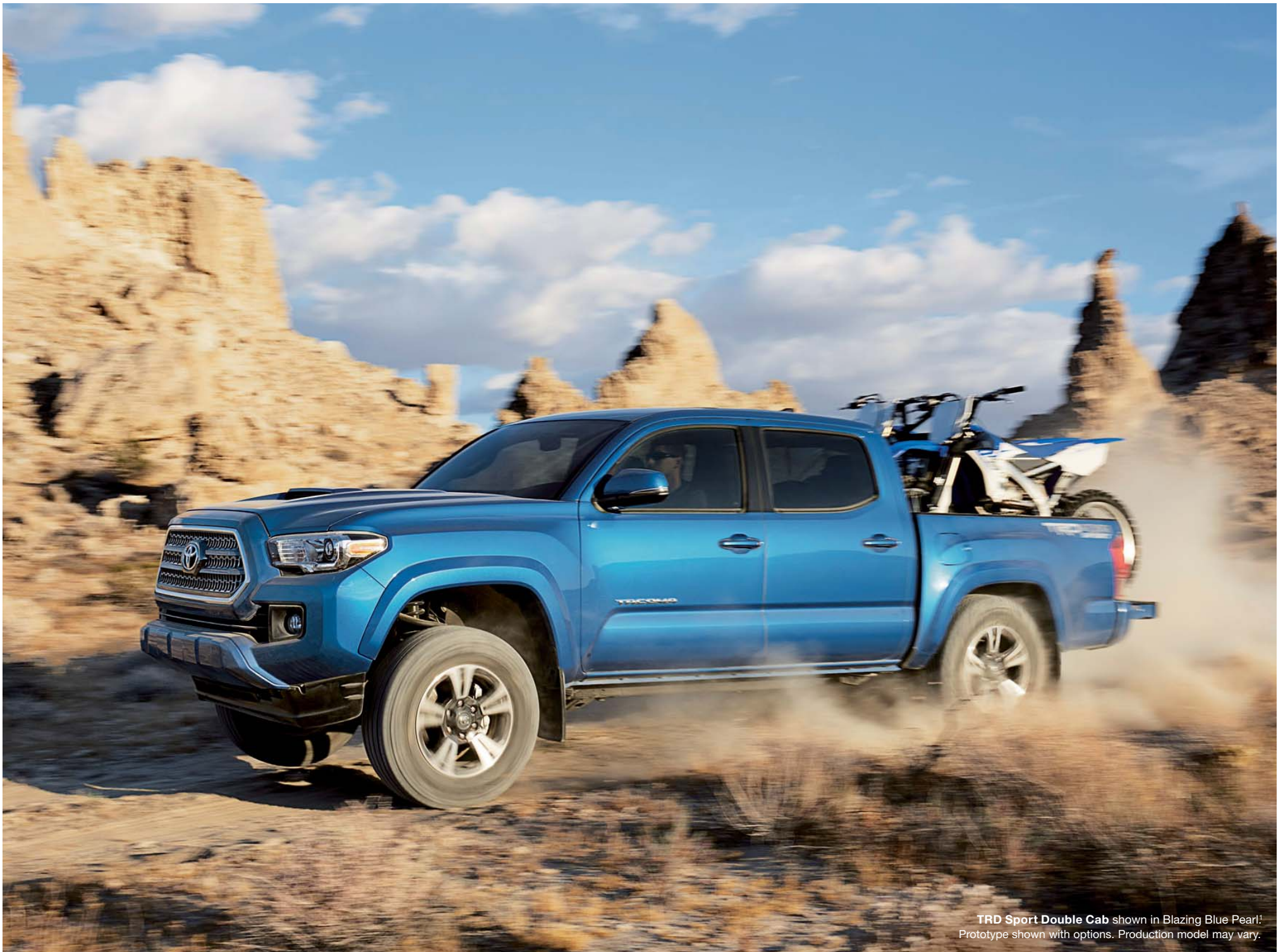
TRD Sport Double Cab shown in Blazing Blue Pearl! Prototype shown with options. Production model may vary.