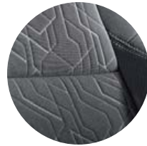
TRD Sport and TRD Off-Road fabric in Graphite