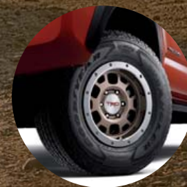
TRD 16-in. off-road beadlock-style wheels