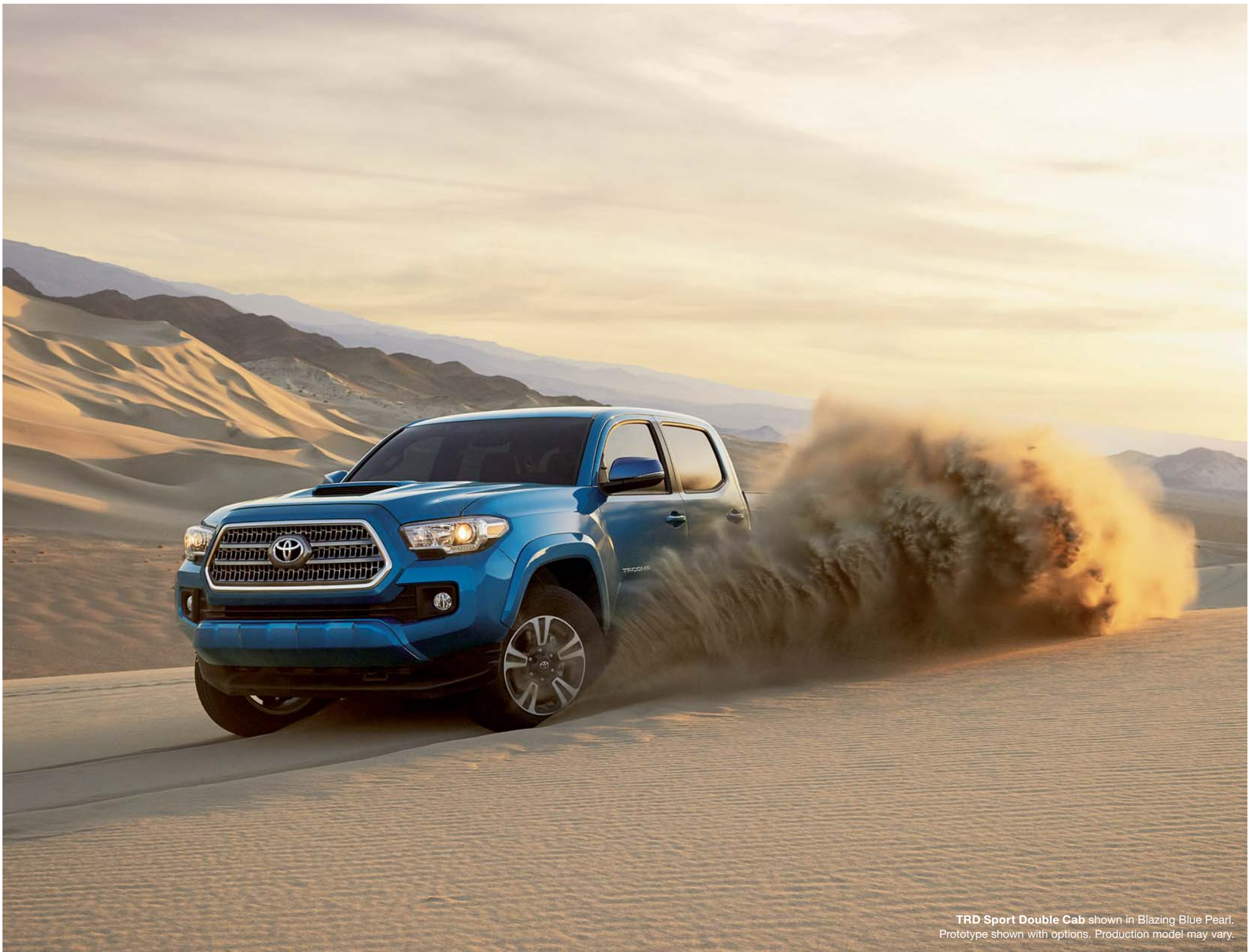
TRD Sport Double Cab shown in Blazing Blue Pearl. Prototype shown with options. Production model may vary.