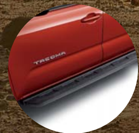
Cast-aluminum running boards

TRD Off-Road Double Cab shown in Quicksand. Prototype shown with options. Production model may vary. See numbered footnotes in Disclosures section.