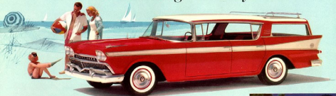
CUSTOM 4-DOOR HARDTOP CROSS COUNTRY