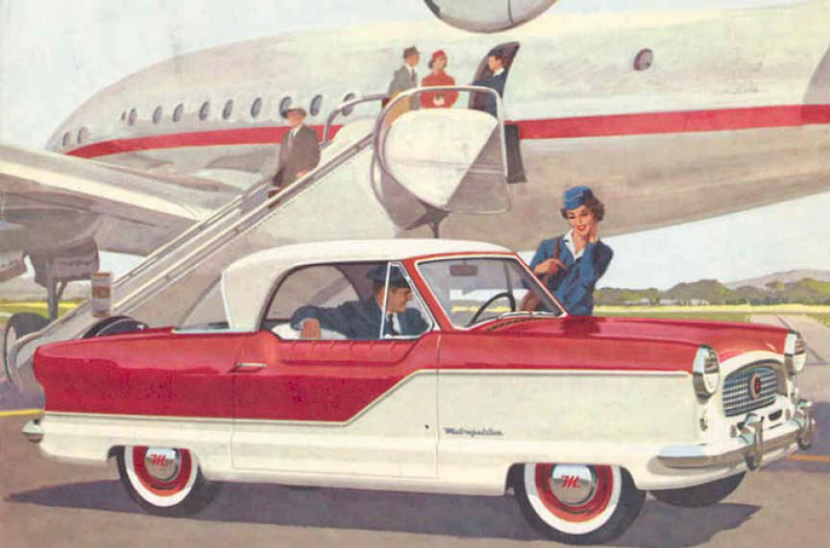
METROPOLITAN "136" HARDTOP COUPE