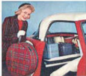
Two-way trunk loading is yours with Metropolitan. Luggage, golf clubs, sports gear, packages or salesman's samples can be loaded in the spacious trunk compartment either by lifting the trunk lid on the outside of the car or from inside the passenger compartment in case of inclement weather. Another example of Metropolitan versatility and convenience.

World-famous Weather Eye Heating, Ventilating and Defrozing System filters, heats and circulates warm fresh air to keep all passengers warm as-tout on the coldest days. The fresh air intake is located at cowl level above the hood, above the level of exhaust fumes from cars ahead. Weather Eye has long been recognized in the world's most efficient car heating and ventilating system. Constant-speed electric windshield wipers are standard.